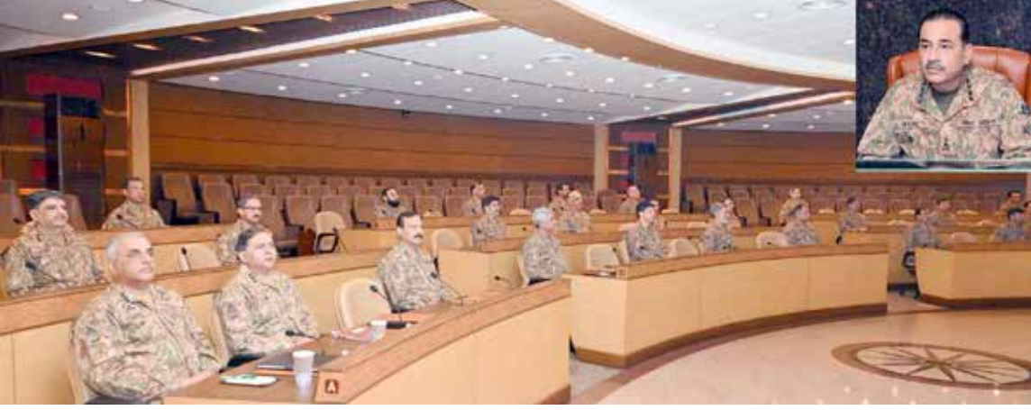
RAWALPINDI: Army Chief General Asim Munir addressing Corps Commanders Conference.

STAFF REPORT ISLAMABAD: Pakistan Tehreek-e-Insaf (PTI) on Thursday condemned the "torture" and arrest of the party's Vice Chairman Shah Mahmood Qureshi, calling on the Supreme Court to take a suo motu notice of the matter. The senior politician was taken into custody on Wednesday by Rawalpindi police from Adiala jail in connection with a case related to May 9 violent protests, a day after being detained under Section 3 of the Maintenance of Public Order (3-MPO) following approval of his bail in the cipher case last week. The former ruling party maintains that Qureshi's latest arrest was "illegal" as he had been bailed out by the apex court and the orders for his detention under the 3-MPO were also withdrawn soon after being issued.