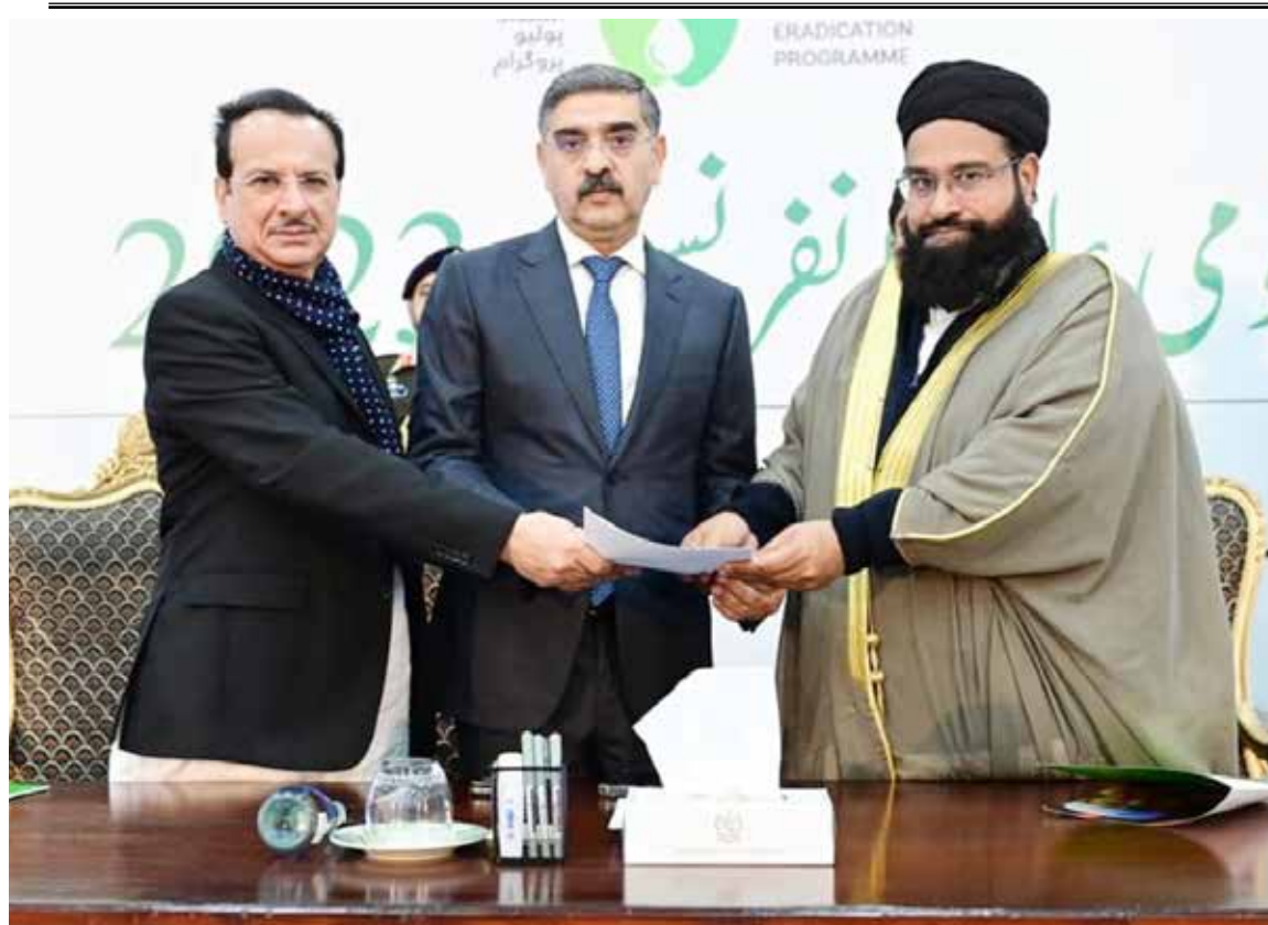
ISLAMABAD: Caretaker Minister for National Health Services, Regulations & Coordination Dr. Nadeem Jan and Special Assistant to PM for Inter-Faith Harmony Maulana Tahir Ashrafi presenting Caretaker PM Anwaar-ul-Haq Kakar with the Islamabad Declaration supporting immunization and Polio Eradication at the conclusion of National Ulema Conference.

ISLAMABAD: One woman was killed and several others injured in an accident occurred due to dense fog on the Grand Trunk (GT) Road near Chungi No 5 in Jhelum on Thursday. According to rescue sources, around 10 vehicles collided with each other as the visibility turned almost zero due to dense fog, as a result, one woman was killed and 30 others injured, private news channels reported. Police and rescue teams reached the spot and shifted the injured to the hospital. Five of the injured were said to be in critical condition, rescue sources added.