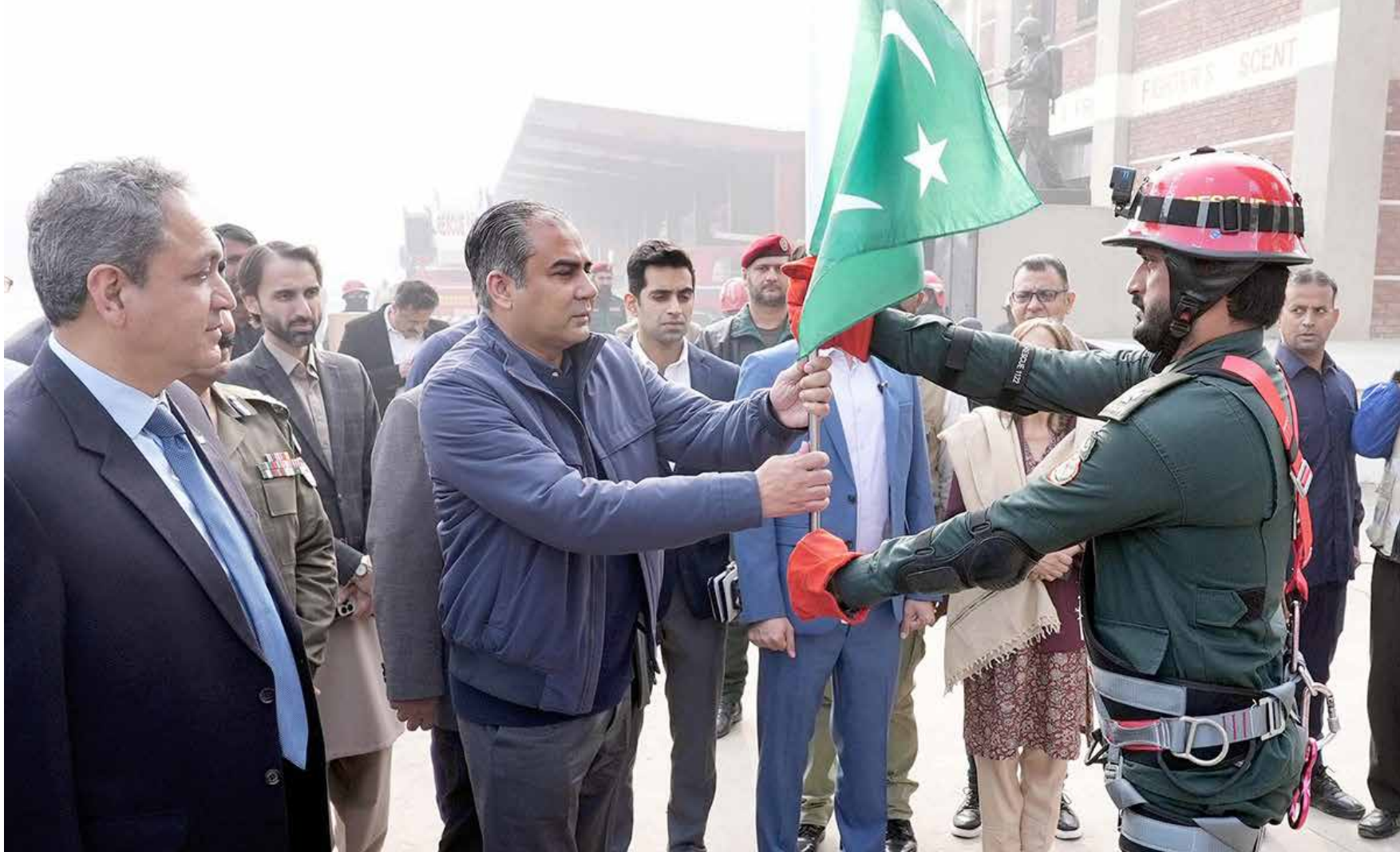
LAHORE: On the occasion of the passing out parade of the rescuers of the four provinces at the Punjab Emir Sexual Services Academy, the rescuers who landed on the ground with the help of a rope from the high-rise fire tower presented the national flag to CM Mohsin Naqvi.

FROM PAGE 01 Following a thorough review, the Returning Officer rejected objections, allowing Nawaz Sharif to contest the elections from NA-15 Manshera. ECP fails to curb ongoing spree of abduction, harassment of PTI candidates, seconders, proposers PTI President district Attock vows to chant 'Imran Khan Zindabad' slogan despite all odds Raja Basharat's lawyer says RO refused to allow scrutiny of nomination papers