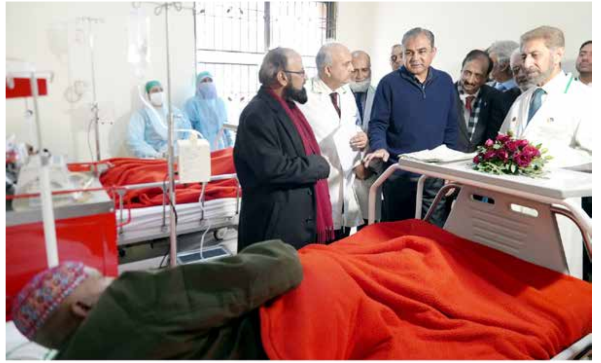
LAHORE: Punjab Chief Minister Mohsin Naqvi talking to a cancer patient undergoing treatment at the hospital after inaugurating Cancer Care Hospital Manawan in Punjab's first government-built cancer hospital.

time fight to foster gender equality while minimizing poverty by using an all-encompassing and integrated approach. Acknowledging the connections between gender issues and poverty is crucial, as is working together to address them with the help of communities, NGOs, governments, and the commercial sector. The opportunity to evaluate the progression and pinpoint persistent impediments limiting success was offered by this series of consultations organized around Pakistan. Balochistan Caretaker Minister for Home and Tribal Affairs Muhammad Zubair Jamali applauded the accomplishments of NCSW, saying that women in Balochistan are progressive, viable, and performing their roles in every area. With emphasis on women's education, he declared that the government of Balochistan will continue to work to reinforce state institutions for women's empowerment in every aspect of life. "We will investigate the forum's proposals with the help of NCSW and UN partners. Due to how closely related the problems of gender equality and poverty are, we must work collaboratively to forge a more equal and prosperous future. We understand that many of our fellow citizens.--APP