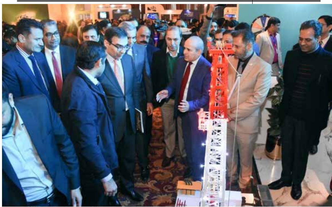
ISLAMABAD: Minister for Energy visiting stalls at Oil, Gas and Minerals Career Expo in Islamabad.