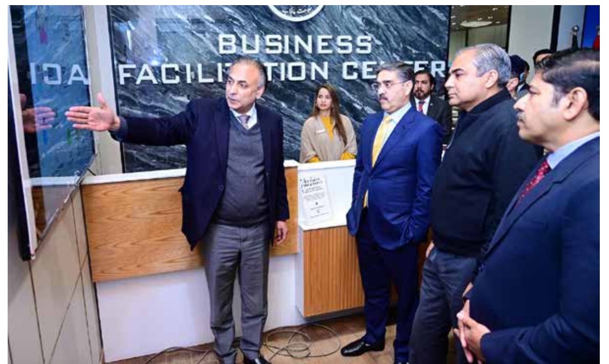
LAHORE: Caretaker Prime Minister Anwaar-ul-Haq Kakar receives briefing about the overall working and current progress of the Business Facilitation Center in Lahore.

Earthquake of 7.6 magnitude strikes Japan