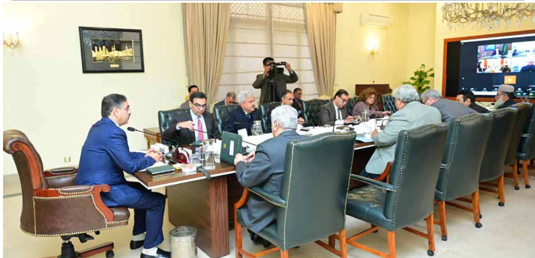
ISLAMABAD: Caretaker Prime Minister Anwaar-ul-Haq Kakar chairs a meeting on availability of Urea Fertilizer in the country on 1 January 2024.