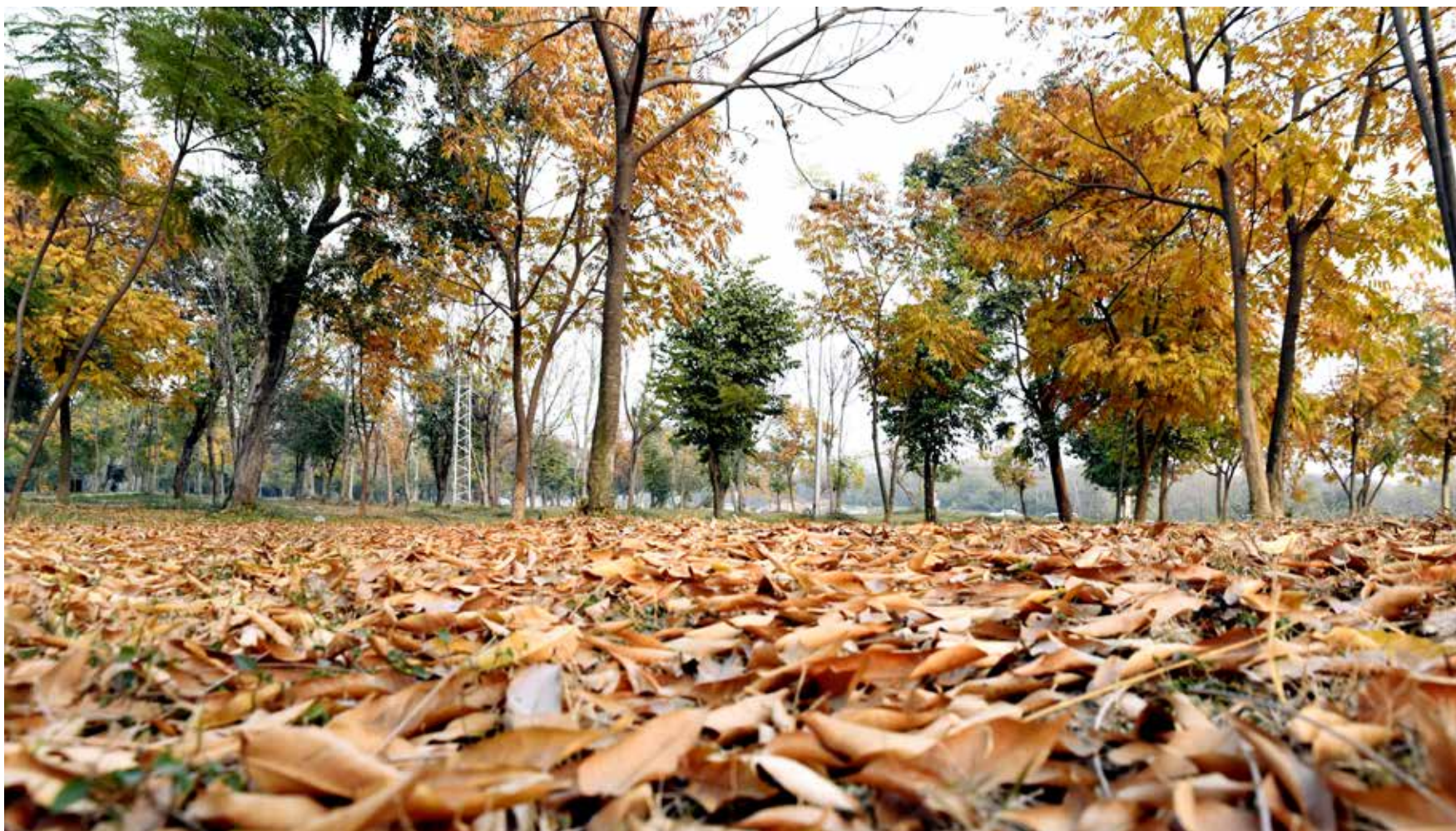
ISLAMABAD: An enchanting tableau of fallen leaves, gracefully announcing the advent of a new season.

DNA ISLAMABAD: A total of 248 people had been killed in multiple incidents of violence across Indian Illegally Occupied Jammu and Kashmir (IIOJK) by the Indian forces, according to an annual review report titled 'Human Rights Situation in IIOJK' released by Legal Forum for Kashmir (LFK). The armed action of India's occupying forces against the native population as a result of heightened military presence has resulted in the killing of 82 indigenous freedom fighters from January to December 2023, said a press release. According to the LFK annual report, January-December 2023 saw a new trend of state repression and counter-insurgency operations in the war-torn region of IIOJK. On the ground, the violations of International Human Rights law (IHRL) and International Humanitarian law (IHL) led to appalling human tragedies. Indian occupying authorities and the occupying forces stationed in IIOJK have perpetrated a series of 'Atrocity crimes': Indian occupying forces persisted in their repressive policies and disregard for international law and the principle of the Right of Self-determination.