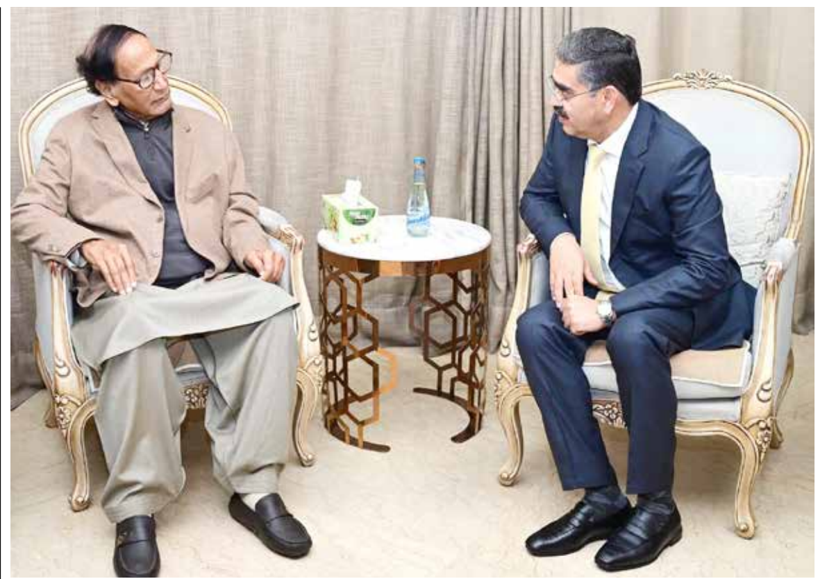
LAHORE: Caretaker Prime Minister Anwaar-ul-Haq Kakar meets with the President of Pakistan Muslim League (Q) Chaudhry Shujaat Hussain.