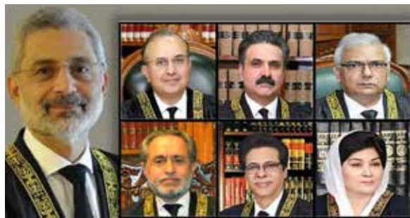
CJP Qazi Faez Isa (left) (clockwise) Justice Syed Mansoor Ali Shah, Justice Yahya Afridi, Justice Aminuddin Khan, Justice Jamal Khan Mandokhel, Justice Muhammad Ali Mazhar, and Justice Musarat Hilali.

'Even Quaid-e-Azam would have been disqualified under Article 62(1)f'