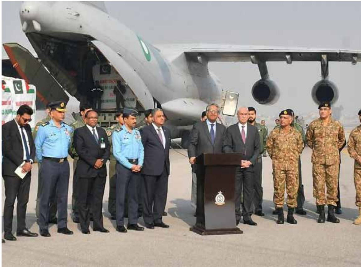
Islamabad : The Government of Pakistan dispatched the third consignment of relief goods for the people of Gaza. Foreign Minister Jalil Abbas Jilani sent off the cargo with a special Pakistan Airforce aircraft at Noor Khan Airbase.