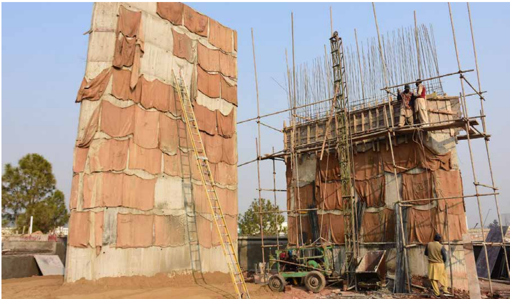
ISLAMABAD: Laborers are busy during the construction of "Yadgar-e-Dastoor" in the memorandum of the completion Golden Jubilee of Constitution of Pakistan outside Parliament House in Federal Capital.

ISLAMABAD : The Election Commission of Pakistan's (ECP) monitoring teams have started removing the illegal advertisement hoardings of the candidates aspiring to participate in the elections of National and Provincial assemblies. Monitoring teams deployed nationwide are currently removing advertisement hoardings that exceed prescribed limits, stated an official of the Election Commission of Pakistan (ECP). According to the Election Commission of Pakistan (ECP), the monitoring teams in Multan and Sialkot are removing promotional materials of candidates who have erected advertisement hoardings in contravention of the code of conduct. In accordance with the Election Commission of Pakistan's Code of Conduct issued on December 20, 2023, individuals and political parties are prohibited from affixing or distributing posters, handbills, pamphlets, leaflets, banners, or portraits larger than the specified sizes outlined by the ECP.—APP