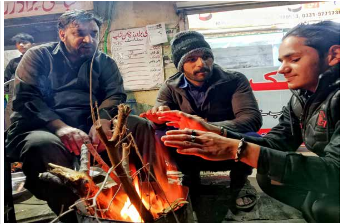
ISLAMABAD: In response to the biting cold wave currently enveloping the capital, resilient citizens have gathered around warming fires, seeking solace and comfort in the midst of the chilly weather.—Mudassar Raja

sequently, he announced strict action against individuals driving without licenses. The chief minister also shared achievements in traffic management, revealing a significant reduction in the time it takes to issue driving licenses. Earlier, 245 licenses were generated in Lahore every day, now 3 licenses are generated per second. During the last '60s or '70s, there were 6.5 million driving licenses, now their number has increased to 11.5 million; he remarked and noted that 200 crores have been earmarked for the police martyrs' families. Meanwhile, CTD and elite police training schools have been upgraded as well. Patrolling police has also done a good job for axle-load management. He highlighted cost savings in the construction of safe city projects in Faisalabad, Gujranwala, and Rawalpindi, underscoring the commitment to fiscal responsibility. The CM announced that 4.9 billion rupees will be spent to construct safe city projects in 18 other cities. It is hoped that safe city projects will be inaugurated in 21 districts by Jan 31. Alongside this, he highlighted the ongoing construction of a new GOR for the police comprising 313 houses and apartments being constructed at the Qurban Lines. He commended the reduction in crime rates by 30 percent and the high public satisfaction rate of 97% with police performance.