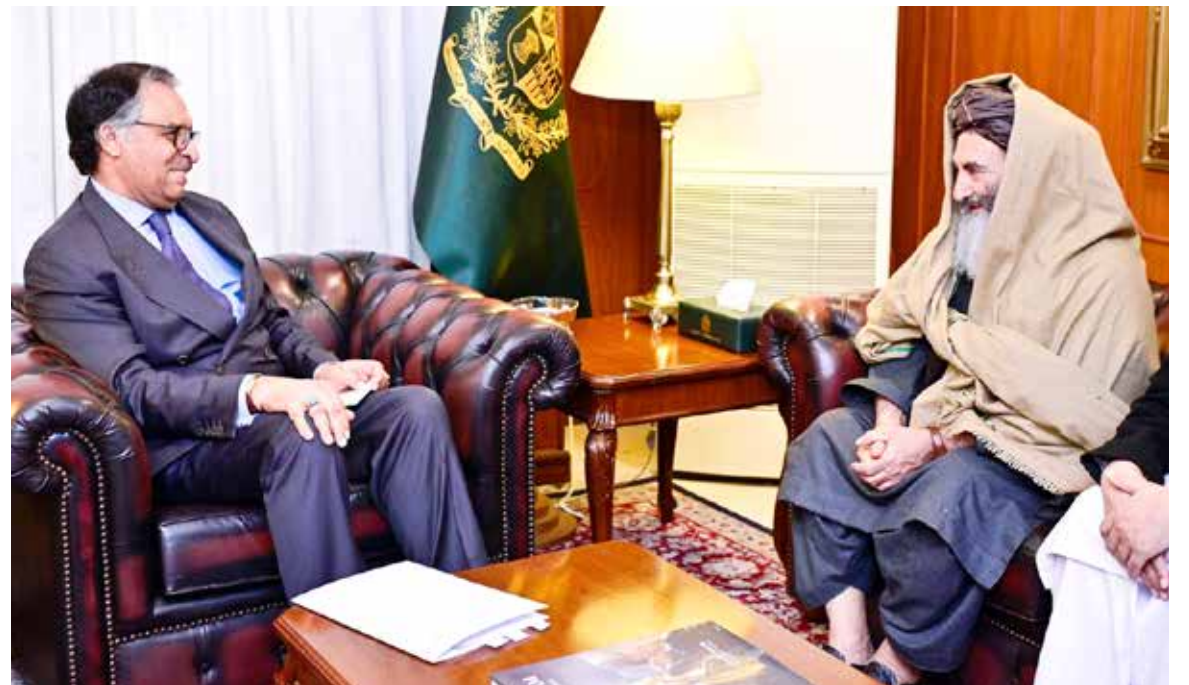
ISLAMABAD: Caretaker Foreign Minister, Jalil Abbas Jilani meets with Mullah Shirin, Governor of Kandahar and reaffirmed Pakistan's commitment to continued engagement & mutually beneficial ties with Afghanistan.

Government and brotherly people of Iran in this hour of grief and tragedy. Pakistan believes that terrorism is a menace and threat to regional and global peace and security. It needs to be confronted through bilateral and regional cooperation.