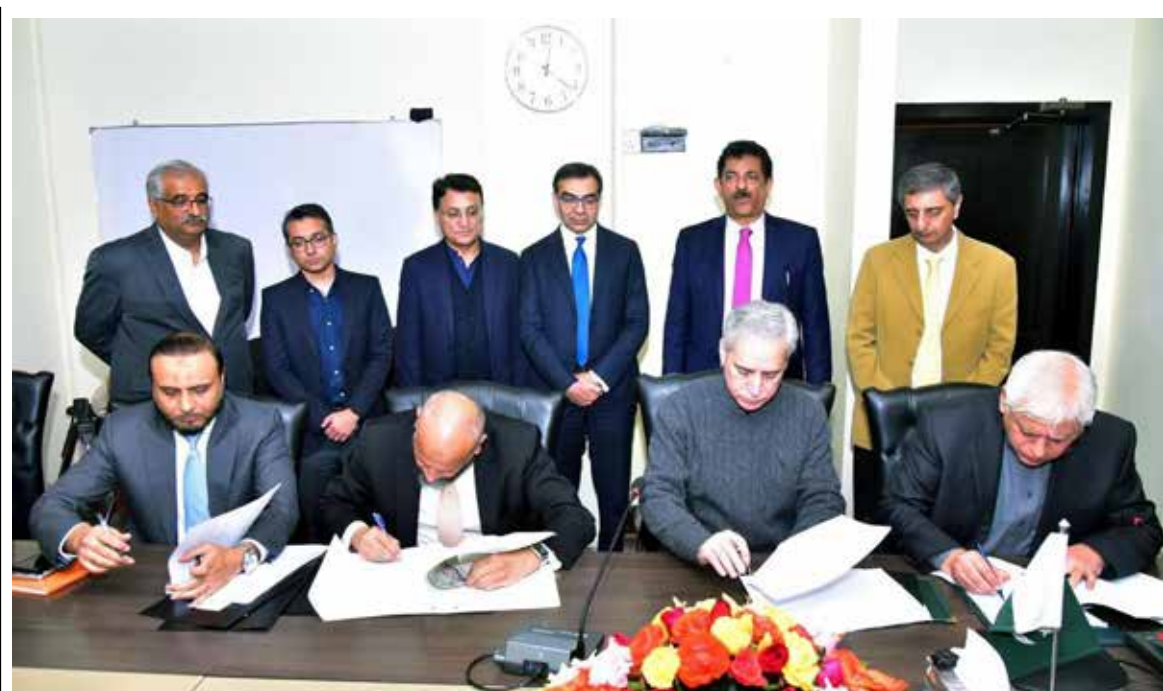
ISLAMABAD:- Power Division and K-Electric ink landmark agreements, in the presence of Minister for Energy Muhammad Ali, providing energy security for Karachi at Power Division.