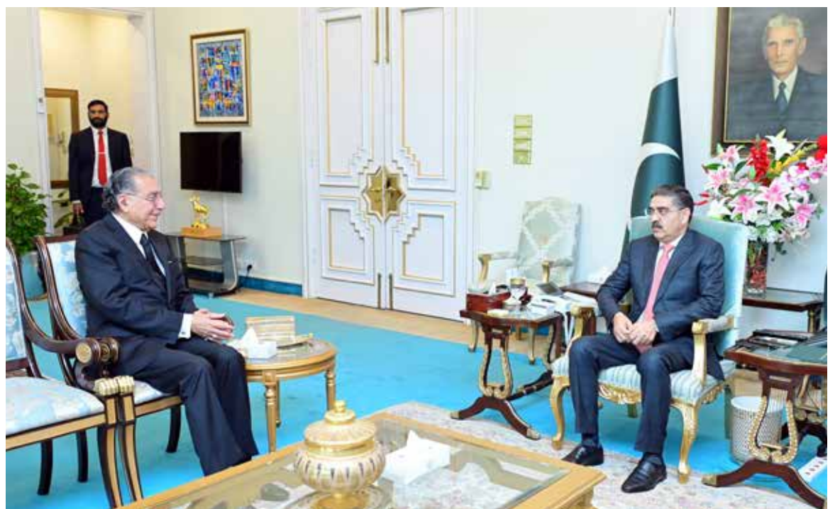
ISLAMABAD: Pakistan's Permanent Representative in UN Muneer Akram calls on caretaker Prime Minister Anwaar-ul-Haq Kakar in Islamabad.