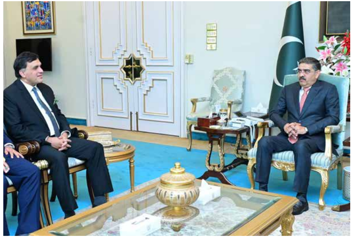
ISLAMABAD: Pakistani High Commissioner in the UK Dr. Muhammad Faisal called on caretaker Prime Minister Anwaar-ul-Haq Kakar in Islamabad. —DNA

committed to standing behind Palestine in its quest for sovereignty. Senator Maulvi Faiz Muhammad expressed his steadfast support for the Palestinian cause and pledged to continue backing it. Speaking on a point of public importance, Senator Dost Muhammad Khan urged the government to address the issues facing ex-FATA, emphasizing the importance of providing the region with its committed share.