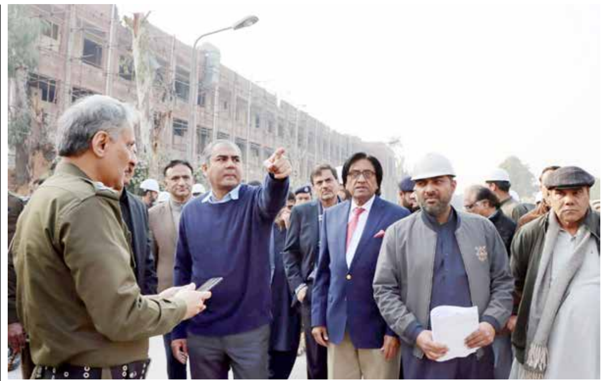
RAWALPINDI: Punjab Chief Minister Mohsin Naqvi giving instructions on the occasion of visiting Holy Family Hospital Upgradation Project.

modate more 450 students now in morning and evening shifts." T Krenovatedin two schools, whose capacities were increased with the construction of additional floors, renovation of old buildings as well as the provision of school furnitureestablishment of computer laboratory, modern science laboratory, library and the installation of solar energy at the premises to fulfill the l energy requirement of the said schools. After the ribbon-cutting ceremony and school bell ringing by Minister Rana Hussain and Consul General Cemal Sangu, nearly five hundred students resumed education in their newly renovated schools. Turkish Cooperation and Coordination Agency, with its two offices in Pakistan, continues to contribute to the development of friendly and brother country Pakistan in the field of education with the projects which have been carried out since 2010.