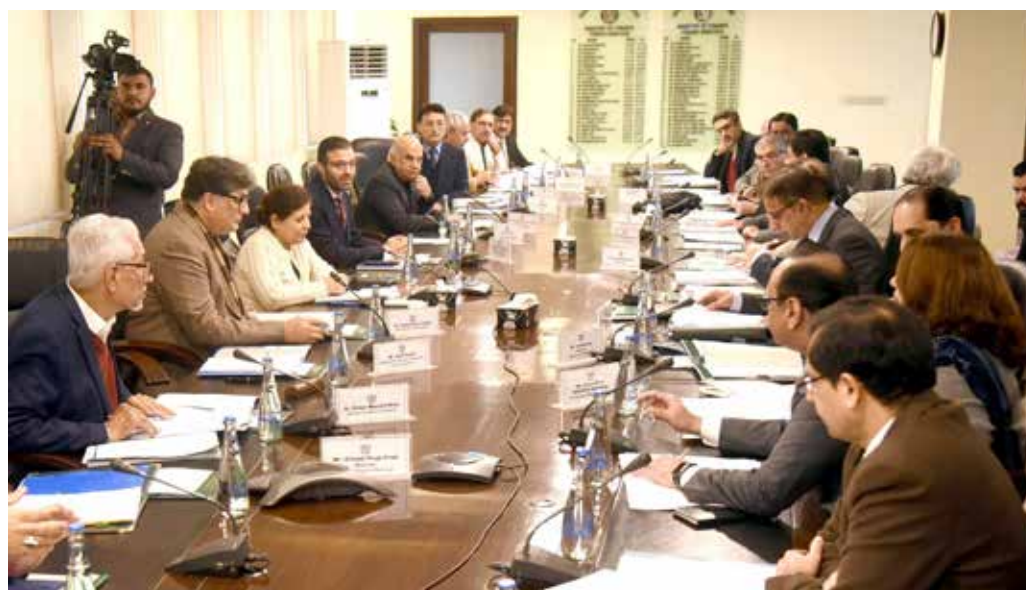
ISLAMABAD : Minister for Finance, Revenue and Economic Affairs, Dr. Shamshad Akhtar chairing a meeting of Economic Coordination Committee of the Cabinet.

nis) with India and other mind games like scrabble and chess. The Committee approved provision of additional funds amounting Rs. 100 Million as Technical Supplementary Grant (TSG) for FY 2023-24.