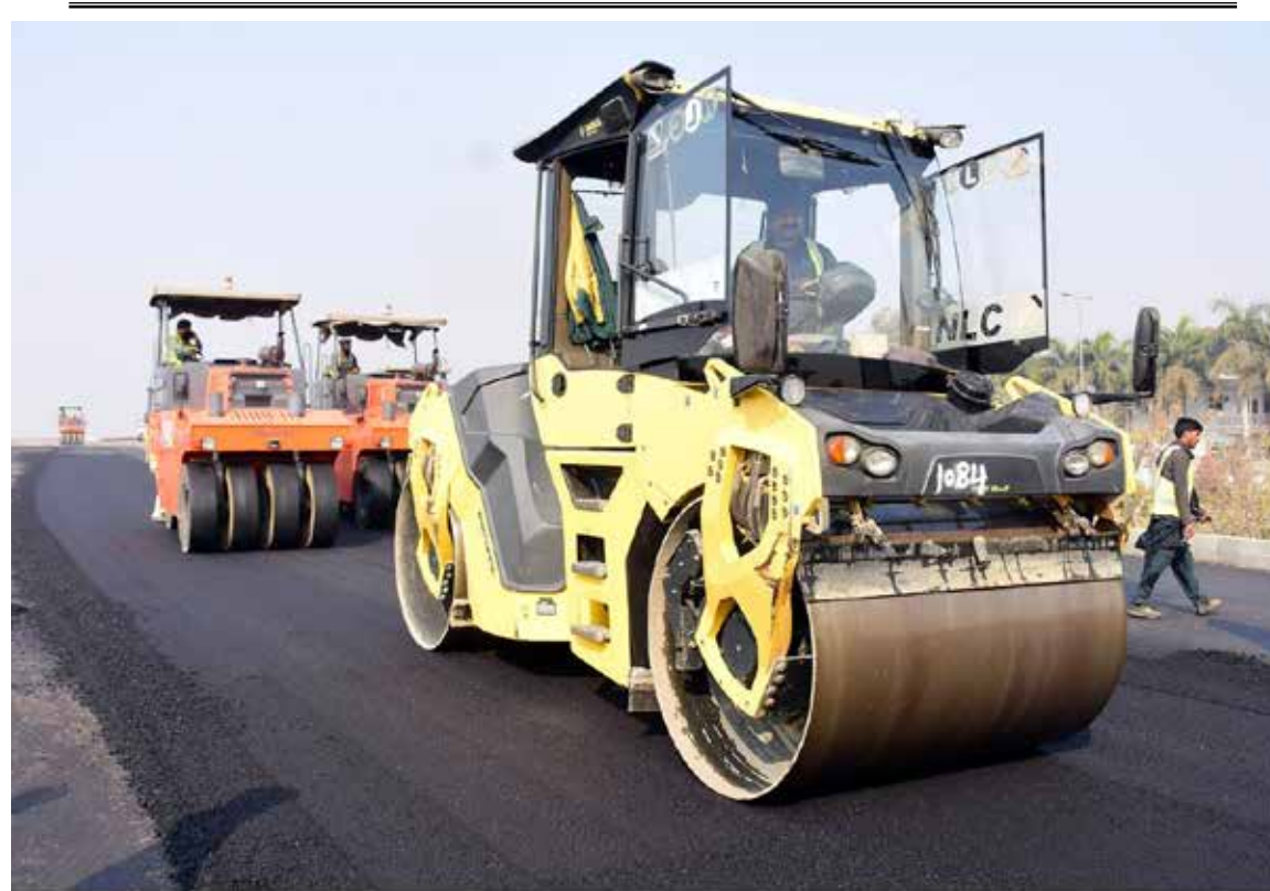
ISLAMABAD: Laborers are busy in carpeting of the road on E-11 Fly over as such project is on its final stage and soon will seem open for public in Federal Capital.