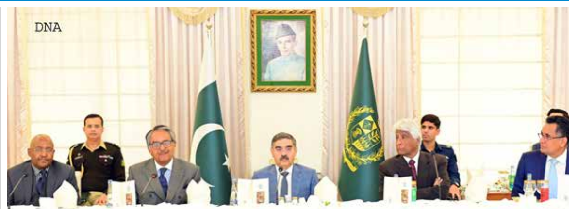
ISLAMABAD: PM Anwaarul Haq Kakar meeting with the envoys of the African and Asian countries. Seen in picture with her are High Commissioners of South Africa, Mauritius and Bangladesh.