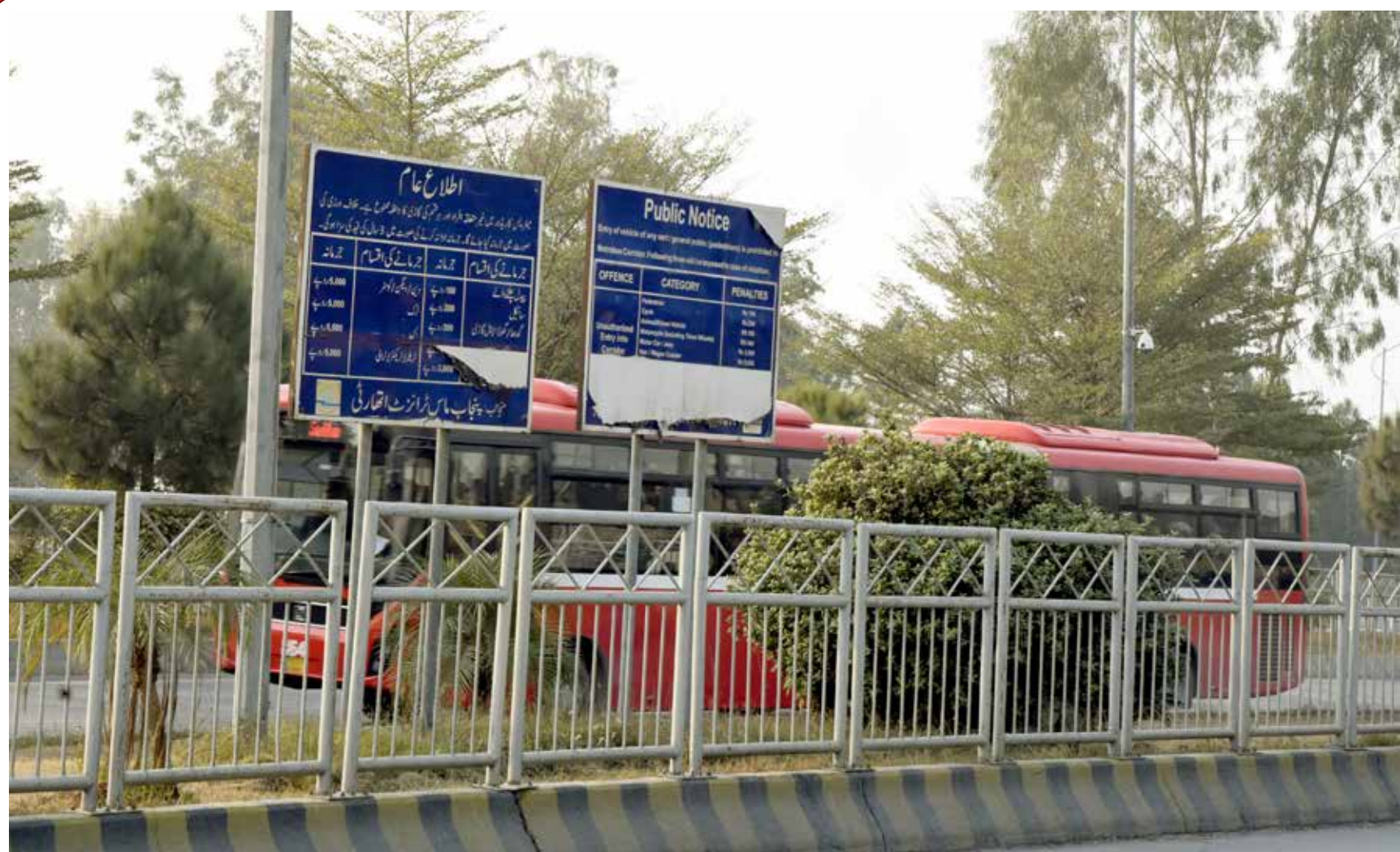
ISLAMABAD: Sign boards installed along the Metro bus route have been mutilated due to which the information mentioned on these boards is no longer readable. The general public has urged the Capital Development Authority (CDA) authorities to take necessary actions to address this issue and improve the situation.