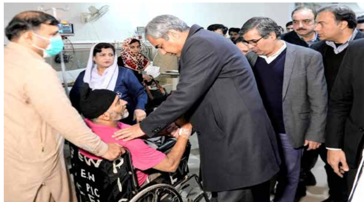
LAHORE : Chief Minister Mohsin Naqvi inspects the well-being of a wheelchair-bound patient during a visit to the new Emergency hospital of the Punjab Institute of Cardiology.

ther directed that the finishing touches should be completed expeditiously with high standards. The CM also emphasized the need for the timely completion of all tasks while maintaining the quality of work. Principal KEMU was also present.