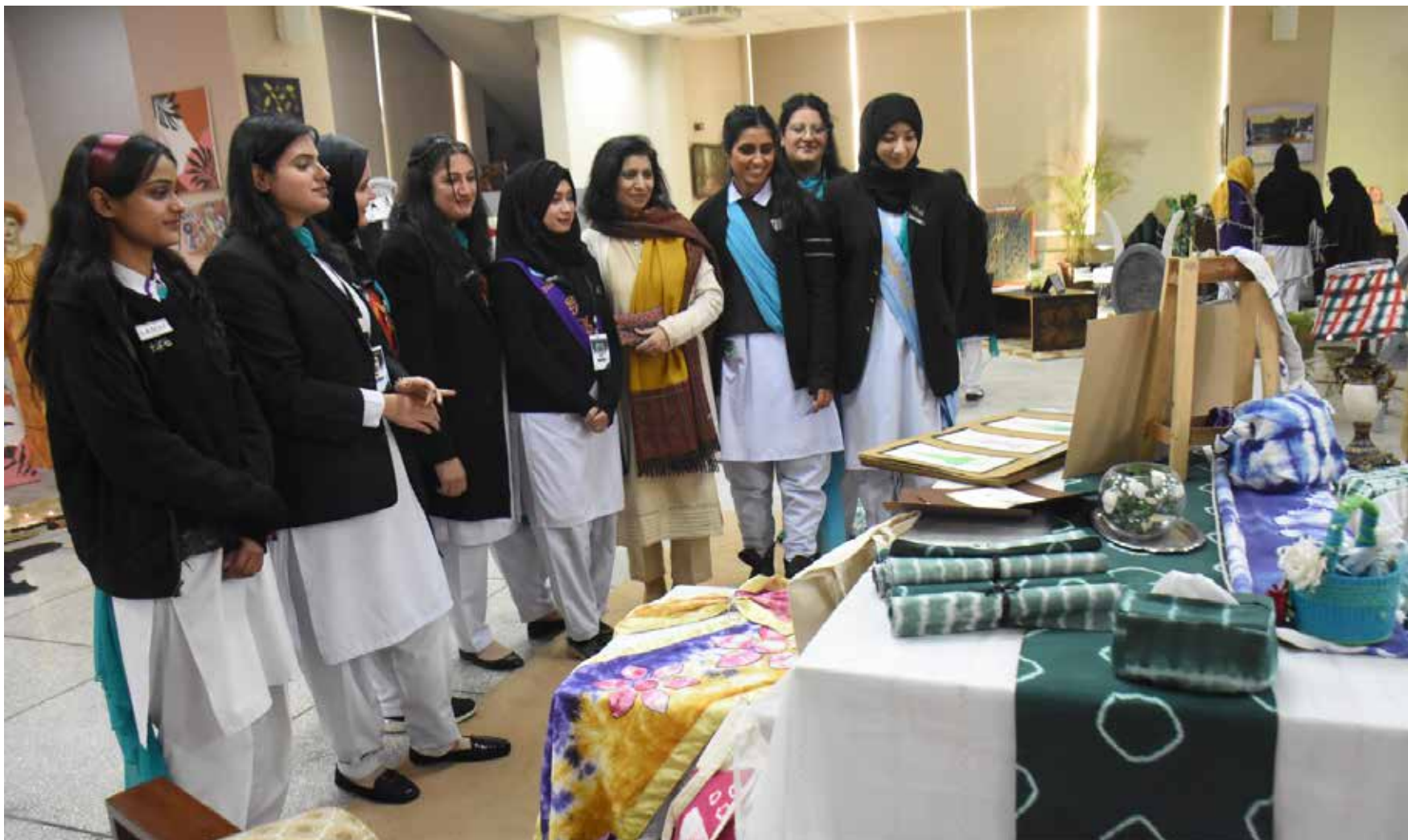
ISLAMABAD: Students are visiting Annual Exhibition titled "Encharmed world of Art and creativity" held at FG College of Home Economics & Management Sciences F-11 on Friday.

RAWALPINDI: Anti-Narcotics Force (ANF) while conducting six operations across the country managed to recover 57 kg of drugs and arrested 10 accused, said an ANF Headquarters spokesman here on Friday. He informed that a 2.3 kg Ice drug was recovered from a Bahrain-bound passenger going by Flight No. EK-613 at Islamabad Airport. 1.40 kg of Ice was recovered from a passenger travelling to Doha on Flight No. QR-601 at Bacha Khan Airport. 91 heroin-filled capsules were recovered from a passenger's stomach at Islamabad Airport. The accused was leaving for Sharjah by flight number PK-257. 45 kg heroin was recovered near G.T Road Bupi area from the possession of two Afghan nationals arrested during an operation. A 5 kg crystal drug was recovered near Lakpass Toll Plaza Quetta and two accused were rounded up. In the sixth operation, 3 kg of hashish was recovered from three suspects near Hayatabad Peshawar. Cases under the Anti-Narcotics Act have been registered against the arrested accused while further investigations are under process.—APP