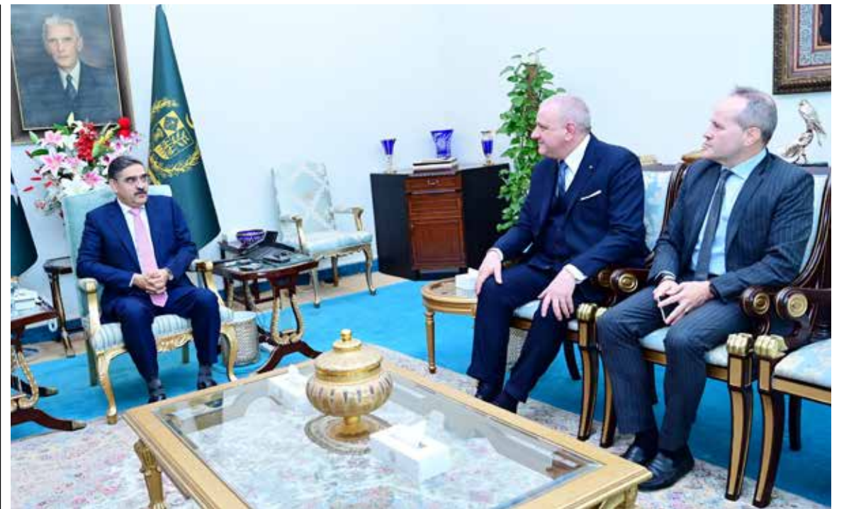
ISLAMABAD: The Ambassador of Italy to Pakistan, Andreas Ferrarese, paid a farewell call on Caretaker Prime Minister Anwaar-ul-Haq Kakar.