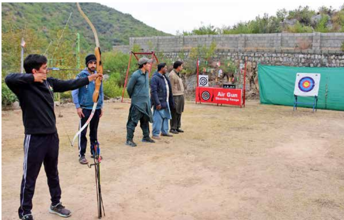
ISLAMABAD: Tourists are taking part in archery game at the court of Shah Allah Ditta caves, which are an ancient archaeological site located in the Margalla Hills of the Federal Capital.