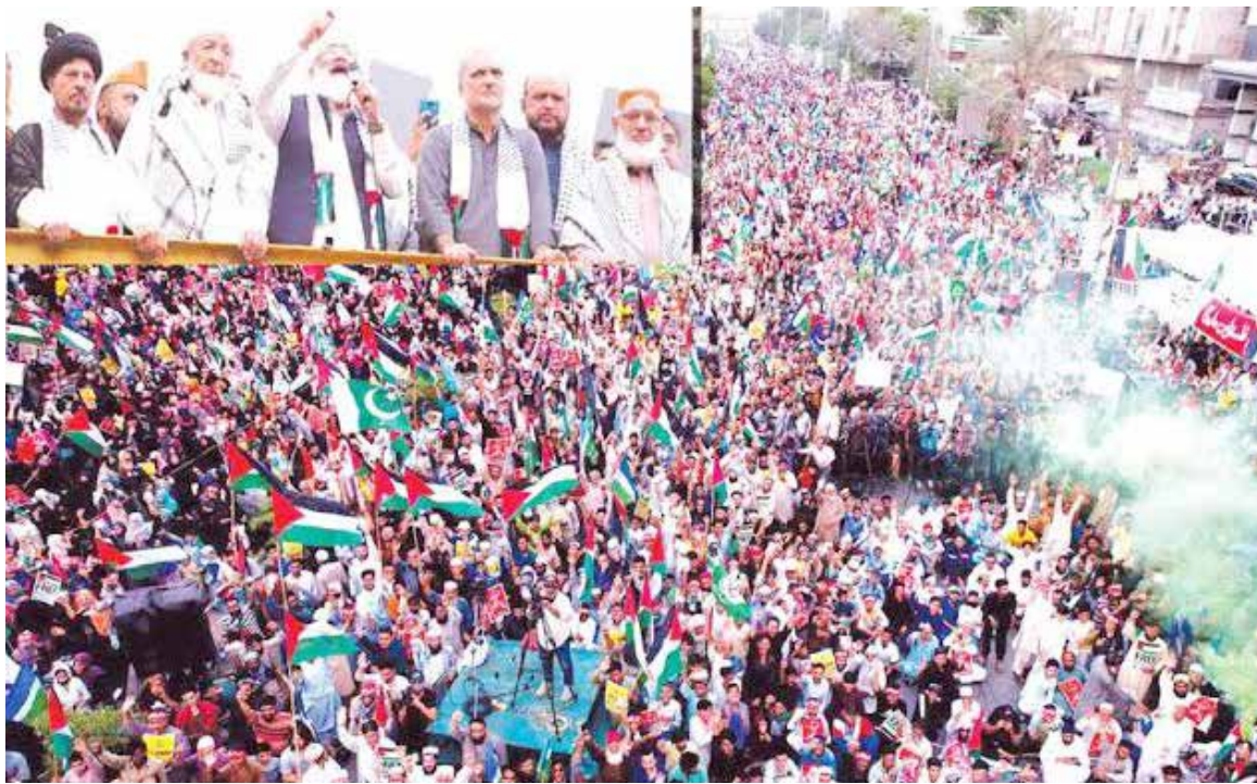
KARACHI: Tens of thousands of pro-Palestine demonstrators rallied in Karachi to demand an end to Israel's genocidal war.