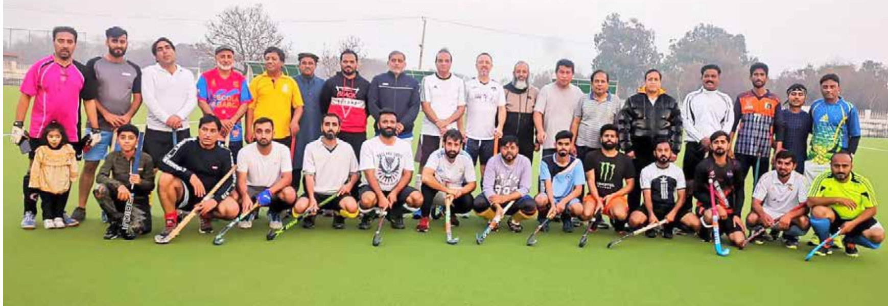
ISLAMABAD: Players of Rising Stars Hockey Club and Gujjar Khan club posing for a pictures with Ambassadors of Brunei and Romania during a match played at the Naseer Bundha Hockey Stadium Islamabad.