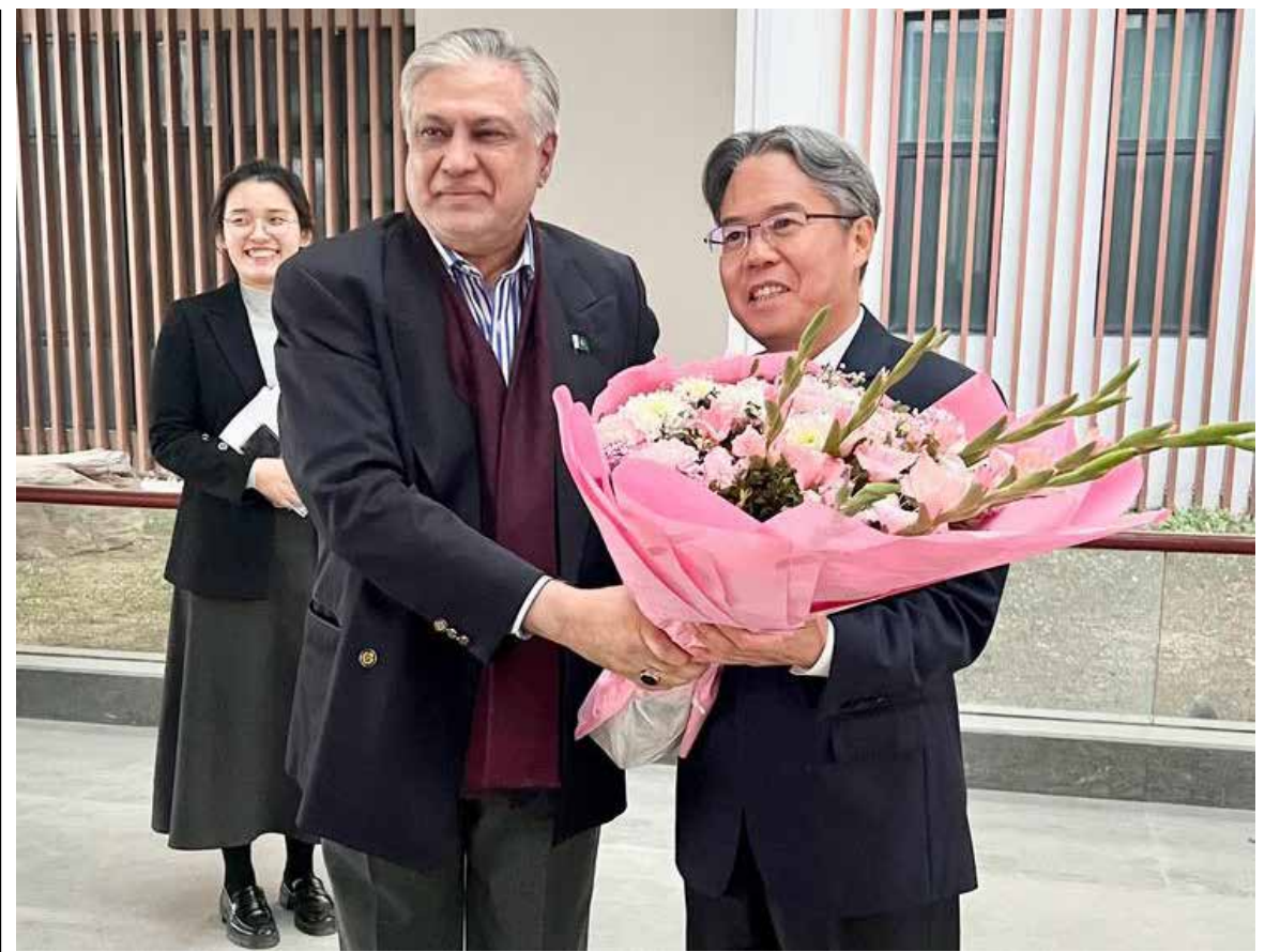
ISLAMABAD : leader of the house in the senate, Muhammad Ishaq Dar being welcomed by the Chinese ambassador Jiang Zaidong at Chinese Embassy.

or individuals for recovery of dues and a time frame should be fixed for recovery, he said. He said that KMC records in the land department should also be computerized as soon as possible, which will be uploaded on the official website of KMC. The performance Of the Land department and other revenue related departments of KMC is being constantly reviewed. KMC departments have to be activated so that every officer and subordinate staff discharge their professional responsibilities in a timely and excellent manner.