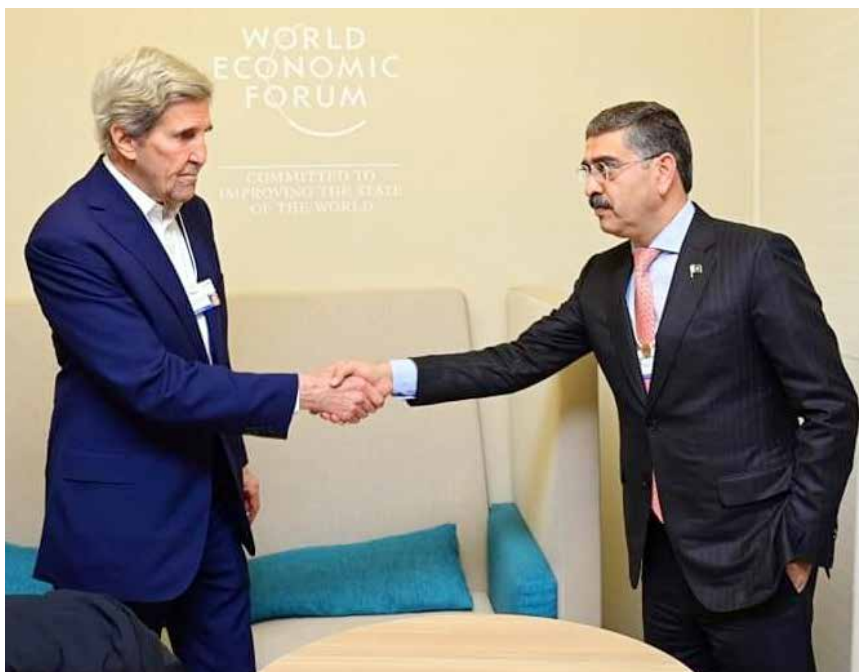
DAVOS: Caretaker Prime Minister Anwaar-ul-Haq Kakar met US Presidential special envoy on Climate, John Kerry on the sidelines of the World Economic Forum.