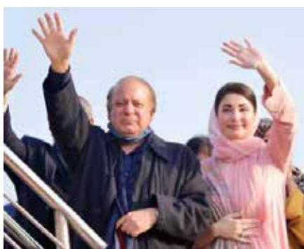
HAFIZABAD: PML N supremo Nawaz Sharif and Maryam Nawaz wave to people during Nawaz' maiden rally in Hafizabad.

Former prime minister vows to make Pakistan stand on its feet