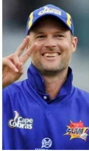
ICC Test team rankings and won the 2017 ICC Champions Trophy.