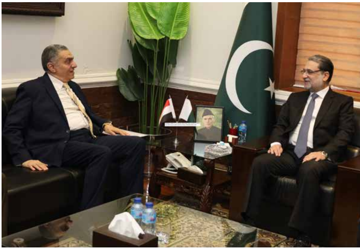
RAWALPIND. Ambassador of Egypt, H.E. Dr. Ihab Abdel Hamid Hasan called on Minister for Defence, Lt Gen (Retd) Anwar Ali Hyder at Ministry of Defence.

will observe the count without cameras. The code also emphasises that media representatives must not engage in activities that obstruct the election process before, during, or after the voting. The broadcast of election results will be prohibited until one hour after the end of polling, it will be stated explicitly that the results are unofficial and incomplete, and they will only be considered final when officially declared by the Returning Officer. It is important to note that a journalist or media organisation may have their accreditation terminated if they violate the code of conduct.