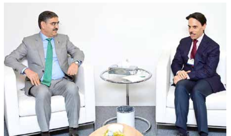
DAVOS: Saudi Foreign Minister Prince Faisal bin Farhan calls on Caretaker Prime Minister Anwaar-ul-Haq Kakar.