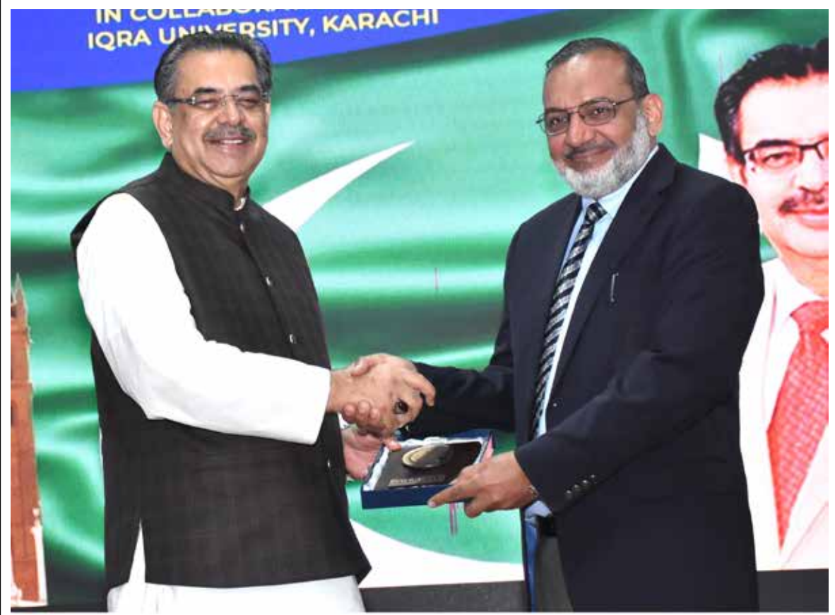
KARACHI: Caretaker Federal Minister for Religious Affairs and Interfaith Harmony Hon'ble Aneeq Ahmed is being presented with memento during the seminar on "Religious Minorities and Interfaith Social Tolerance in Pakistan" at Iqra University Karachi.