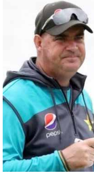
was the head coach of the Pakistan Men's Cricket Team from