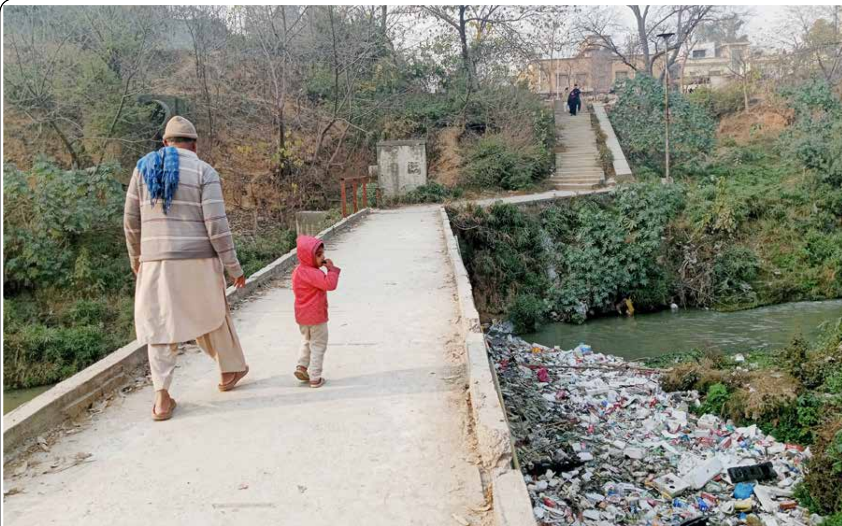
ISLAMABAD: A nullah flowing in G 7 is littered with garbage. Since there are no proper garbage disposal arrangements by the CDA in the area that is why residents consider it convenient to through garbage in the Nullah. Resultantly, during heavy rains the nullah overflows inundating the nearby localities.