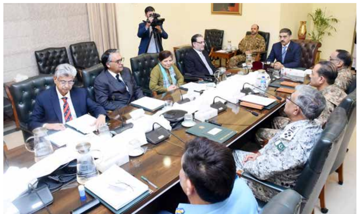
ISLAMABAD: Caretaker Prime Minister Anwaar-ul-Haq Kakar presiding over the meeting of the National Security Council, which was attended by the services chiefs and cabinet members part of the NSC.