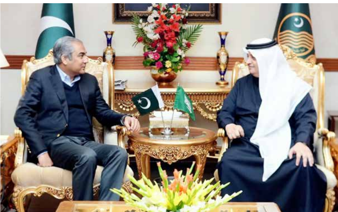
LAHORE: Saudi Arabian Ambassador Nawaf Saeed Ahmad Al-Maliki calls on Caretaker Chief Minister Punjab CM Mohsin Naqvi.