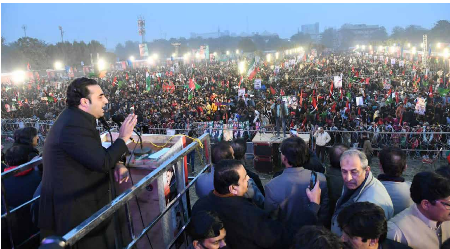
LAHORE: Chairman PPP Bilawal Bhutto Zardari is addressing a public gathering at Lahore township cricket ground. —DNA

BERLIN : Farmers in Germany seeking sustainable agriculture, demonstrated Saturday with tractors in front of the headquarters of the Social Democratic Party (SPD) in Berlin. The farmers are opposed to the government's plan to remove agricultural diesel subsidies. Hundreds of demonstrators, led by the coalition of SPD with the Greens and the Free Democratic Party, gathered in front of the SPD headquarters, chanting slogans: "We're fed up", "Everyone can do something" and "Good food needs a future." Protesters held banners with messages that read: "The land belongs to the farmers", "Food is political" and "Farmers come before corporate interests." Klaus Böglen expressed frustration with the government's agricultural policies. Böglen told Anadolu: "We believe the government is very inconsistent in protecting the interests of nature and future generations.—APP