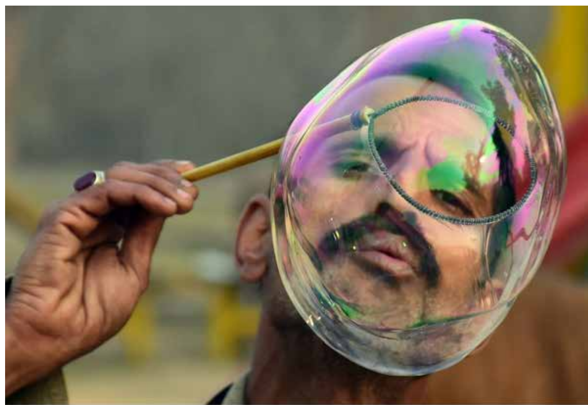
ISLAMABAD: A vendor is making bubbles to attract the children at Rose and Jasmine garden in the Federal Capital.

the officers and field staff to take action against unfit vehicles. The spokesman informed that CTP Rawalpindi had issued 3033 challan slips to unfit and without route permit public service vehicles during current month, while fines were also imposed on the rules violators. In view of the safety of the motorcyclists, 2116 challan tickets were also issued to those not wearing safety helmets. A large number of citizens were briefed about the importance of helmets, he added. 389 smoke-emitting vehicles were also issued challan tickets during January and 17 vehicles were impounded in the respective police stations and their fitness certificates were also sent to the authorities concerned for suspension, he added.