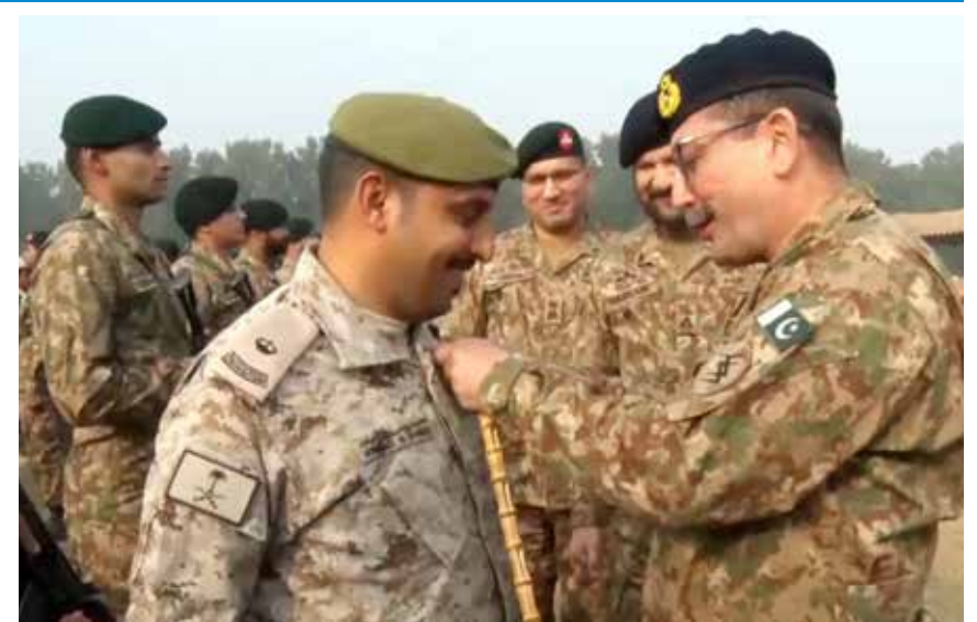
MULTAN: The Chief Guest pinning training badges on the soldiers of the Saudi land forces on the occasion of the commencement of joint exercise between Pakistan Army and the Saudi Land Forces, at the Multan Garrison.