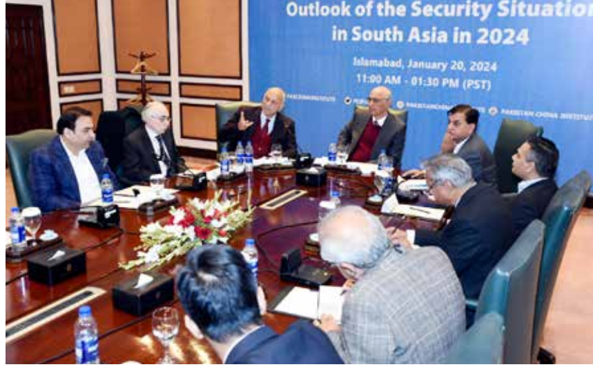
ISLAMABAD: Chairman Senate Defence Committee Mushahid Hussain Sayed speaking during a seminar titled Outlook of Security Situation in South Asia.

In his opening speech, Senator Mushahid Hussain Sayed highlighted the significance of the current scenario, dominated by turbulence and transformation. In this context, he analysed China's Global Security Initiative (GSI) as a new framework for peaceful resolution of security issues, since GSI focuses on security as being indivisible, based on respect for sovereignty and territorial integrity of states. It seeks also to promote a security governance framework, including A.I., cyber security and related security threats