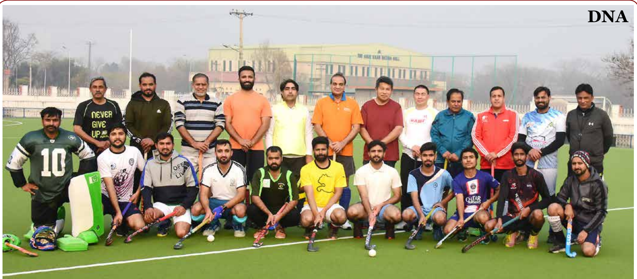
ISLAMABAD: Players of the Rising Stars Hockey Club in a group photo with Ambassadors of Brunei and Kyrgyzstan during a practice match, played at the Naseer Bundha Hockey Stadium on Sunday.

FROM PAGE 01 ceremony by the Okara Garrison commander, who was the chief guest at the event. Apart from defense and security ties, Pakistan enjoys strong economic and trade relations with the kingdom. Saudi Arabia is home to over 2.7 million Pakistani expatriates, serving as the top destination for remittances for the cash-strapped South Asian country. Along with the UAE, the kingdom has frequently bailed Pakistan out of its economic crisis over the years. Last year, Saudi Arabia lent $2 billion to Pakistan which proved critical in helping it secure a bailout package from International Monetary Fund (IMF) and avoid a sovereign debt default.