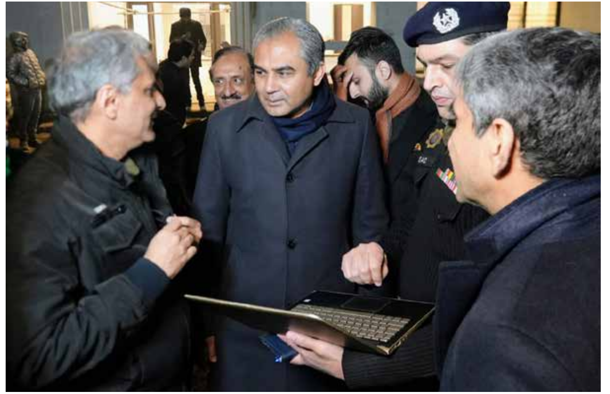
LAHORE: Chief Minister Punjab Mohsin Naqvi is being briefed by Inspector General of Police Dr. Usman Anwar about the progress on the construction of residences for police in Qurban Lines.

society. Upon successful completion of the rehabilitation program, the detained individuals will be granted release, provided they commit to refraining from professional begging. This approach not only enforces the law but also aims to address the underlying societal issues contributing to the perpetuation of begging. Deputy Commissioner Afaq Wazir reiterated the continuation of such operations, emphasizing the commitment to eradicating professional begging from the city. "Our goal is not only to enforce the law but also to extend support and opportunities to those in need, ensuring they have the means to lead dignified lives," said Commissioner Afaq Wazir.—APP