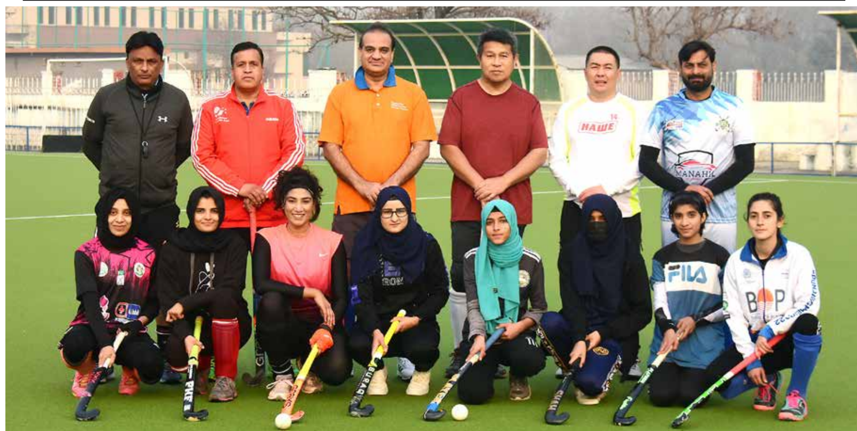
ISLAMABAD: Players of the Rising Stars Girls Hockey Academy in a group photo with Ambassadors of Brunei and Kyrgyzstan during a practice match, played at the Naseer Bundha Hockey Stadium on Sunday.

FROM PAGE 01 targeted hideouts of terrorists inside Iranian territory, killing many. Now both Pakistan and Iran have decided to end tension between the two countries and resume diplomatic relations.