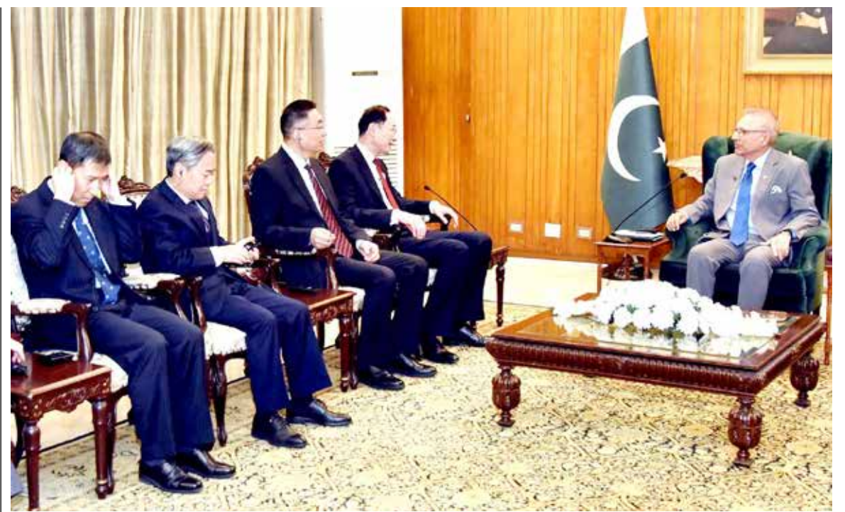
ISLAMABAD: Vice Foreign Minister of the People's Republic of China Sun Weidong calls on President Dr Arif Alvi, at Aiwan-e-Sadr.