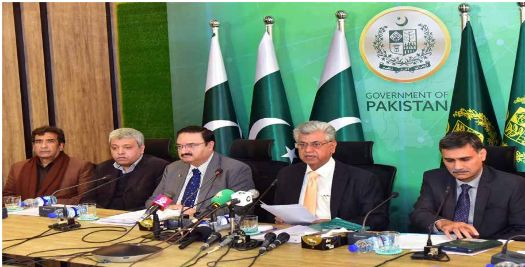
ISLAMABAD: Mr.Murtaza Solangi Caretaker Federal Minister for Information and Broadcasting addressing a press conference along with PTA&FIA Authorities.