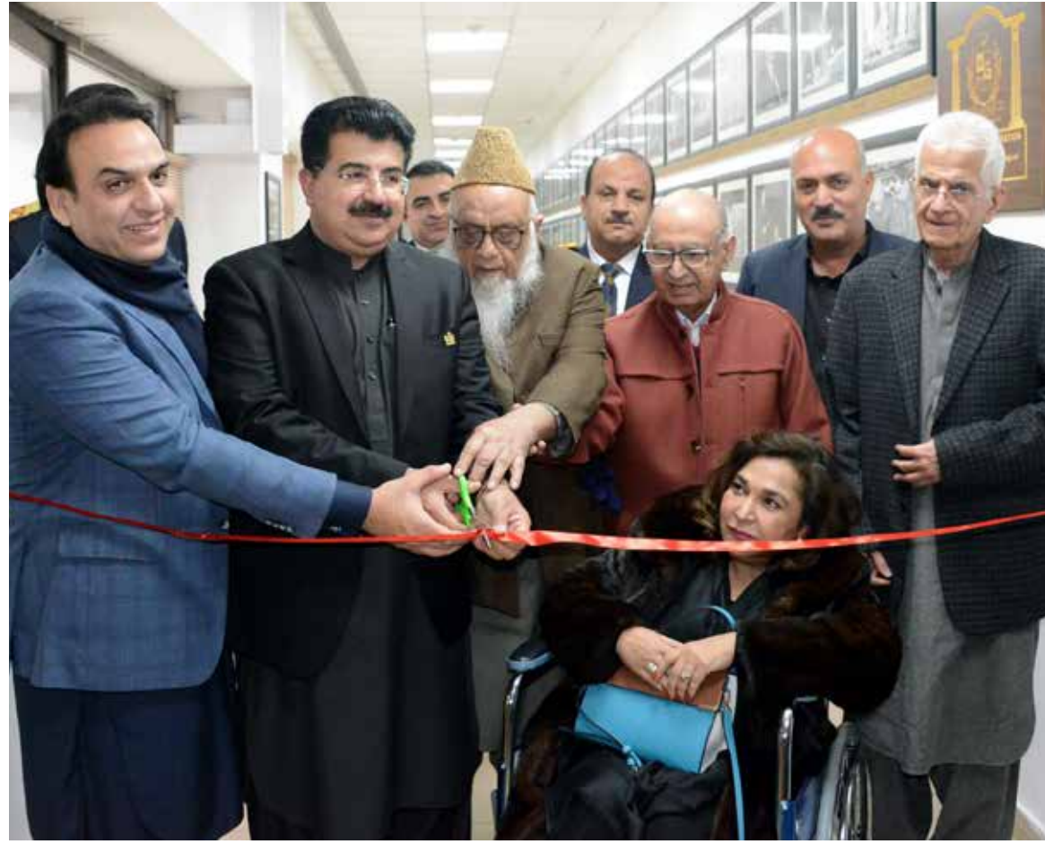
ISLAMABAD : Chairman Senate, Muhammad Sadiq Sanjrani inaugurating the wall of federation at parliament house.