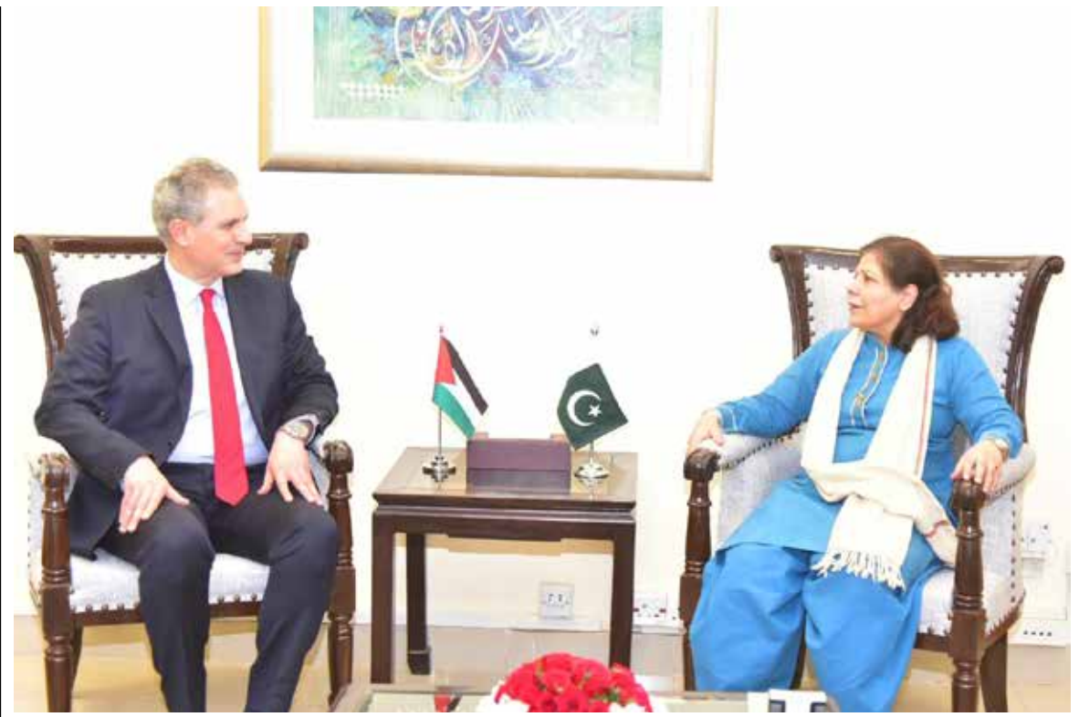
ISLAMABAD : Minister for Finance, Revenue and Economic Affairs, Dr. Shamshad Akhtar was called on by Maen Khreasat, Ambassador of the Kingdom of Jordan.

emphasized upon the need of vertical construction in the new residential projects in Islamabad, and directed the relevant authorities to formulate an effective strategy to woo investors for the business purposes with construction of high-rise buildings. He also directed the authorities to resolve the water issue of the capital city immediately by ensuring its smooth supply, besides construction of specific buildings (parking plazas) to overcome parking problem. He also asked for an effective mechanism to reduce traffic pressure in the city.