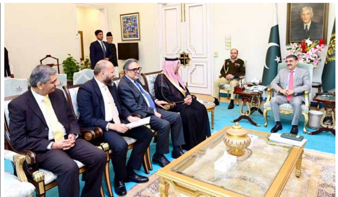
ISLAMABAD: Head of Al-Jomaih Group alongwith a delegation call in Caretaker Prime Minister Anwaar-ul-Haq Kakar.