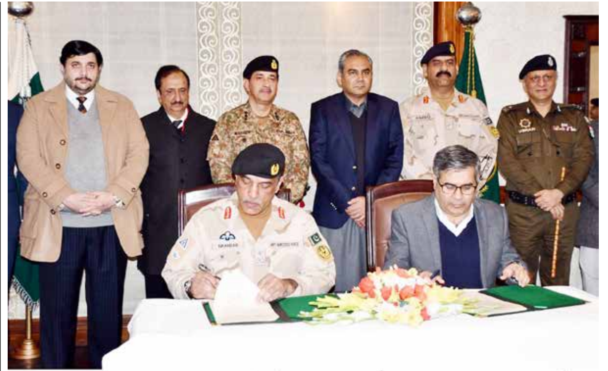
LAHORE: In the presence of Chief Minister Mohsin Naqvi and Corps Commander Lahore Syed Amir Raza, the agreement to hand over Data Darbar Hospital to Anti-Narcotics Force is being signed.

sised the need for a comprehensive understanding of the global information landscape and its implications. The discussion highlighted that India has been identified as the epicentre of disinformation in 2024. It was also emphasised that in this technologically-driven era, nations that empower their citizens with a robust digital presence wield the transformative power to influence the global landscape. Moreover, the need for Pakistan to comprehensively reassess its national security priorities in light of identified challenges was stressed. The emphasis was on creating a tailored strategy, leveraging Pakistan's strengths while effectively addressing vulnerabilities posed by disinformation tactics by adversaries. The seminar concluded with a unanimous call for proactive policy decisions in the face of the changing digital landscape. This merits media mastery and adaptability as Pakistan charts its course in this challenging era.