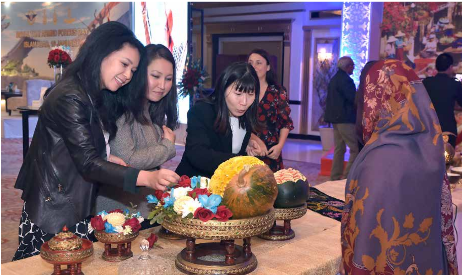
ISLAMABAD: Ladies taking interest in Thai flowers displayed on the occasion of the Armed Forces Day of Thailand.