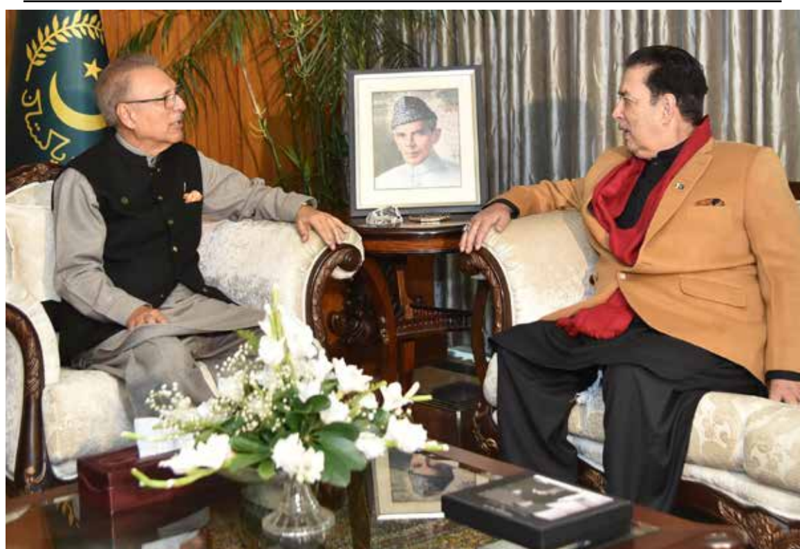
ISLAMABAD: Governor Gilgit-Baltistan, Syed Mehdi Shah, called on President Dr Arif Alvi, at Aiwan-e-Sadr.