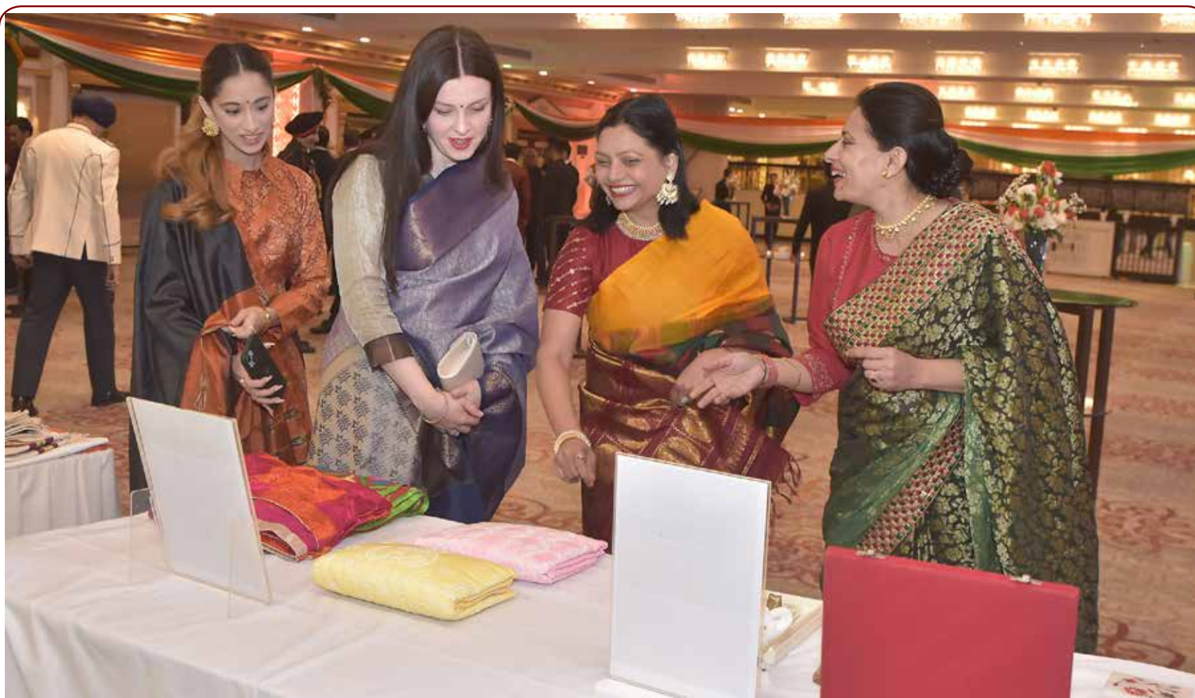
ISLAMABAD: Guests taking interest in various items displayed on the occasion of the Republic day of India.—DNA