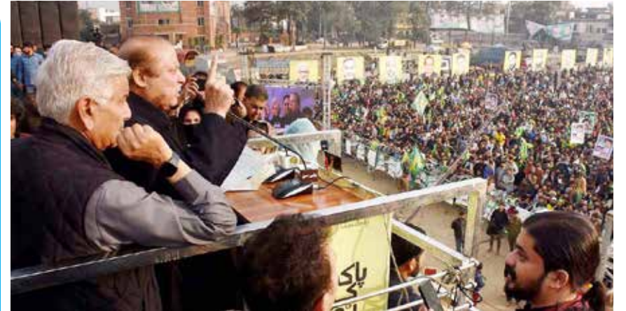
SIALKOT: PML N leader Nawaz Sharif addresses a public rally.