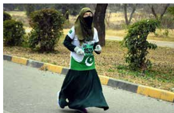
ISLAMABAD: A woman participants in the Adam's Islamabad Marathon 2024, at Margalla road in the Federal Capital.