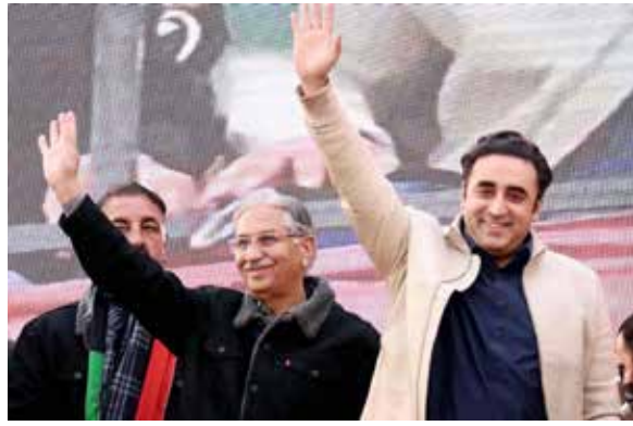
RAWALPINIDI: PPP chairman Bilawal Bhutto waves to supporters during a rally.

Zardari told the rally that the PPP never picked up arms despite the challenges it had faced. "Instead, we protested on the streets in the form of rallies and are still fighting for democracy