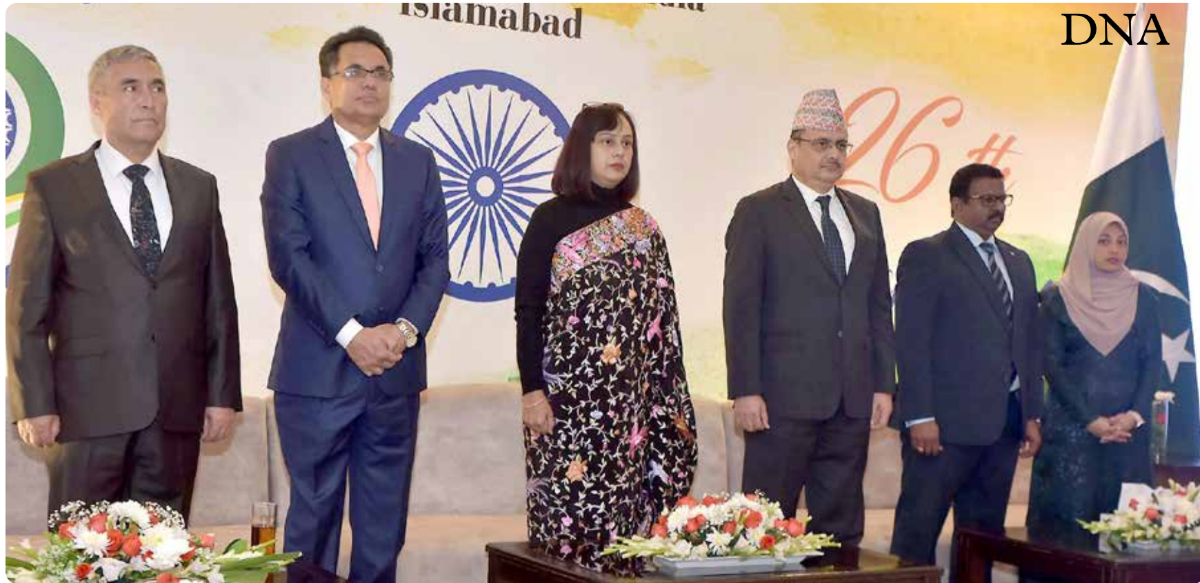
ISLAMABAD: Charge d'Affaires of India Geetika Srivastava along with Ambassadors and High Commissioners of the SAARC countries cut the cake to celebrate the Republic Day of India. A large number of guests hailing from various walks of life attended the reception.