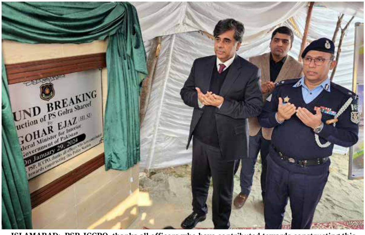
ISLAMABAD: PSP, ICCPO, thanks all officers who have contributed towards constructing this Police Station Federal Minister for Interior Dr Gohar Ejaz offering prayer during the ground breaking ceremony of new building of Police Station Golra.

150 kg opium and 150 kg morphine were recovered from an empty house in Kuchlak Pishin while four kg hashish was recovered from an accused arrested near Iqbal Shaheed Toll Plaza, Attock. The spokesman informed that 1 kg hashish was recovered from the possession of an accused nabbed near GT Road, Attock. In the seventh operation, 1 kg of hashish was recovered from an accused near Bano Bypass Kohat. Similarly, in the eighth operation, 500 grams of heroin and 350 grams of Ice were recovered from a woman arrested near the Islamabad Motorway. Cases under the Anti-Narcotics Act have been registered against all the arrested accused while further investigations are under process.