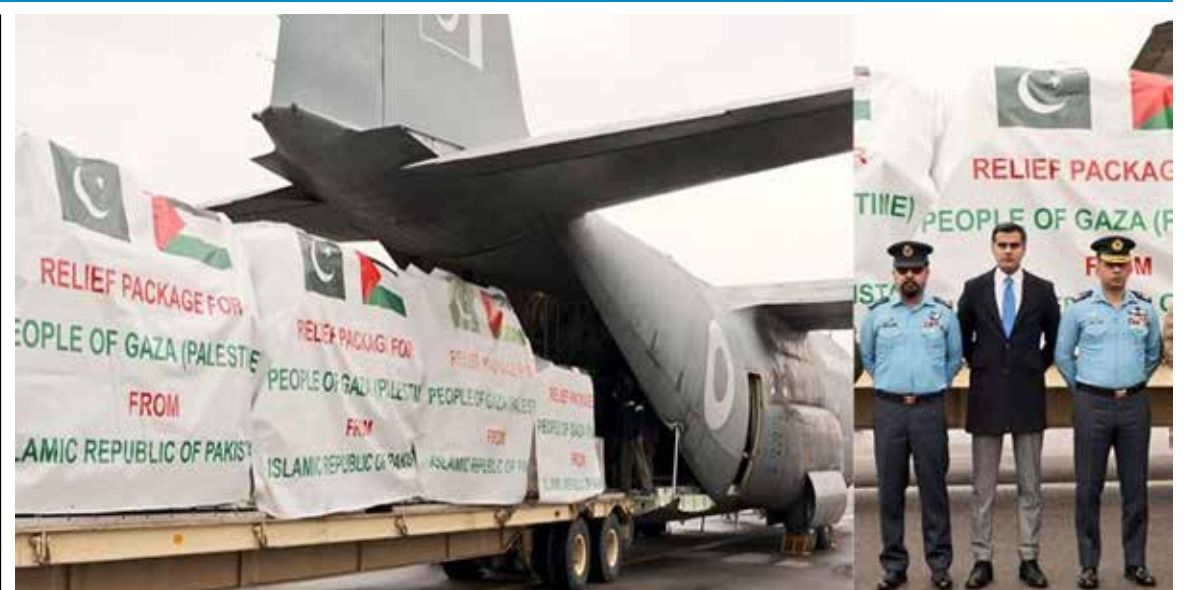
ISLAMABAD: Humanitarian assistance was dispatched on Sunday for Gaza. Pakistani officials dispatched the consignment in C 130 aircraft from Nur Khan Air Base.