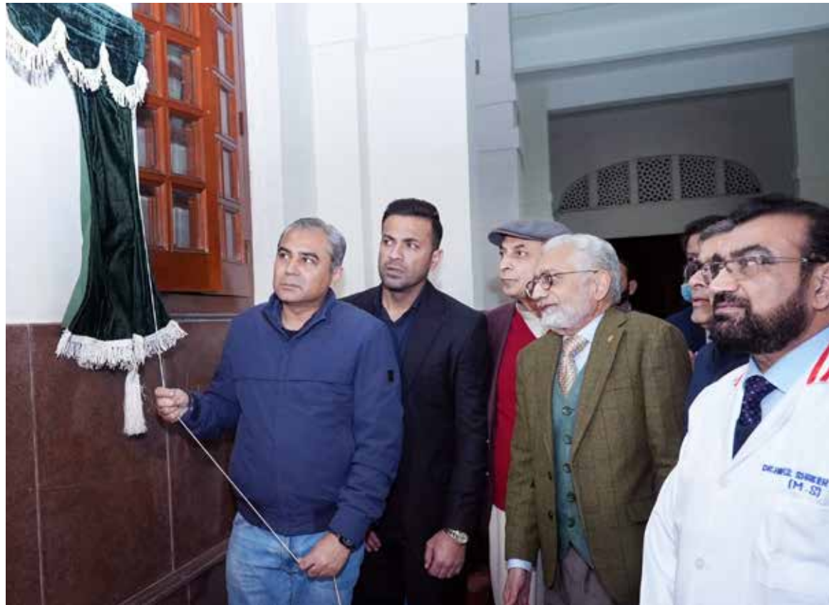
LAHORE : Punjab Chief Minister Mohsin Naqvi is inaugurating the upgradation project of Punjab Dental Hospital which has been dilapidated for many years.