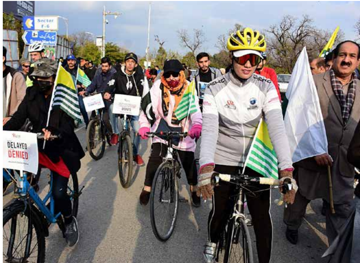
ISLAMABAD: Participants take part during a cycle rally in connection with Kashmir Solidarity Day, outside National Press Club in the Federal Capital.