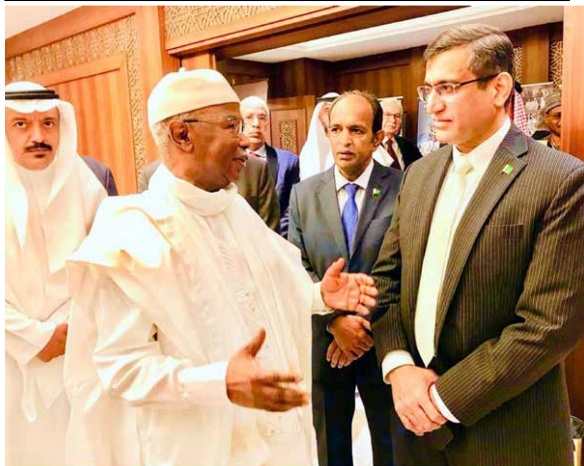
JEDDAH: The OIC Secretary General, H.E. Hissein Brahim Taha graced the Kashmir Solidarity Day event as a 'Chief Guest', organized by the Permanent Mission of Pakistan to OIC at the OIC Secretariat in Jeddah.