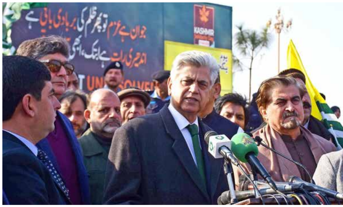
ISLAMABAD: Caretaker Federal Minister for Information & Broadcasting, Murtaza Solangi, speaks to participants during protest rally to mark the Kashmir Solidarity Day at Constitution Avenue in the Federal Capital.

LARKANA: With elections just around the corner, political parties are promising to provide a better future to masses. In this regard, Pakistan Peoples Party's Aseefa Bhutto Zardari has vowed that the party would construct millions of homes to provide shelter to people if the party is voted to power. She made these remarks while addressing a convention of the party. She asked the people to choose carefully their representatives while highlighting that the PPP had provided free treatment to the inhabitants of all areas of Sindh while claiming that no other province had prioritised it. Aseefa said a well-functioning hospital was developed in a small city like Gambit while mentioning the party has stood with people as it has always received their support.