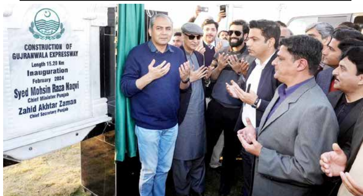
LAHORE : Punjab Chief Minister Mohsin Naqvi prays after inaugurating Gujranwala Expressway connecting Lahore Sialkot Motorway.