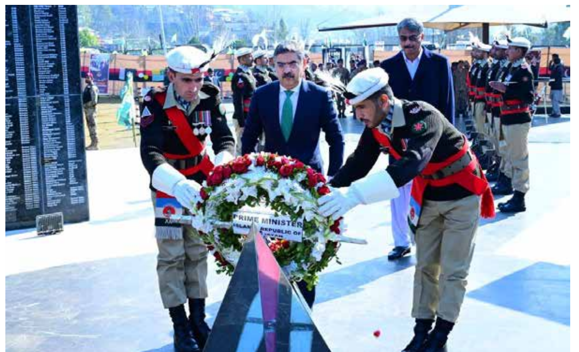
MUZAFFARABAD: Caretaker Prime Minister Anwaar-ul-Haq Kakar laid a floral wreath at the Martyrs Monument on Kashmir Solidarity Day in Muzaffarabad on 5th of February, 2024.