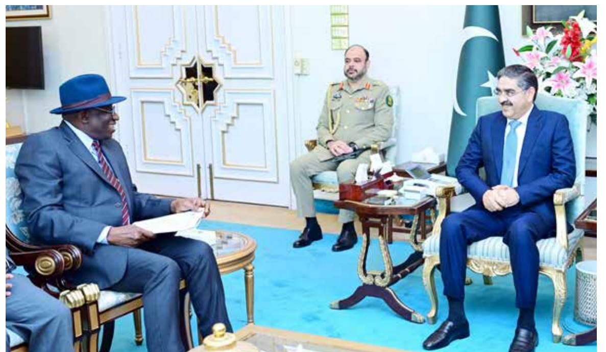
ISLAMABAD: Chairperson of the Common Wealth Observer Group for General Election Dr Goodluck Ebele Jonathan along with the delegation called on Caretaker Prime Minister, Anwaar-ul-Haq Kakar.