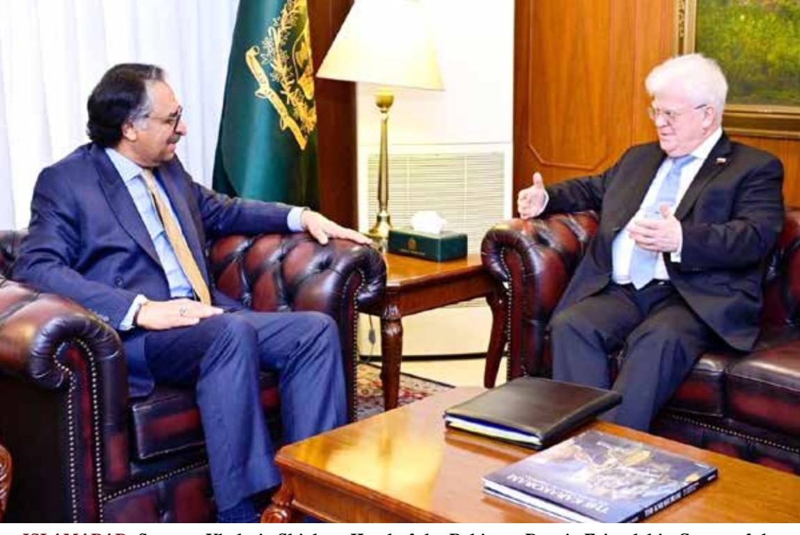
ISLAMABAD: Senator Vladmir Chizhov, Head of the Pakistan-Russia Friendship Group of the Russian Federation Council, callson Foreign Minister Jali Abbas IJilani. Senator Chizhov is visiting Pakistan as an International Observer for the general elections being held today.