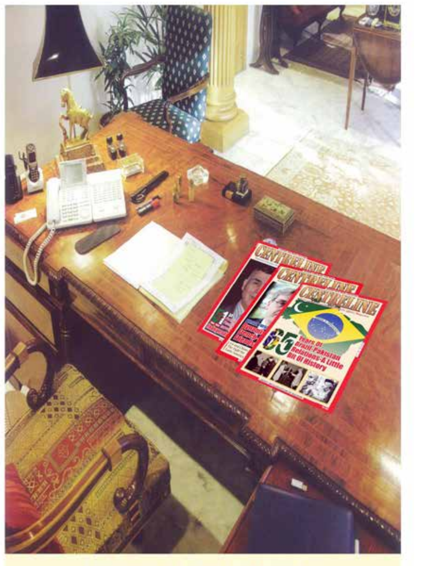
ANYONE WHO'S SOMEONE ... reads Centreline

strengthen the engagement of the private sector and academia in the critical work of BDT. Eighteen distinguished individuals were selected to serve as members of the Digital Innovation Board based on their expression of interest and a nomination process. The ITU is the United Nations specialized agency for information and communication technologies - ICTs. Founded in 1865 to facilitate international connectivity in communications networks, we allocate global radio spectrum and satellite orbits, develop the technical standards that ensure networks and technologies seamlessly interconnect, and strive to improve access to ICTs to underserved communities worldwide. Every time you make a phone call via the mobile, access the Internet or send an email, you are benefitting from the work of ITU.