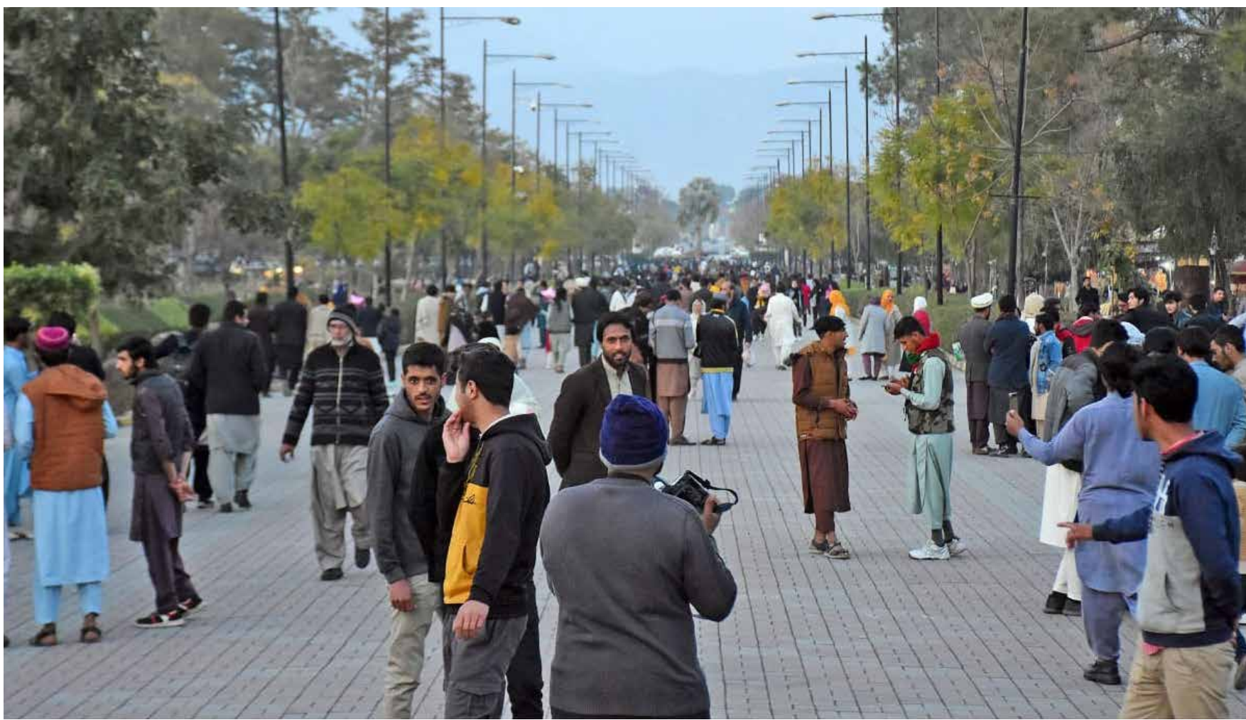
ISLAMABAD: A large numbers of people arriving at Rawal Lake during pleasant weather, in the Federal Capital.