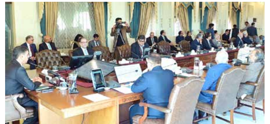
ISLAMABAD: Prime Minister Anwaarul Haq Kakar chairing the Federal Cabinet meeting.