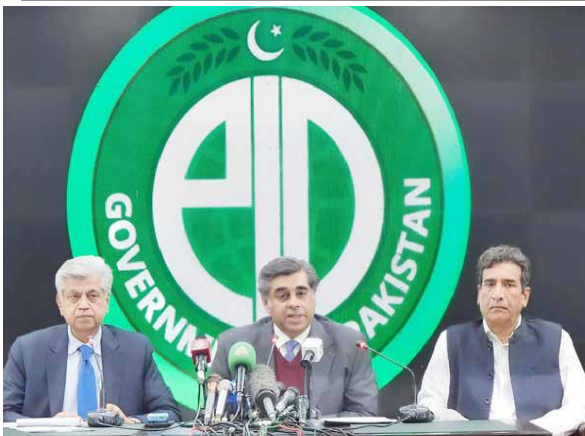
ISLAMABAD: Federal Minister for Interior Dr. Gohar Ejaz and Federal Minister for Information and Broadcasting Murtaza Solangi addressing a press conference.