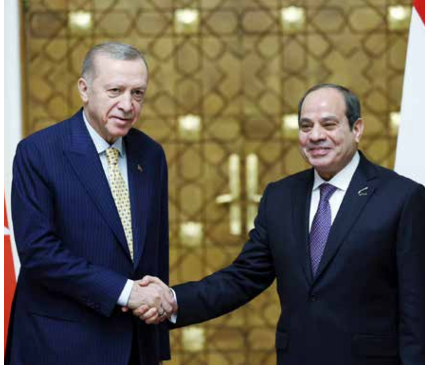
The two leaders signed the Joint Statement on Restructuring of High-Level Strategic Cooperation Council Meetings ahead of the joint news conference in Cairo. In a first for 12 years, President Erdogan

CAIRO: President Recep Tayyip Erdogan said Türkiye and Egypt are ready to cooperate to stop the bloodshed in Gaza amid Israel's incessant attacks, which have killed over 28,000 Palestinians, mostly women and children. Speaking at a joint news conference with Egyptian President Abdel Fattah el-Sissi in Cairo, Erdogan said the ongoing humanitarian crisis in Gaza topped their agenda. He noted that the two countries are ready to rebuild Gaza, which has been destroyed in Israeli attacks. He also said Israel's attempts to expel Palestinians from their land in Gaza are "null and void." "We welcome Egypt's stance against Israel's attempts in this regard," he said, adding that they both highlighted the necessity of transporting humanitarian aid into Gaza, where over 1.5 million people are experiencing a humanitarian catastrophe — without disruptions. Erdogan noted that he was pleased to be back in Cairo, as he said they've taken steps to further strengthen Türkiye-Egypt ties at the presidential level. He also said the two countries were planning to boost energy and defense cooperation. For his part, el-Sissi also hailed ever-growing bilateral ties between Egypt and Türkiye. "We are proud of the current state of relations between the two countries," he said.