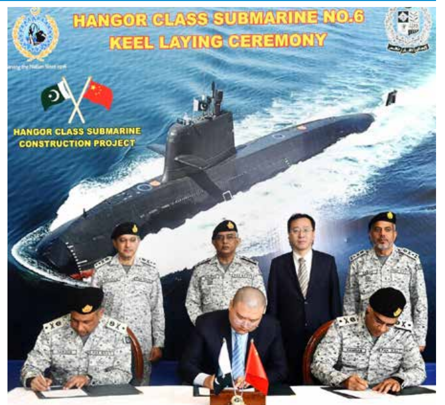
KARACHI: Officials of Pak Navy, Karachi Shipyard and China Shipbuilding & Offshore Intl signing the milestone certificate during keel laying ceremony of 6th HANGOR Class Submarine at Karachi Shipyard.