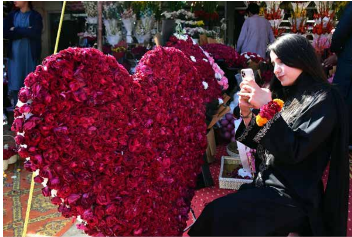
ISLAMABAD: A woman is taking photo of heart shape red rose flower bouquet at flower market on Valentine's Day, in the Federal Capital. —ONLINE