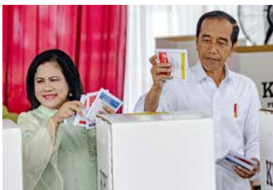
JAKARTA: Sitting President of Indonesia casts his vote in the Presidential elections of Indonesia 2024.

third-largest democracy. The early lead will be a big boost for Prabowo, who has undergone an image rebrand and is contesting his third successive election after twice losing out to the hugely popular Widodo, who cannot run again because of term limits. Jokowi, as the incumbent is known, is tacitly backing and betting on his former rival as a continuity candidate to preserve his legacy, including a role for his son Gibran Rakabuming Raka as Prabowo's running mate. Two surveys issued last week gave Prabowo just over 50% support, with Anies and Ganjar 27 and 31 points adrift, respectively, though the quick counts point to a stronger lead. "This is an emphatic result that diminishes prospects for legal challenges and will also provide the Widodo-Prabowo alliance with an element of