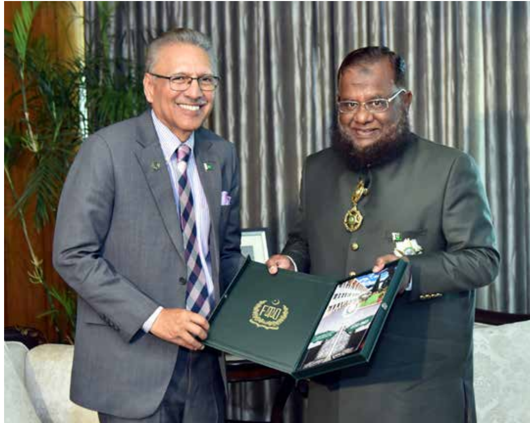
Hong Kong and the Philippines. He added that FTO had appointed leading businessmen as Honorary Advisors from various Chambers of Commerce and Industries to facilitate the business community. "To ensure prompt response against the maladministration of tax authorities, a mobile App has been developed enabling aggrieved complainants to lodge complaints and check their status