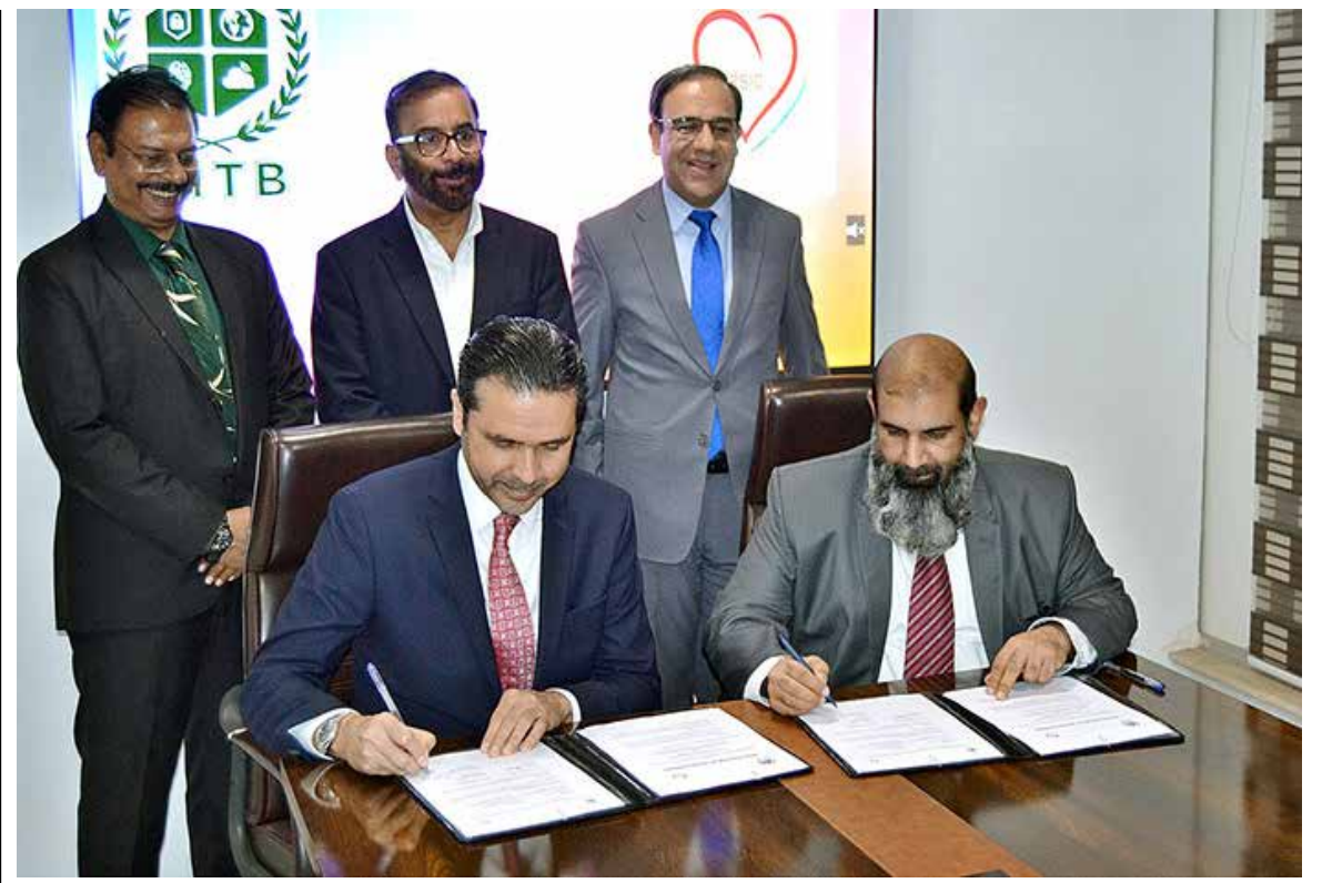
LAHORE : Federal Minister for IT and communication Dr. Umar Saif witnesses an MoU of treatment and prevention of Heart Attack between NHATI, PSIC, NITB.

business and economic activities, but electricity generated from oil in Pakistan is very expensive for the business community. It has increased the cost of doing business manifold. Therefore, the government should pay special attention to increasing the share of hydropower in the total energy production, which will reduce the cost of production and facilitate business activities and exports. The Acting President said that Pakistan is mostly dependent on oil for power generation but due to the rising oil prices, this electricity has become very expensive and is a major reason for the increase in the cost of doing business in Pakistan. —APP