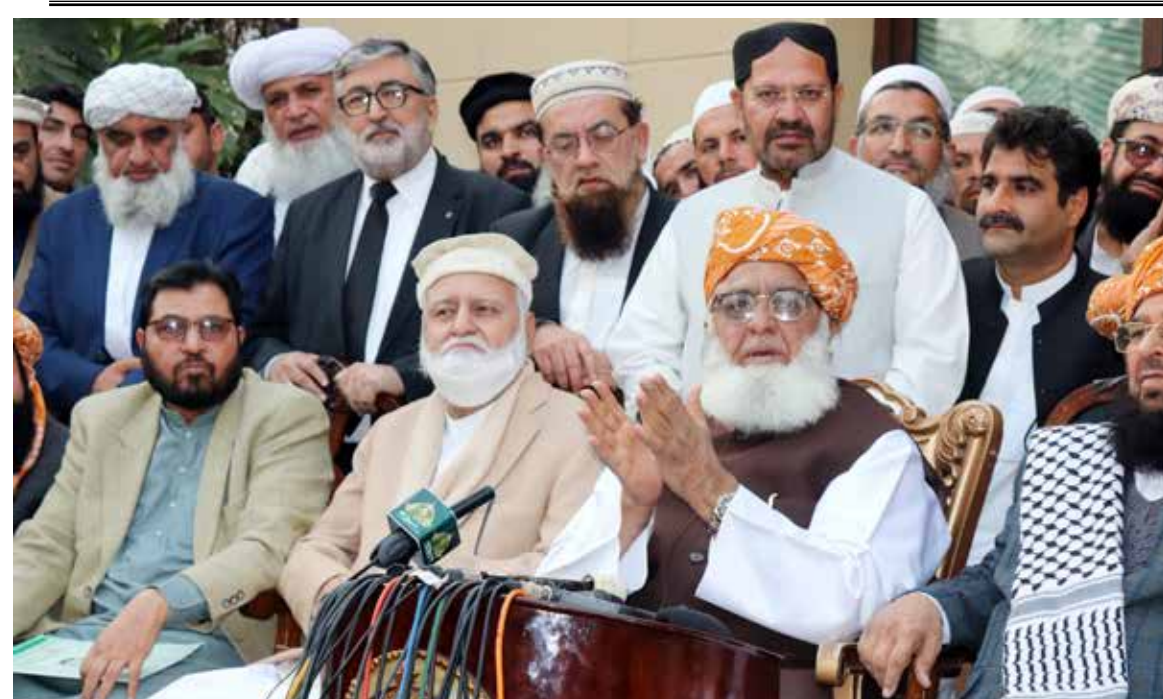
ISLAMABAD: Chief of JUI (F) Maulana Fazl ur Rehman holding a press conference along with other party leaders. (News on Page 01)