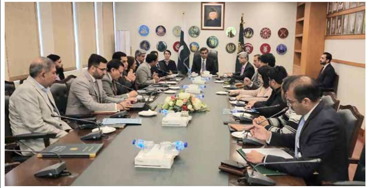
ISLAMABAD : Federal Minister for Interior Dr. Gohar Ejaz chairing a meeting on integrated sanitation and water supply system for Islamabad and Rawalpindi.