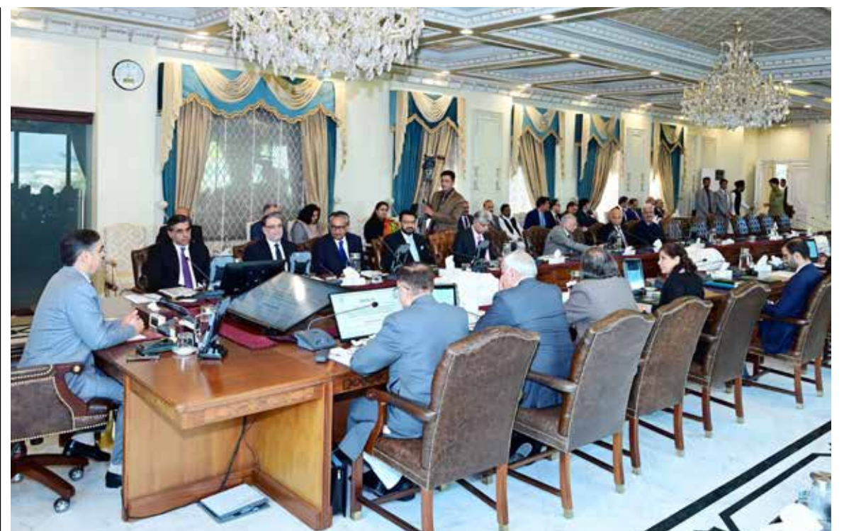
ISLAMABAD: Caretaker PM Anwaar-ul-Haq Kakar chairs a meeting of federal cabinet.