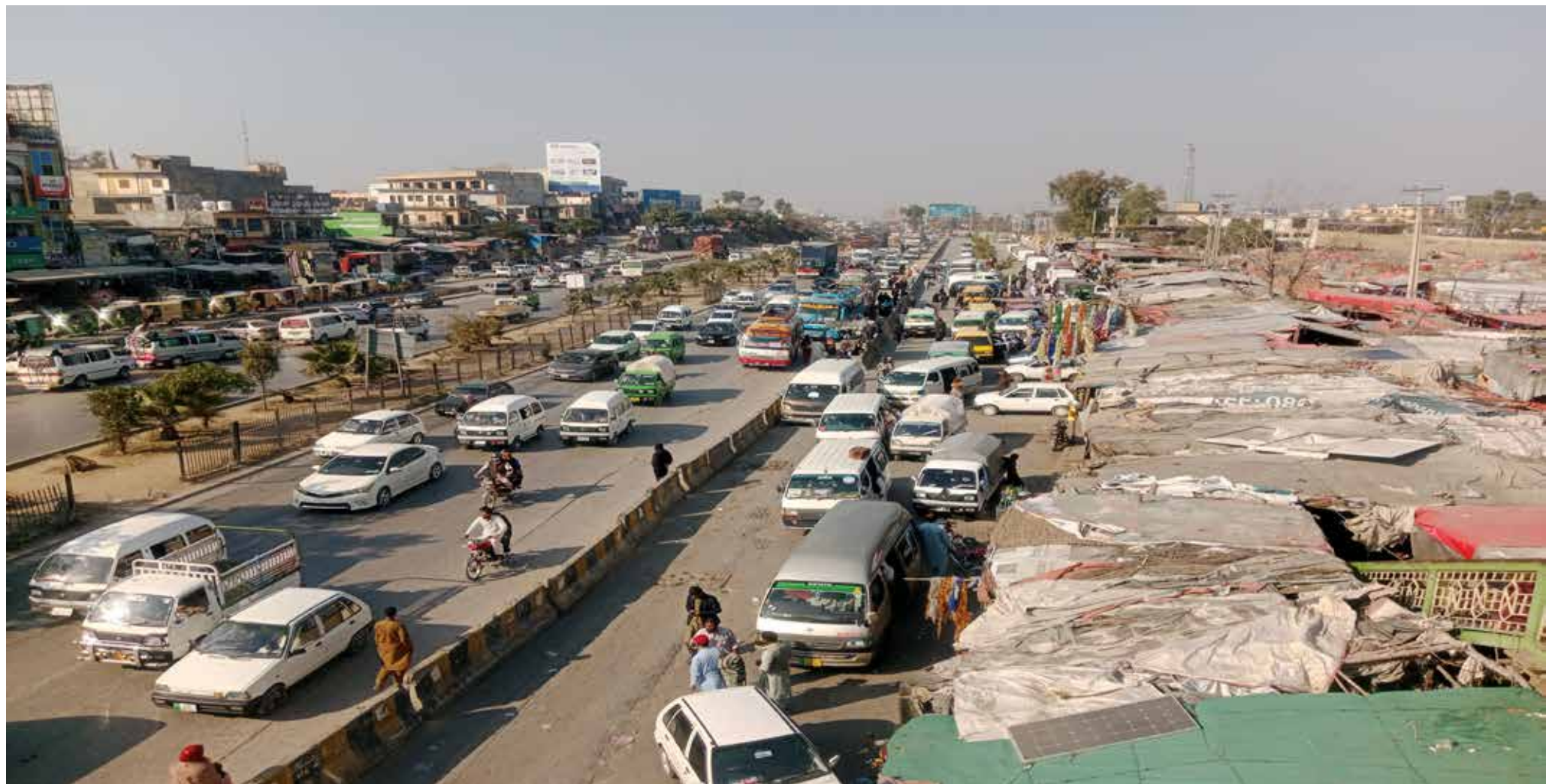
ISLAMABAD: A view of Rawat chowk, which is always flooded with traffic causing long delays. The locals have demanded of the authorities to build an over-head bridge in order to ease out traffic flow.