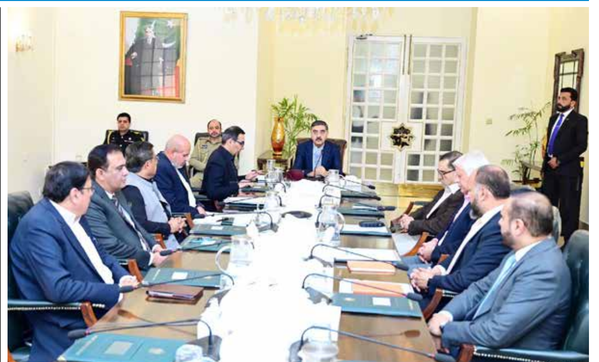
ISLAMABAD: Caretaker Prime Minister Anwaar-ul-Haq Kakar chairs a review meeting regarding Karachi Electric.