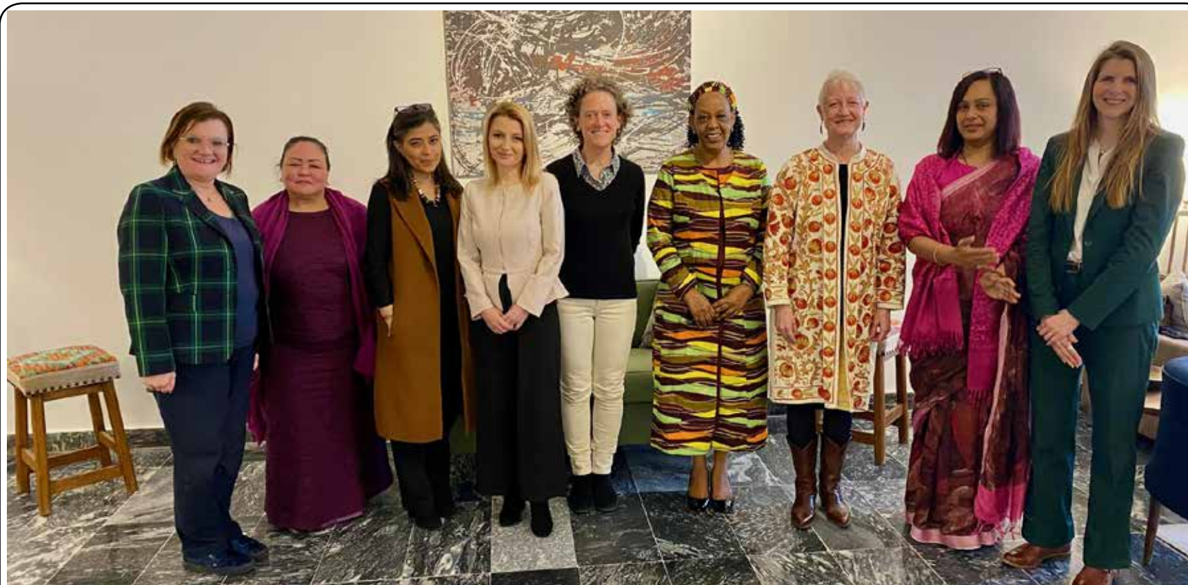
ISLAMABAD: Ambassador of Bulgaria to Pakistan hosted female heads of various missions in Islamabad. Seen in the picture are Ambassador of Italy, Ambassador of Philippines, High Commissioners of Canada and Kenya, Ambassador of European Union, Charge d Affaires of India and High Commissioner of United Kingdom.