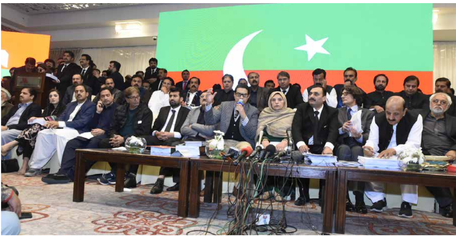
ISLAMABAD: Leaders of PTI addressing a press conference in Islamabad.