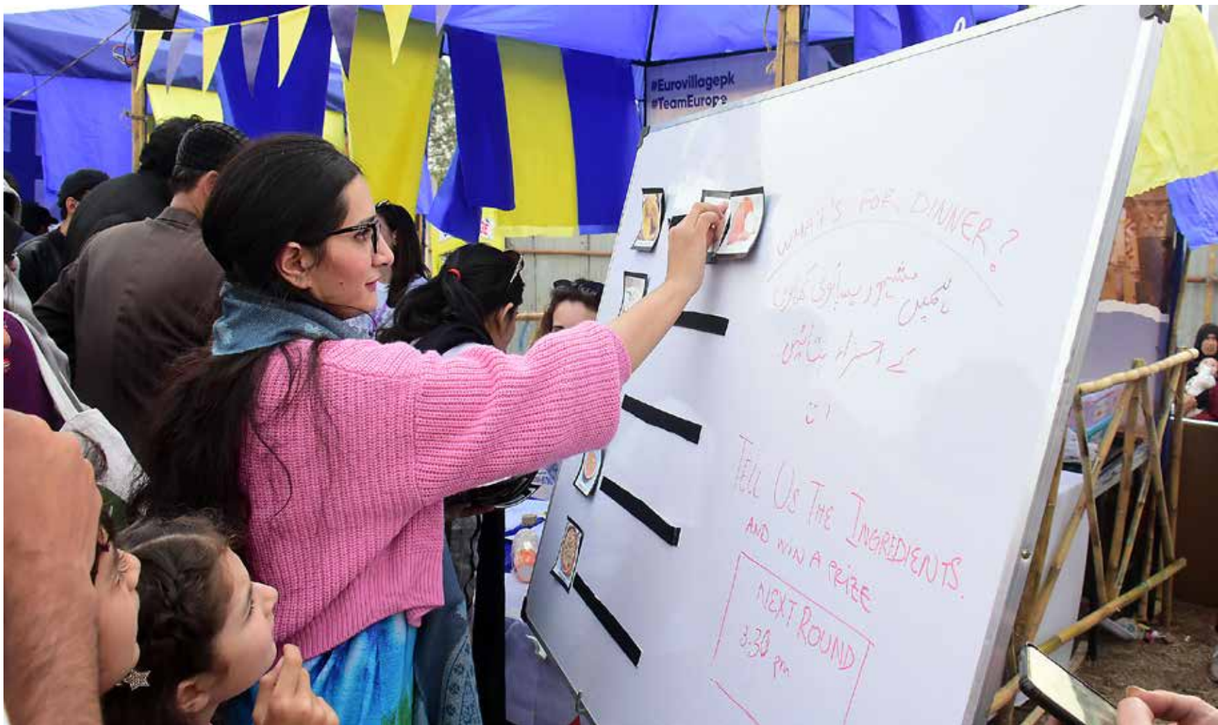
ISLAMABAD: Families taking part in a quiz on the occasion of Euro Village festivities.