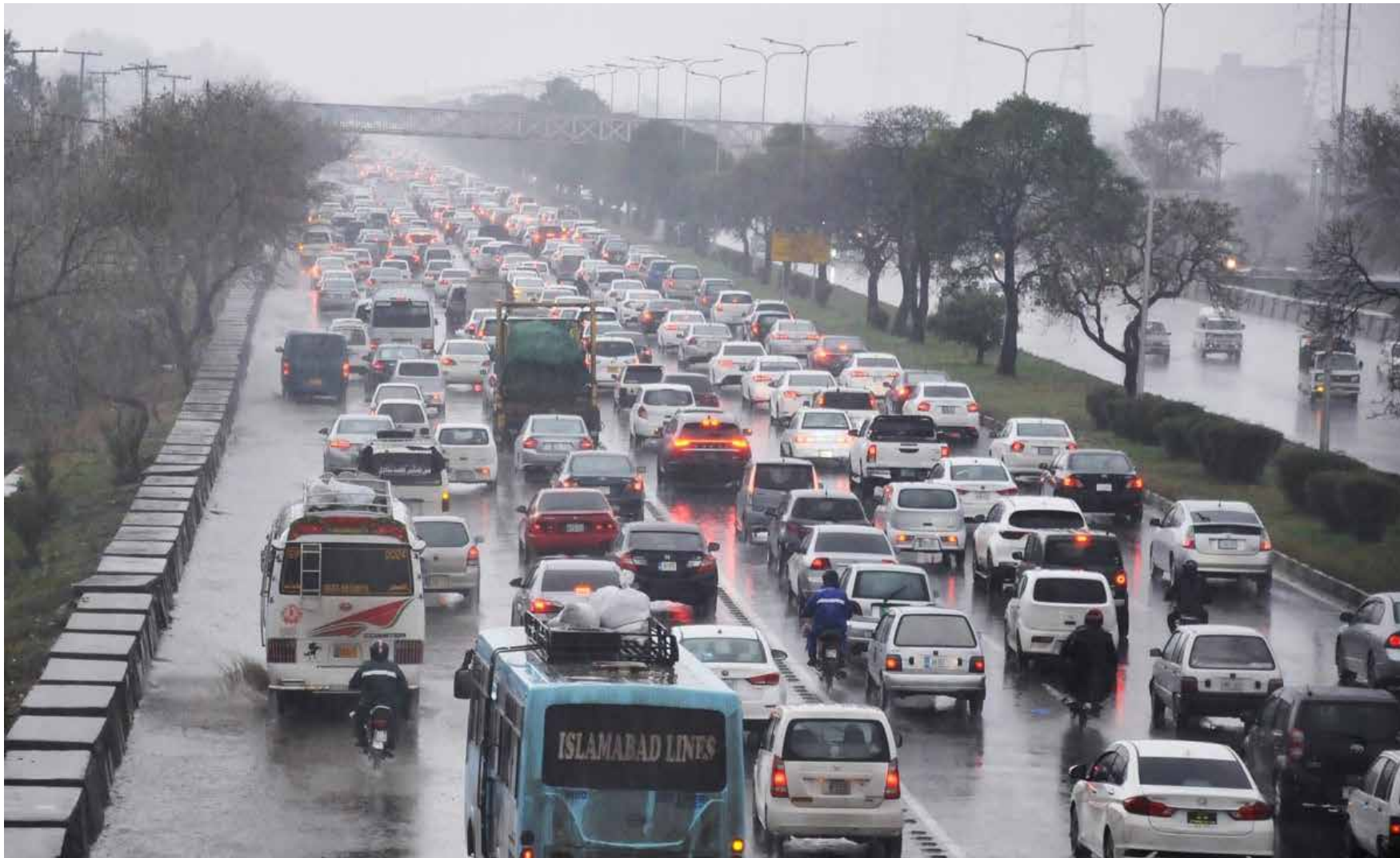
ISLAMABAD: A view of massive traffic jam at Islamabad Expressway during rain that experienced in the Federal Capital.

HONG KONG: China's top diplomat Wang Yi had a message for his European counterparts over the weekend: no matter how the world changes, China will be "consistent and stable" — a "force for stability." The claim, which Wang delivered during remarks at the Munich Security Conference on Saturday, comes as European leaders are warily watching the upcoming United States elections — concerned that the potential return of former President Donald Trump could upend their partnership with Washington. Those concerns flared in the past week after Trump said he would not defend NATO allies that failed to spend enough on defense — a stunning threat for many in Europe as Russia's invasion grinds on in Ukraine. The timing of Trump's comments couldn't have been better for Wang, who is visiting Europe as Beijing struggles to repair deteriorating relations with the bloc — an effort made more urgent by its domestic economic struggles and ongoing frictions with the US. "No matter how the world changes, China, as a responsible major country, will keep its major principles and policies consistent and stable and serve as a staunch force for stability in a turbulent world," Wang said during remarks in Munich, while calling for China and Europe to "stay clear of geopolitical .