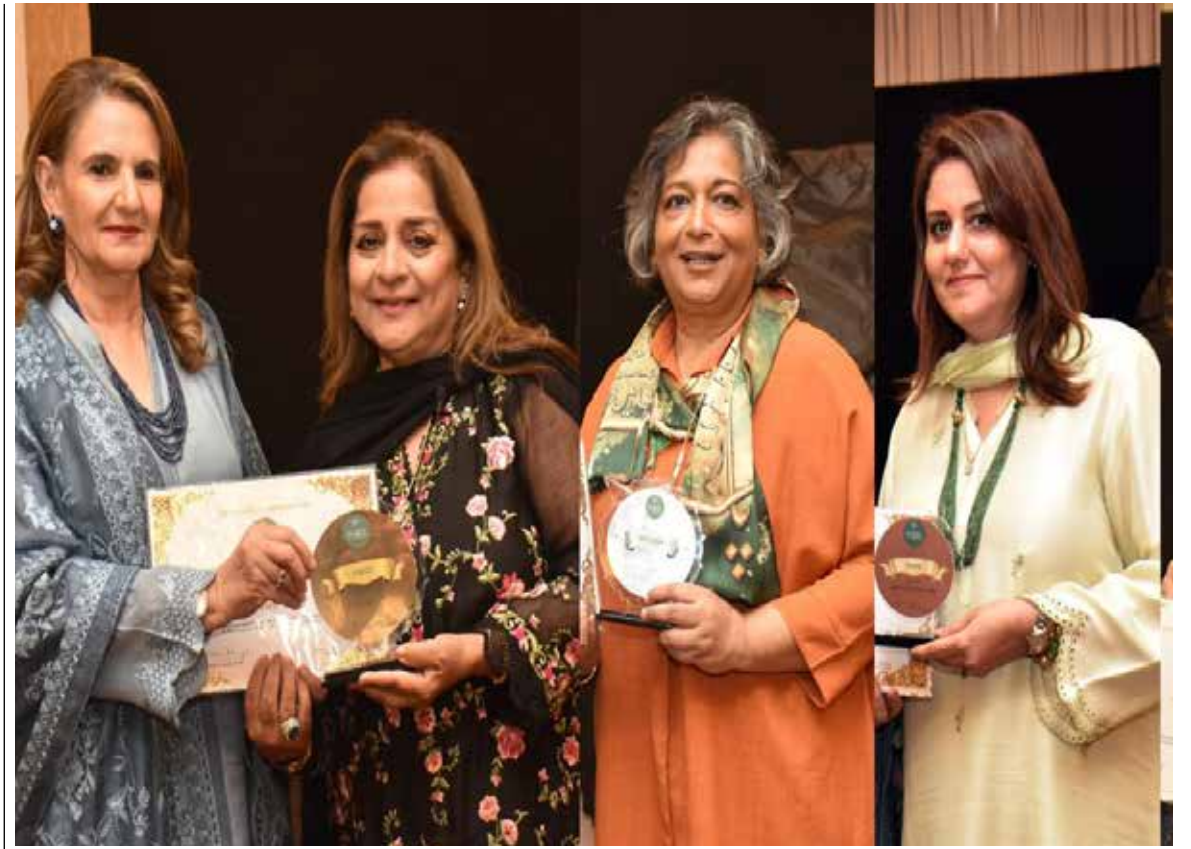
KARACHI: First Lady Begum Samina Alvi, distributing mementos at the award distribution ceremony organized by the Floral Arts Society, Gardenia Chapter.