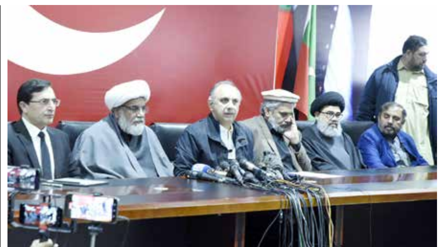
ISLAMABAD: PTI Chairman Ali Gohar Khan and Secretary General Omar Ayub along with chiefs of MWM and Sunni Ittehad addressing a press conference.