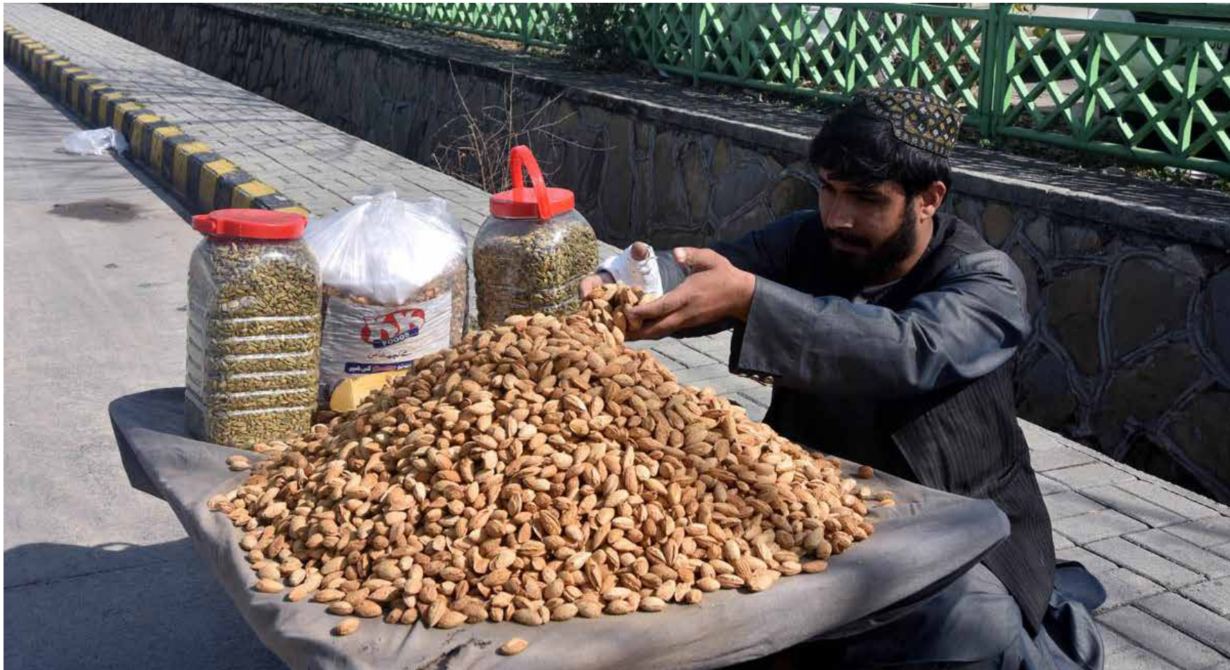
ISLAMABAD: A Vendor displaying Dry Fruits to attract the customers at Srinagar Highway in the Federal Capital.