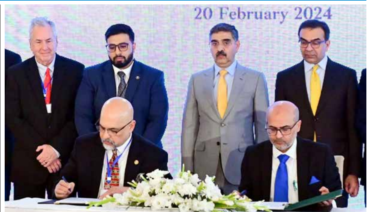
ISLAMABAD: Caretaker Prime Minister Anwaar-ul-Haq Kakar witnesses the signing ceremony between Pakistan Mineral Development Corporation and Miracle Saltworks Collective Inc. (USA) for joint venture agreement for the value addition and export of pink salt.