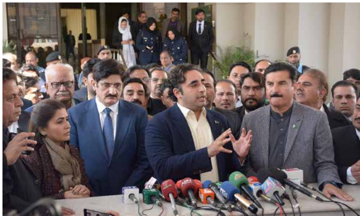
ISLAMABAD: Bilawal Bhutto-Zardari along with other party officials talking to media outside the Supreme Court of Pakistan after attending the hearing of a presidential.