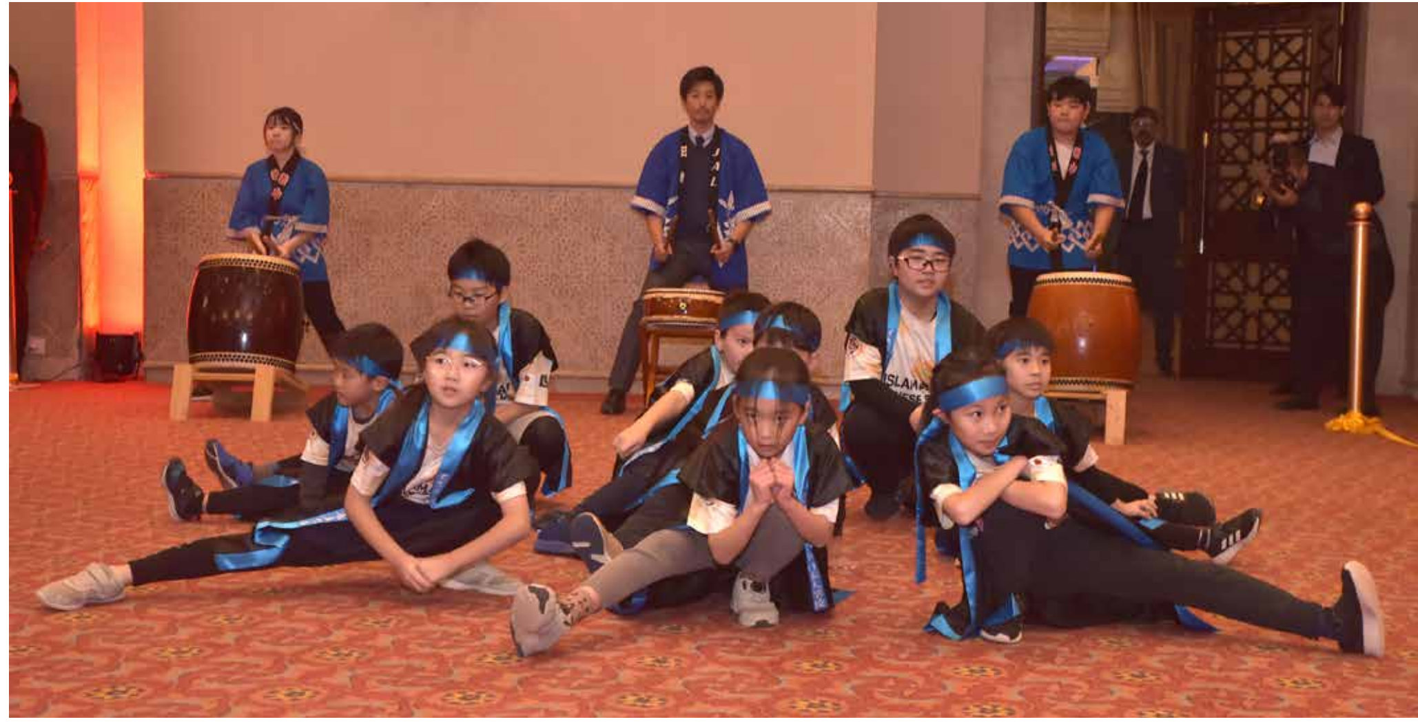
ISLAMABAD: Children presenting a martial art show on the occasion of Japanese emperor's birthday celebrations. -DNA