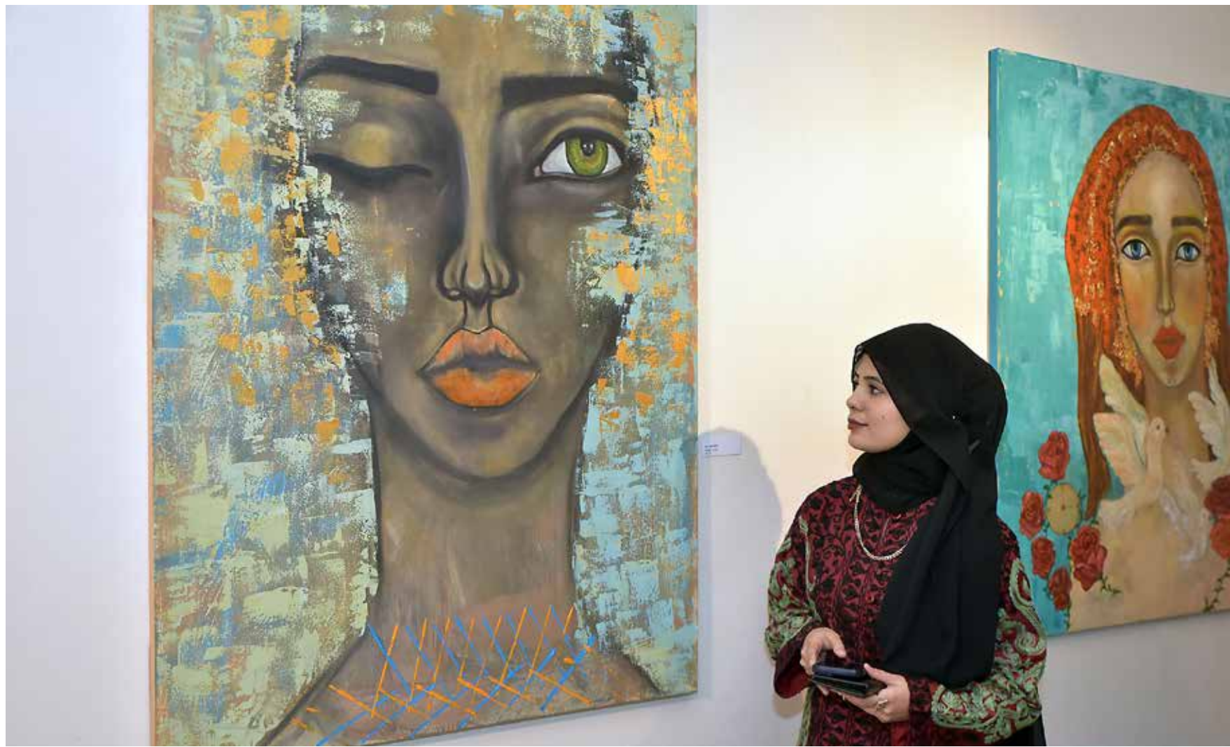
ISLAMABAD: A visitor takes keen interest in paintings during an exhibition organized by the Jordan embassy at the PNCA.

ISLAMABAD: The Senate witnessed the presentation of 25 Standing Committee reports on Tuesday. The standing committees included the report of the Committee on a Bill further to amend the Constitution [The Constitution (Amendment) Bill, 2022], the report of the Committee on a Bill further to amend the Constitution [The Constitution (Amendment) Bill, 2022], the report of the Committee on a point of public importance raised by Senator Sardar Muhammad Shafiq Tareen regarding Circuit Benches of Balochistan High Court, the report of the Committee on a Bill further to amend the Constitution [The Constitution (Amendment) Bill, 2022], the present report of the Committee on a Bill further to amend the Constitution [The Constitution (Amendment) Bill, 2023], the report of the Committee on the subject matter of Starred Question No. 96, asked by Senator Gurdeep Singh, the report of the Committee on a Bill further to amend the Cutting of Trees (Prohibition) Act, 1992 [The Cutting of Trees (Prohibition) (Amendment) Bill, 2023], the report of the Committee on a Bill further to amend the Factories Act, 1934 [The Factories (Amendment) Bill, 2023], the report of the Committee on a Bill further to amend the Guardians and Wards Act, 1890.—APP