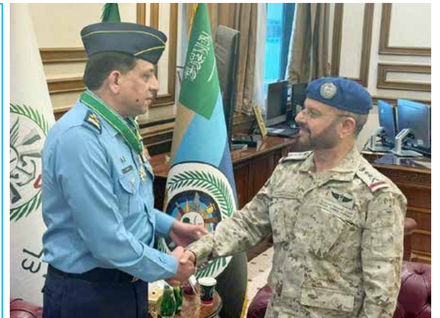
RIYADH: Air Chief Marshal Zaheer Ahmed Baber Sidhu, Chief of the Air Staff, Pakistan Air Force called on General Fayyadh bin Hamed Al-Ruwaili, Chief of the General Staff, Saudi Armed Forces. During the visit, the Air Chief was awarded King Abdul Aziz Badge of Honor of the Excellent Class by Chief of the General Staff, Saudi Armed Forces.