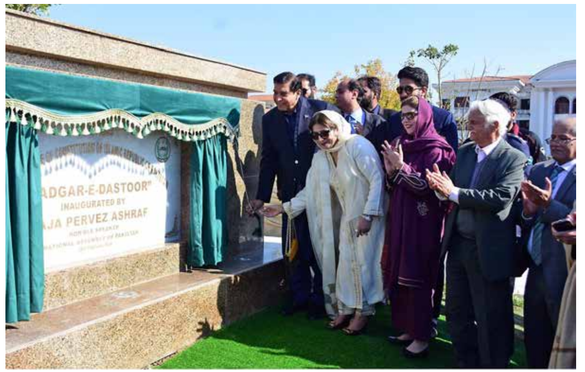
ISLAMABAD: Speaker National Assembly Raja Pervez Ashraf inauguration of Yadgar-e-Dastoor monument on a green belt along Constitution Avenue in the Federal Capital.

ement. Concrete measures are being taken to facilitate increased representation of youth in various sectors, particularly in mineral exploitation and education provision, he added. Expressing gratitude for the unwavering support of the tribal populace, Lt Gen Hayat commended their resilience and solidarity in standing alongside the Pakistan Army throughout the anti-terrorism campaign.