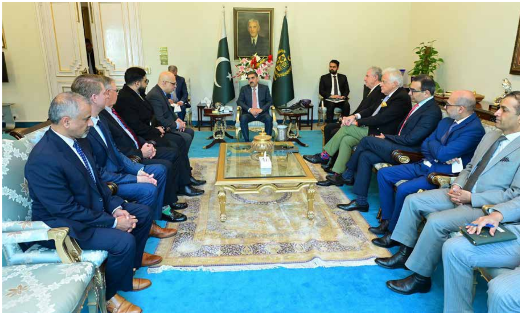
ISLAMABAD: A delegation of Miracle Salt Collective Inc called on Caretaker Prime Minister Anwaar-ul-Haq Kakar.—DNA