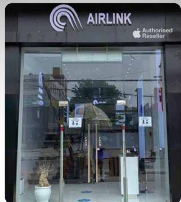
AIR LINK FLAGSHIP STORE XINHUA MALL, LAHORE