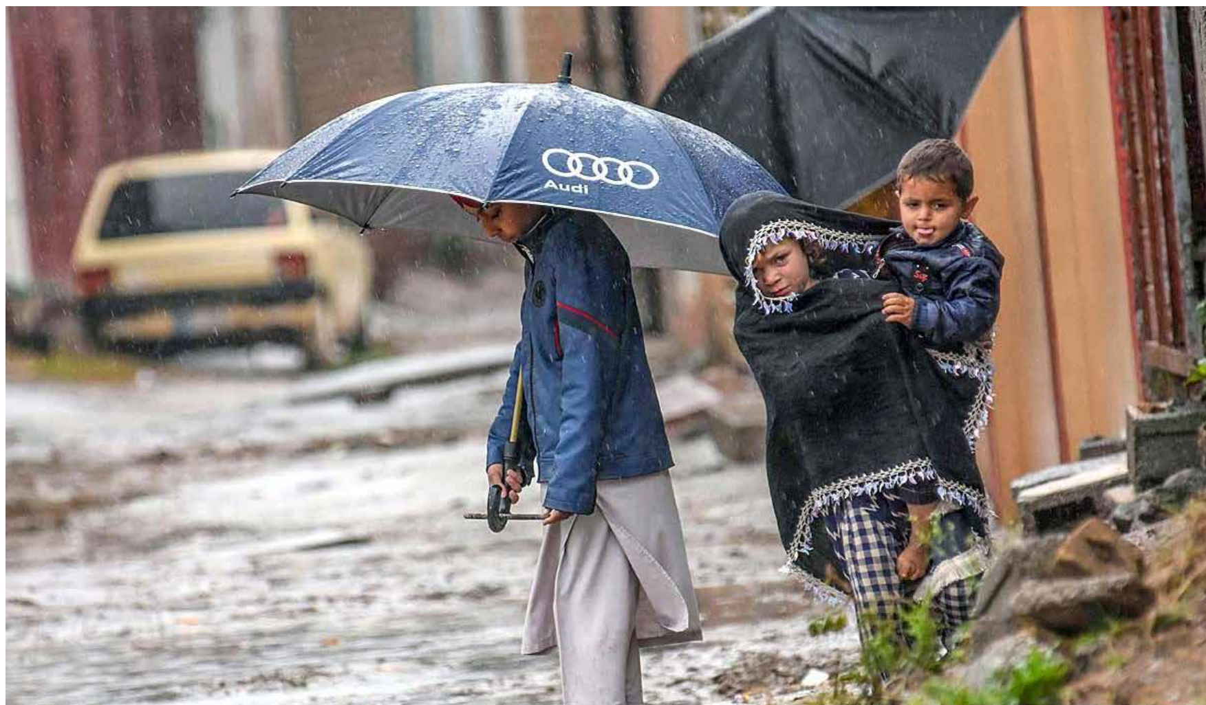
ISLAMABAD: A girl on the way carrying her younger brother during rain that experienced the Federal Capital.

ISLAMABAD: Deputy Chairman Senate, Mirza Muhammad Afridi on Friday directed the National Disaster Management Authority (NDMA) and Provincial Disaster Management Authority (PDMA) Balochistan to expedite relief and rehabilitation efforts in the flood-hit Gwadar with core focus on extending assistance to the deserving victims. National Party (NP)'s Senator Muhammad Tahir Bizinjo on a public attention notice raised the issue of calamity-hit Gwadar that has been recently ravaged by torrential rains causing flooding in the entire port city. Senator Tahir Bizinjo said that the coastal areas of the country particularly Balochistan have been badly impacted by the recent heavy rains and left Gwadar submerged under rainwater including houses, businesses, public property and infrastructure. He alleged that the relief and rehabilitation efforts were slow and accused the NDMA, PDMA Balochistan and district administration of Gwadar of poor performance and conduct in the disaster-hit area. He also raised his concerns pertaining to looting of relief money, resources and relief items to be sent for the flood victims of Gwadar and alleged that the relief assistance would not reach the genuine victims or impacted population. The Senator mentioned that as per his sources, there was already shortage of food items leading to epidemics break out in the impacted areas. He vehemently demanded the quarters concerned to ensure provision of relief items to the impacted population.