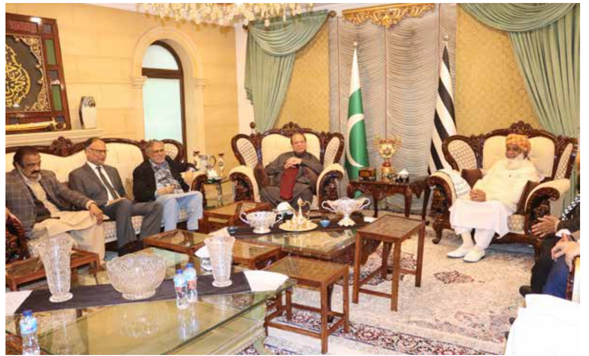
ISLAMABAD: Nawaz Sharif, the Leader of the Pakistan Muslim League-Nawaz (PML-N), pays a visit to the residence of Maulana Fazlur Rehman, chief of JUI-F along with other party leaders.