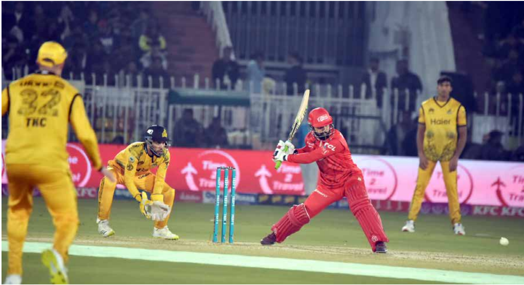
RAWALPINDI: Players of Peshawar Zalmi and Islamabad United in action during the PSL match at Rawalpindi Cricket Stadium.

FROM PAGE 01 Bilawal Bhutto-Zardari, Punjab, Sindh, and Balochistan chief ministers - Maryam Nawaz, Murad Ali Shah, and Sarfraz Bugti - were also present at the ceremony.