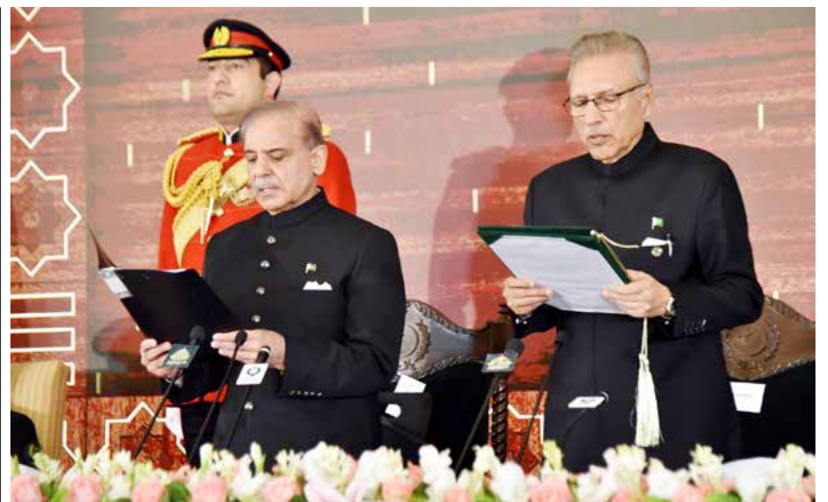
ISLAMABAD: President Dr Arif Alvi administering the oath of office to Mian Muhammad Shehbaz Sharif as the Prime Minister of the Islamic Republic of Pakistan, at Aiwan-e-Sadr.