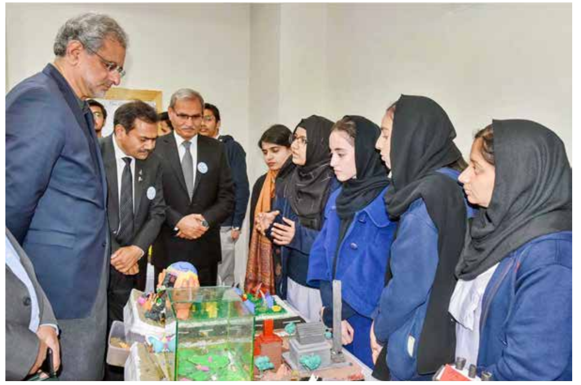
RAWALPINDI: Former Prime Minister Shahid Khaqan Abbasi along with Chaudhary Muhammad Akram keenly viewing Science & Arts Exhibition of Punjab College of Commerce.