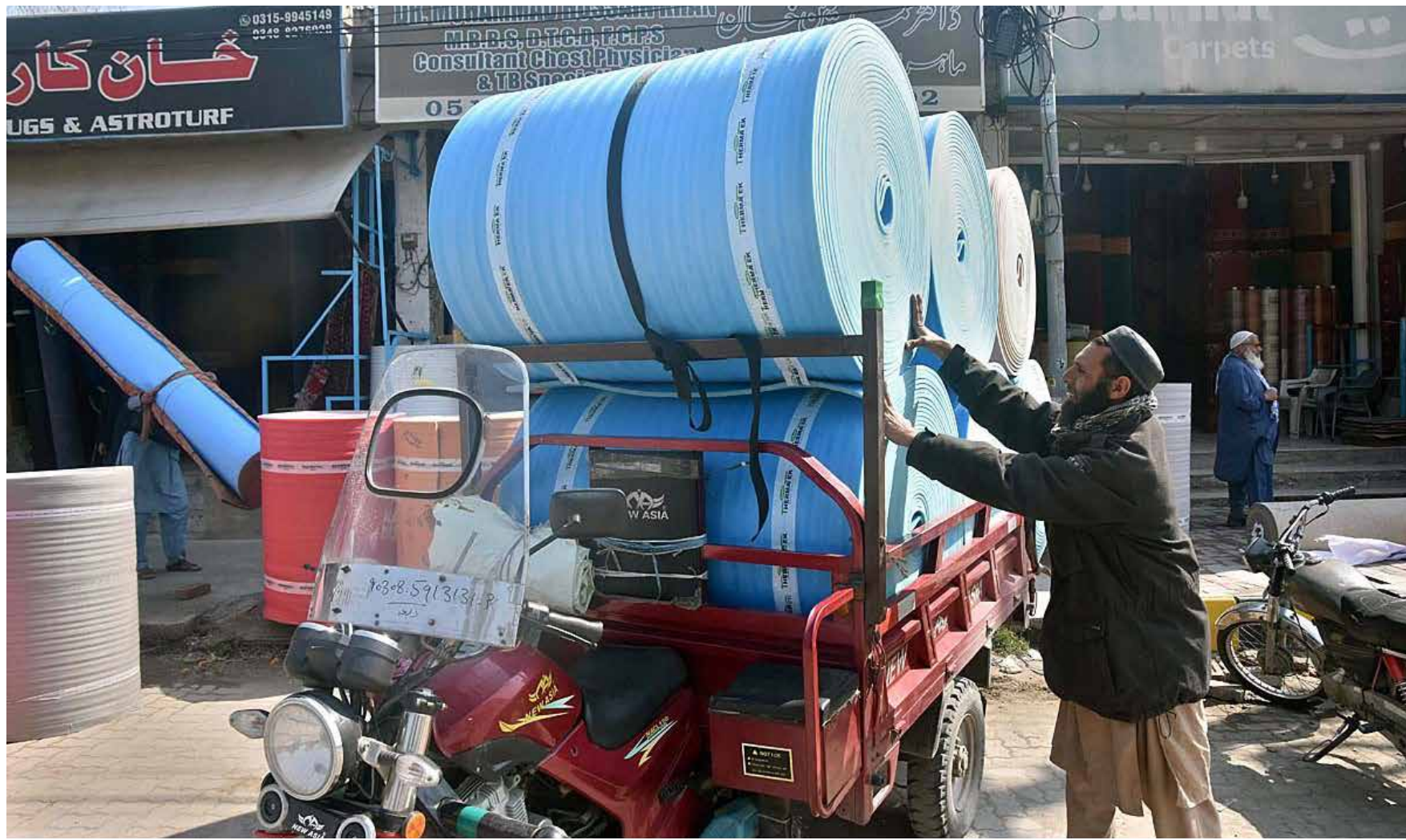
RAWALPINDI: A labourer loading foamic sheets on loader rickshaw at Said Pur Road.