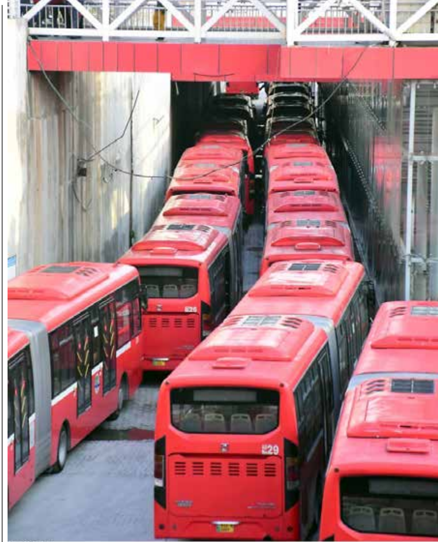
ISLAMABAD: A view of metro buses stand at Secretariat station in the Federal Capital due to metro bus service closed during PSL matches in the Rawalpindi.—ONLINE

BANGKOK : Thailand's employment growth accelerated in the final quarter of last year due to expansion in the vital tourism industry, the country's economic planning agency said on Monday. The Southeast Asian country's labor force amounted to 40.3 million individuals in the fourth quarter of 2023, representing a 1.7 percent year-on-year increase, up from a 1.3 percent increase in the previous quarter, according to the National Economic and Social Development Council (NESDC). The growth was mainly attributed to an expansion of employment in the non-agricultural sectors, which rose 2.0 percent year-on-year to 27.9 million jobs, the NESDC said in a statement. Employment in the hotel and restaurant sectors jumped 8.0 percent from a year earlier, owing to a rebound in foreign tourist arrivals. However, manufacturing jobs contracted by 2.3 percent on the back of a slowdown in the production of key industrial products. The kingdom's unemployment rate was registered at 0.81 percent in the October-December period.—APP