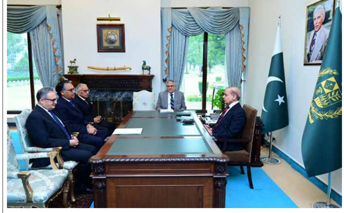
ISLAMABAD: Former Caretaker Minister for Foreign Affairs Jalil Abbas Jilani calls on Prime Minister Shehbaz Sharif.

Jamy, Law Officer at FOS-PAH, shed light on the procedures available for lodging harassment complaints emphasizing that all genders, transgendered including individuals, are protected under the law. She outlined the definition of harassment and elaborated on the expanded scope of the law, highlighting its focus on real issues at the workplace. The event