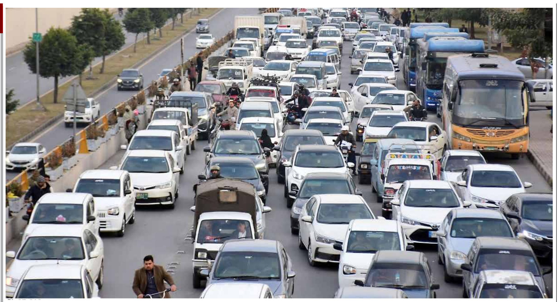
ISLAMABAD: A view of massive traffic jam at Blue area in the Federal Capital.

NIAMEY : It's been two weeks since the lifting of tough sanctions on military-ruled Niger, but the pace of economic recovery is slow and the generals have shown no inclination