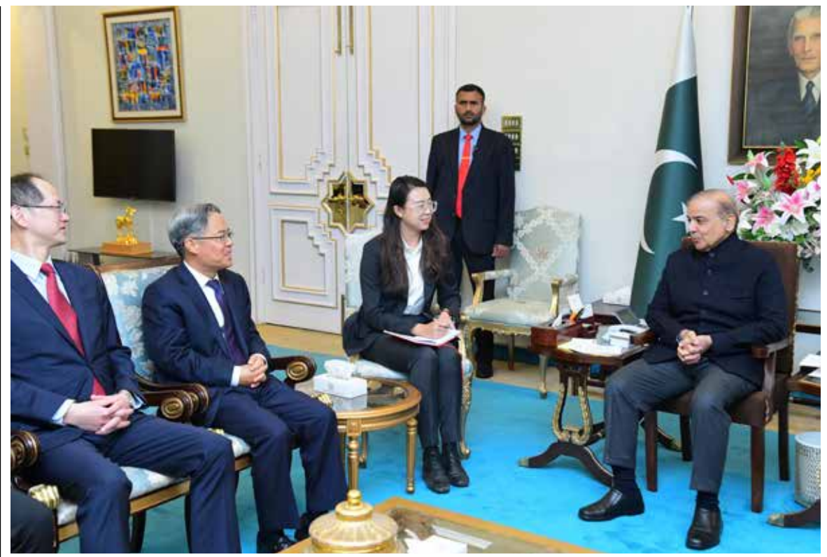
ISLAMABAD: Ambassador of the People's Republic of China Ambassador Jiang Zaidong calls on Prime Minister Muhammad Shehbaz Sharif.