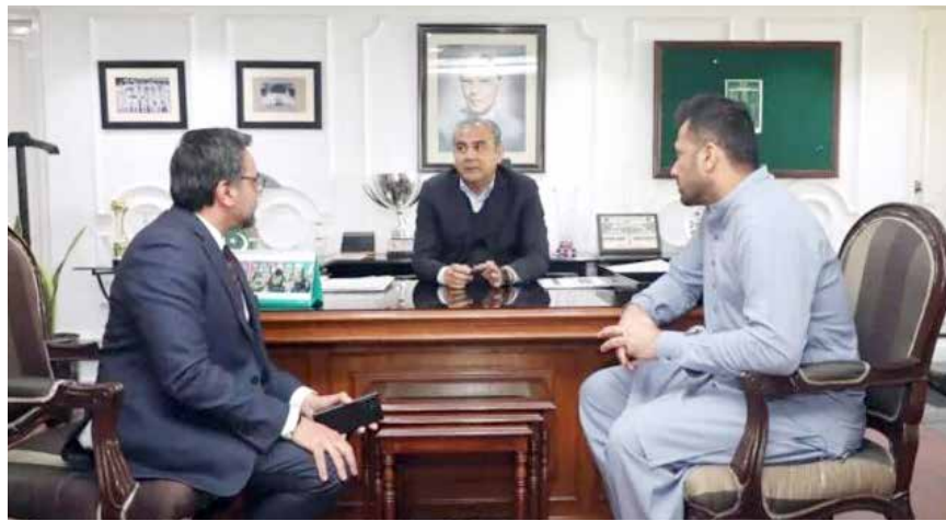
mary moved by the Prime Minister Shehbaz Sharif today, to appoint Naqvi as one of the federal ministers in terms of clause 1