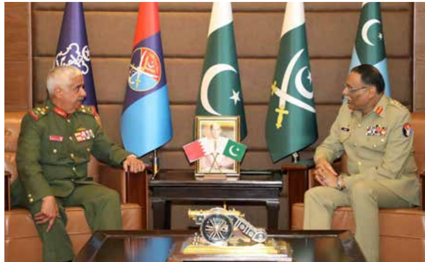
RAWALPINDI: General Sheikh Mohammed Bin Isa Bin Salman Al Khalifa, Commander Bahrain National Guard, calls on General Sahir Shamshad Mirza, Chairman Joint Chiefs of Staff Committee.

Bahrain leadership for their messages of felicitations on his re-election as Prime Minister. He said Pakistan and Bahrain enjoyed longstanding brotherly relations. The two countries had excellent defence cooperation, and the visit of His Highness would enhance these relations even further. On trade, the Prime Minister stated that once the Pakistan-GCC Free Trade Agreement would come into effect, the existing bilateral trade volume of USD 1 billion per annum had the potential to enhance manifold. The Prime Minister referred to the King Hamad Nursing Hospital that was under construction in Islamabad. He said this