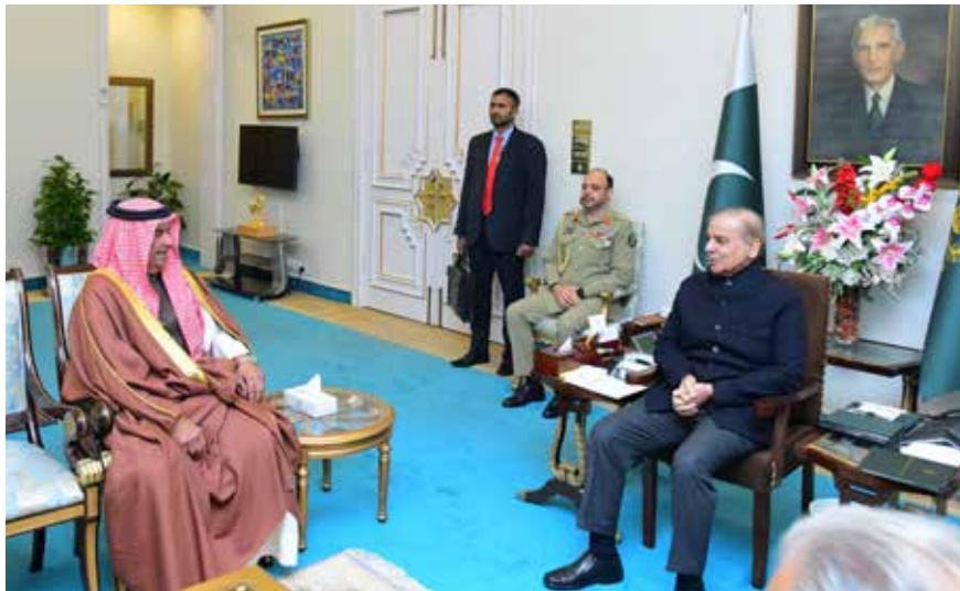
ISLAMABAD: General Sheikh Mohammad Bin Isa Bin Salman Al Khalifa, Commander of the National Guard of Bahrain calls on PM Shehbaz Sharif.

The situation in Gaza was also discussed and both sides called for an immediate ceasefire and ensuring urgent provision of humanitarian assistance to the innocent Palestinians