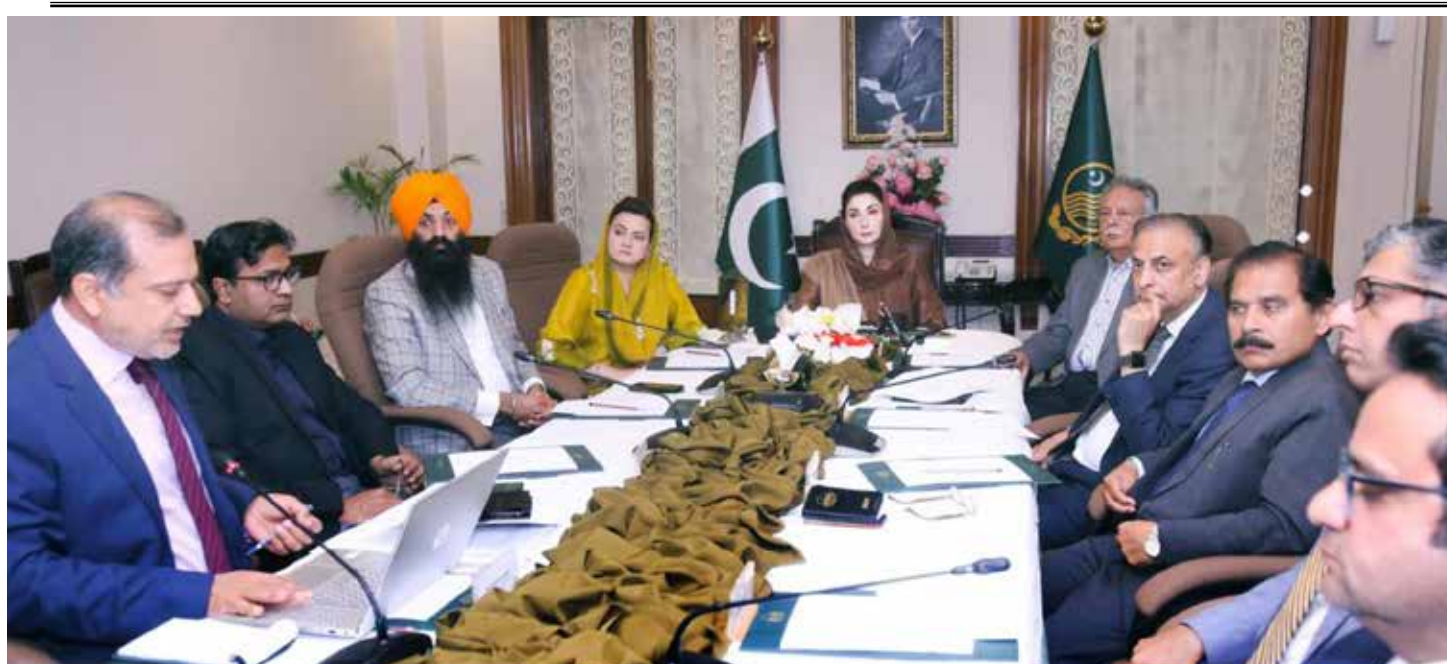
LAHORE : Punjab Chief Minister Maryam Nawaz is presiding over a high-level meeting on the promotion of tourism.—DNA

interest rates, improve exports, increase foreign exchange reserves and revive the economy. Pakistan has excellent potential to promote exports of IT, pharmaceuticals, textiles and other sectors, so the business community should work with the government to solve the problems of the export sector and create a favorable environment for export promotion. ICCI will fully cooperate with the Government in its efforts to improve business and economic activities in the country. The government should start working on the budget proposals in consultation with all chambers of commerce and associations in the country so that a comprehensive document of proposals based on the views of the business community can be presented to the government for the next budget. On this occasion, Secretary General UBG Zafar Bakhtawari said that the business community will provide its full support to the government for economic stability, the business community is playing the most important role in the development of the economy. Will work with the newly elected government to promote ease of doing business in the country and improve the economy.