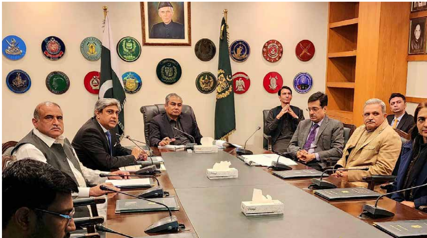
ISLAMABAD : Federal Minister for Interior Mohsin Naqvi chairing a meeting at Ministry of Interior.

ISLAMABAD: Foreign Minister Ishaq Dar has received congratulatory messages from his counterparts of various countries on assuming his office. Foreign Minister of Czech Republic Jan Lipavsky, congratulating Ishaq Dar on his appointment as the Minister of Foreign Affairs of Pakistan said Czechia and Pakistan had long enjoyed friendly and constructive relations. Foreign Minister of Maldives Moosa Zameer also extended congratulations saying he was confident that the bilateral relations will continue to grow stronger under his leadership. Likewise Ukrainian FM Dmytro Kuleba congratulating Ishaq Dar on his appointment as Pakistan's 39th Foreign Minister wished him every success in his most responsible mission. "I look forward to expanding mutually beneficial bilateral and international cooperation between Ukraine and Pakistan", he added. FM Dar in his post on X (formerly twitter) thanked the Czech FM Jan Lipavsky for his warm congratulatory message. "I look forward to further strengthen the bonds of friendship between Pakistan and Czechia for our mutual benefit," he said.—APP