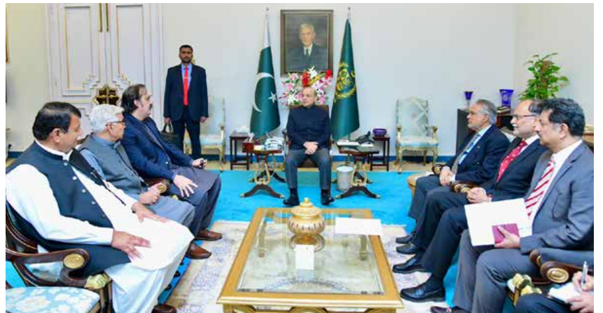
ISLAMABAD: Chief Minister Khyber Pakhtunkhwa Ali Amin Khan Gandapur calls on Prime Minister Muhammad Shehbaz Sharif.