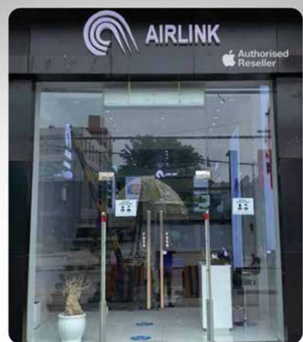
AIR LINK FLAGSHIP STORE XINHUA MALL, LAHORE

ISLAMABAD: To prevent the spread of blasphemy content on social media and raise awareness about it, a non-governmental organization 'Legal Commission on Blasphemy Pakistan' has announced to observe "Youm-e-Tahafuz-Namoos-e-Rasalat" on March 15. The commission has appealed to the public to participate in this awareness campaign actively. According to a statement issued by the commission, there has been an increase in the spread of blasphemous content by some malicious elements on various social media platforms. Also, an increase in sharing of such content in specific groups on various websites has been reported. In this regard, the commission said, educational institutions, mosque imams, intelligentsia, lawyers, media representatives, social media activists, and religious, and political leaders can play an important role to sensitize the masses about the negative impacts of blasphemous content on social media. To control this phenomenon, the commission urged that all sections of society including governmental and non-governmental organizations, must play their part.—DNA