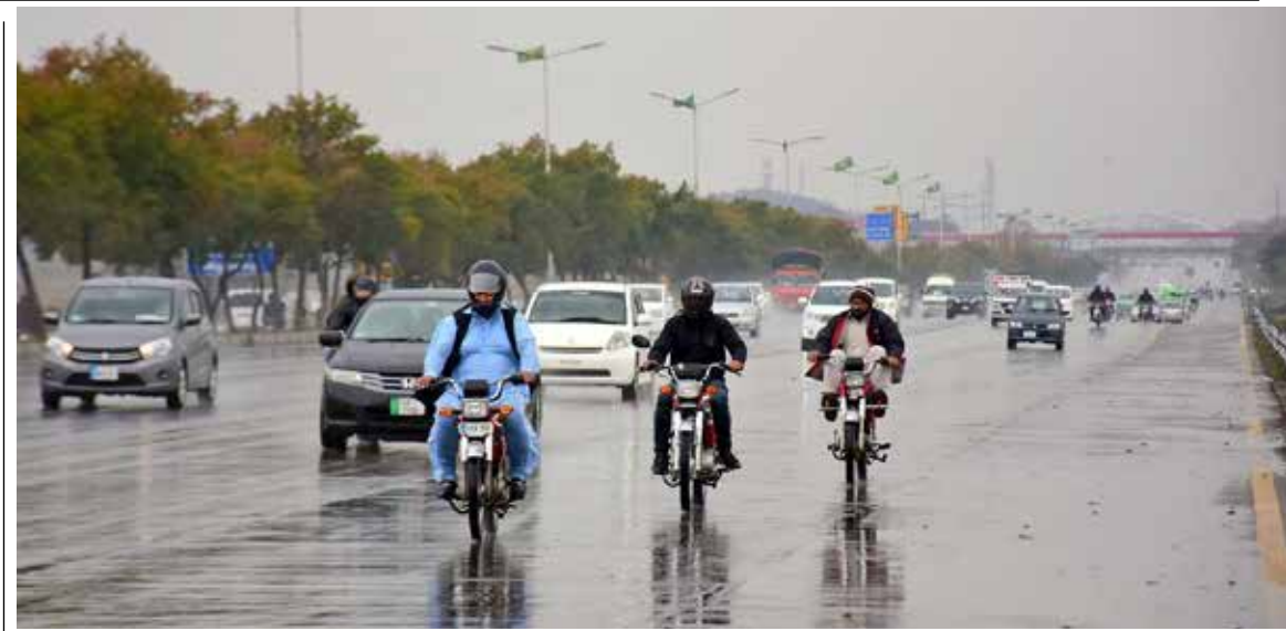
ISLAMABAD: Traffic continue during the rain on Srinagar Highway in the Federal Capital.