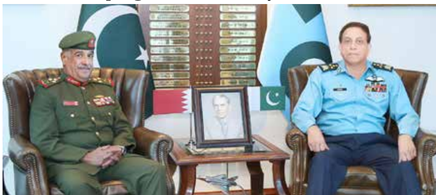
ISLAMABAD: His Highness General Shaikh Mohammed Bin Isa Bin Salman Al-Khalifa calling on Air Chief Marshal Zaheer Ahmed Baber Sidhu, Chief of the Air Staff.

The visiting dignitary praised the exceptional professionalism of PAF personnel and the remarkable progress achieved by Pakistan Air Force