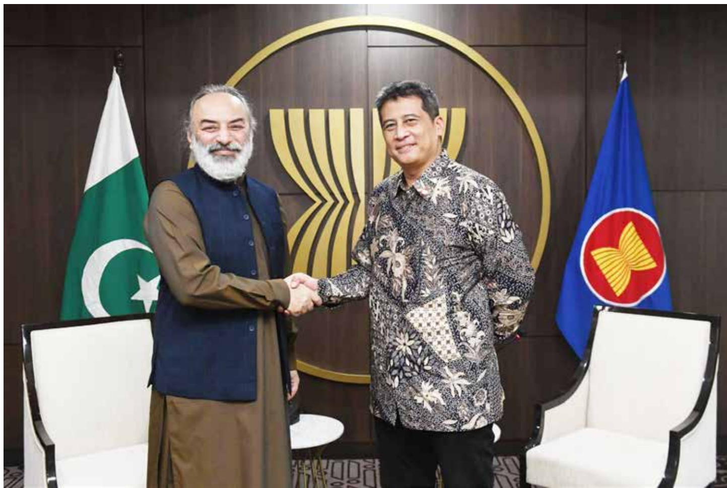
JAKARTA: Ambassador Ameer Khurram Rathore met with Mr. Nararya Soeprapto Deputy Sec-Gen ASEAN. They exchanged views on the implementation of the ASEAN-Pakistan cooperation projects, with the view to further strengthen the ASEAN-Pakistan cooperation in the near future.—DNA

TOKYO : Tokyo stocks shrugged off early losses and ended higher on Thursday, with the market supported by gains in value stocks and heavyweights including Uniqlo's parent company. The benchmark Nikkei 225 index advanced 0.29 percent, or 111.41 points, to close at 38,807.38, while the broader Topix index gained 0.49 percent, or 13.08 points, to 2,661.59. "The market was dragged down by Tokyo Electron and other chip shares following losses of semiconductor-related shares in the US, while traders speculate on policy changes at next week's BOJ meeting," IwaiCosmo Securities said. "But after the sell-off, the market gradually picked up, supported by value stocks such as natural resources and materials." The dollar stood at 147.89 yen, against 147.78 yen seen Wednesday in New York. Uniqlo operator Fast Retailing jumped 1.62 percent to 43,880 yen while SoftBank Group climbed 0.46 percent to 8,591 yen. Nissan added 2.23 percent to 564 yen after several media reported, citing sources, that the automaker is considering a tie-up with Honda in electric vehicles. Nissan declined to comment when contacted by AFP. Honda gained 1.12 percent to 1,752 yen. Nippon Steel fell 0.58 percent to 3,586 yen after reports said US President Joe Biden plans to intervene in the firm's proposed purchase of US Steel.—Agencies