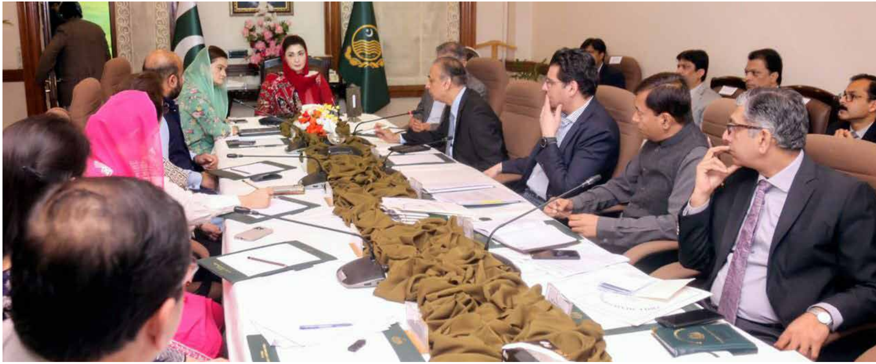
LAHORE: Punjab Chief Minister Maryam Nawaz Sharif is presiding over a meeting related to school education. – DNA

FROM PAGE 01 emerging technologies emphasis on drone technology and collaboration within the Cyber and Networking domains were discussed. Air Chief stressed the deep-rooted brotherly relations between both nations. The visiting dignitary praised the exceptional professionalism of PAF personnel and the remarkable progress achieved by Pakistan Air Force. Commander Bahrain National Guard also visited PAF Cyber Command where he was briefed about the operational capabilities of Pakistan Air Force. Expressing profound interest in the strides made by PAF in the Cyber domain, the visiting dignitary conveyed his intention to dispatch a specialized team to PAF to assess and address any existing gaps within the emerging technologies architecture of the Bahrain Armed Forces.