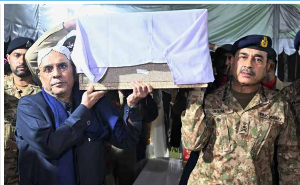
RAWALPINDI: President of Pakistan, Asif Ali Zardari and Chief of Army Staff, General Syed Asim Munir carrying the coffin of Army officer who embraced martyrdom in Mir Ali terrorist attack.