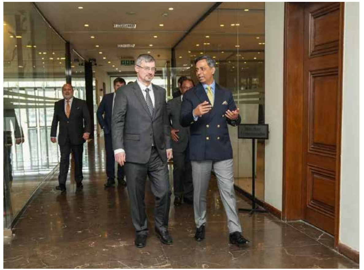
ISLAMABAD: Russian Ambassador to Pakistan visits headquarters of the National Logistic Cell. The ambassador was briefed about the working of the organization.