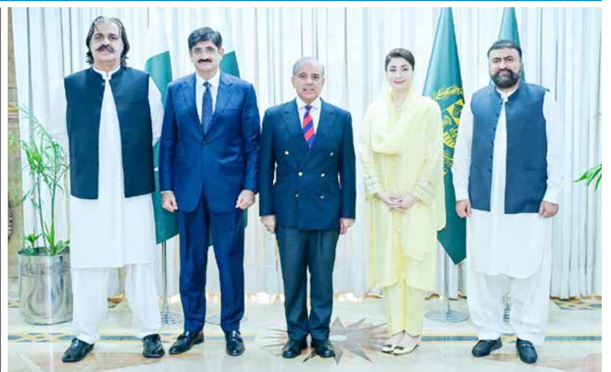
ISLAMABAD: Prime Minister Muhammad Shehbaz Sharif in a group photo with Chief Ministers of all the provinces.