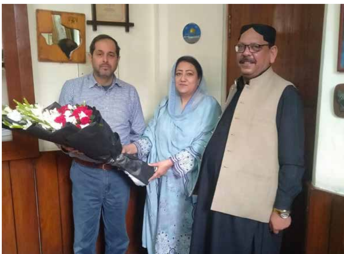
ISLAMABAD: Former MP Asiya Nasir presenting a bouquet to Govt spokesman MNA Isphanyar Bhandhara, in his office.