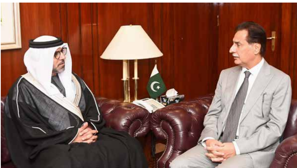
ISLAMABAD: Ambassador of the United Arab Emirates Mr. Hamad Obaid Ibrahim Alzaabi called on Speaker National Assembly Sardar Ayaz Sadiq at Parliament House.

He particularly highlighted ADB's assistance through Policy Based Lending (PBL) to mitigate the impacts of the pandemic and floods. Furthermore, the status of ongoing policy-based programs, including the Public Private Partnership (PPP) Program and the Climate and Disaster Resilience Enhancement Program (CDREP) were also discussed. Acknowledging ADB's pivotal role in promoting climate-conscious programs across Asia and the Pacific, the Minister emphasized the alignment of ADB's climate operations with Pakistan's own climate goals and commitments. The Minister outlined Government's priority areas for achieving macro-economic stability and sustainability, including measures to enhance revenue, SOEs reforms, privatization, and public-private partnerships. Concluding the meeting, both parties reaffirmed their commitment to strengthening the partnership between Pakistan and ADB, with a shared goal of promoting sustainable economic growth.