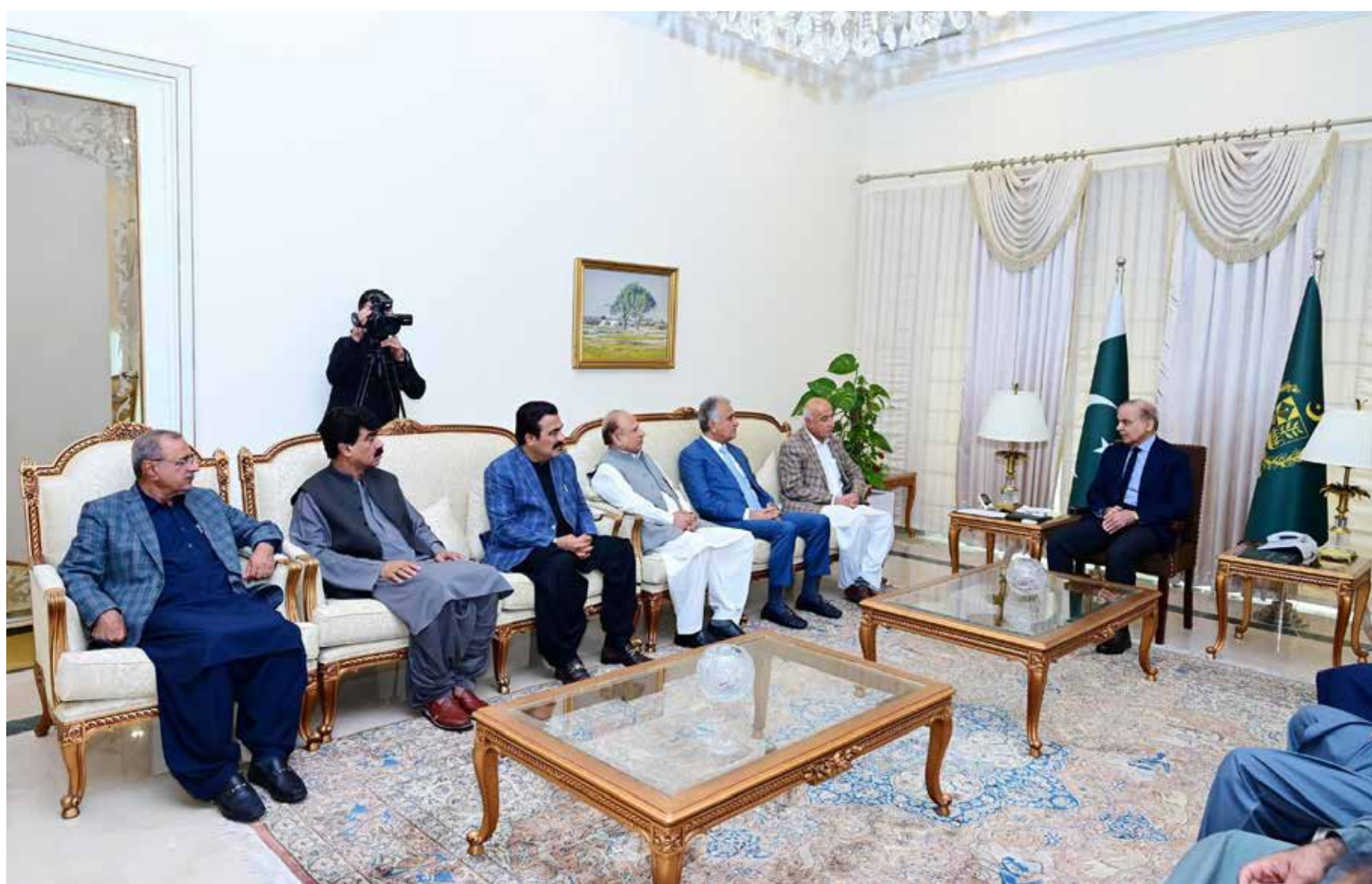
ISLAMABAD : A delegation of the National Party called on Prime Minister Muhammad Shehbaz Sharif.—DNA

WASHINGTON : Increasing global water scarcity is fuelling more conflicts and contributing to instability, the United Nations warns in a new report, which says access to clean water is critical to promoting peace. The UN World Water Development Report 2024, released on Friday, said 2.2 billion people worldwide have no access to clean drinking water and 3.5 billion people lack access to safely managed sanitation. Girls and women are the first victims of a lack of water, said the report, published by the UN Educational, Scientific and Cultural Organization (UNESCO), especially in rural areas where they have the primary responsibility of collecting supplies. Spending several hours a day on fetching water, coupled with a lack of safe sanitation, is a contributing factor to girls dropping out of school. "Water shortages not only fan the flames of geopolitical tensions but also pose a threat to fundamental rights as a whole, for example.—Agencies