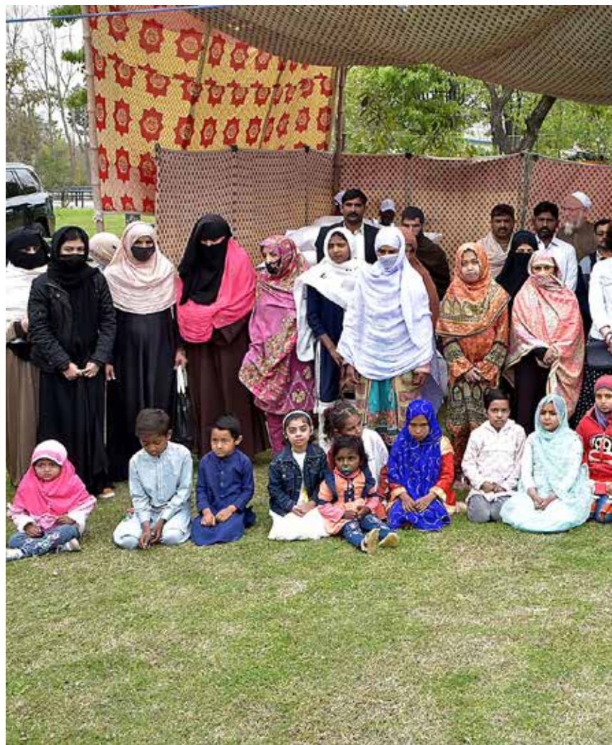
ISLAMABAD: Ambassador of Azerbaijan and his wife posing for a picture with the recipients of gifts from Azerbaijan embassy on the occasion of holy month of Razadan.