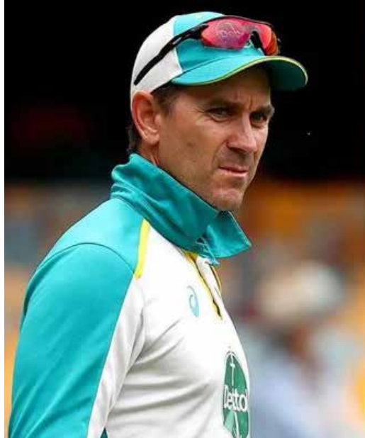
leaving the PCB scrambling to find a suitable replacement. Initially, the PCB engaged in

LAHORE: The Pakistan Cricket Board (PCB) is interested in hiring South Africa's Gary Kirsten or Australia's Justin Langer for the role of head coach. Kirsten coached the Indian team while Langer has served as Australia's coach in the past. The board is keen on securing a long-term contract for the new coach. The PCB continues its quest to fill the vacant position of Pakistan's head coach. Since the dismissal of Grant Bradburn in the aftermath of a disappointing ODI World Cup campaign last year, the men in green have been without a designated head coach. Former all-rounder Mohammad Hafeez temporarily filled the void, serving as both team director and head coach during Pakistan's tours of Australia and New Zealand. However, Hafeez stepped down from the post last month,