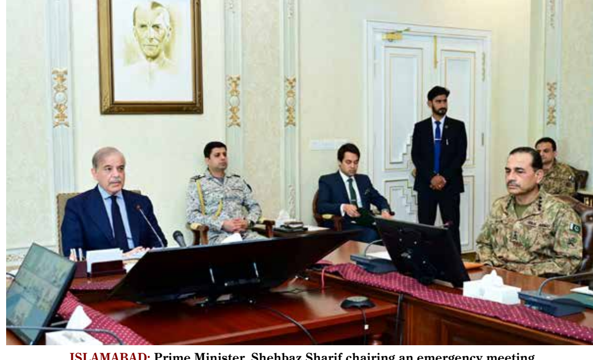
ISLAMABAD: Prime Minister, Shehbaz Sharif chairing an emergency meeting in the aftermath of Besham terrorist attack on Chinese nationals, COAS General Asim Munir is also present at the meeting.

ister M Ishaq Dar hosted the Annual interfaith iftar for the Islamabad-based diplomatic community at Ministry of Foreign Affairs, Islamabad. Prime Minister Muhammad Shehbaz Sharif graced the occasion as the Guest of Honour. The event aimed to foster interfaith harmony and propagate the message of tolerance and inclusivity. It also underscored Pakistan's strong commitment to combating Islamophobia and all forms of discrimination.