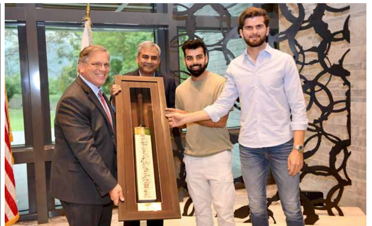
ISLAMABAD: Pakistani star cricketers, Shaheen Shah and Shadab Khan presenting US Ambassador a signed cricket bat during a meet-and-greet event at the US embassy.