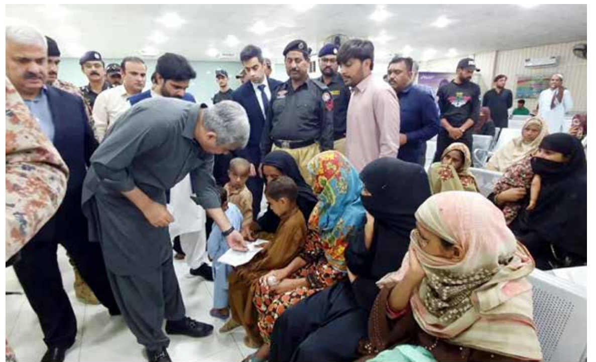
SUKKUR: Federal Minister for Interior Mohsin Naqvi listening to the issues of women during his visit to Sukkur's NADRA Center.