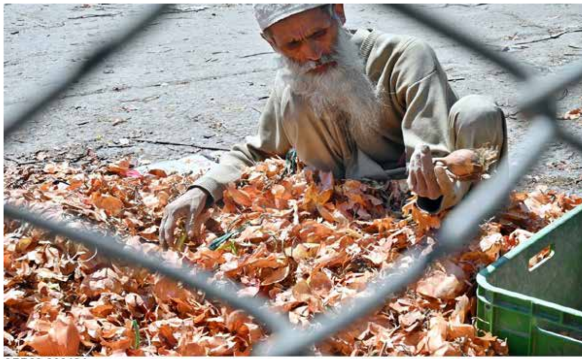
ISLAMABAD: An elderly labourer busy in sorting good quality onion at Vegetable Market in Federal Capital as International Labour Day is celebrated on May 1 every year. It's a day to honour and appreciate the contributions of workers all around the world. This day recognizes the hard work and dedication of people who work in various fields to make our lives better.

in response to a deadly air strike on the Iranian consulate in Syria. Jordan, while working with the United States, has insisted that it does not want to be caught in the middle of the conflict.