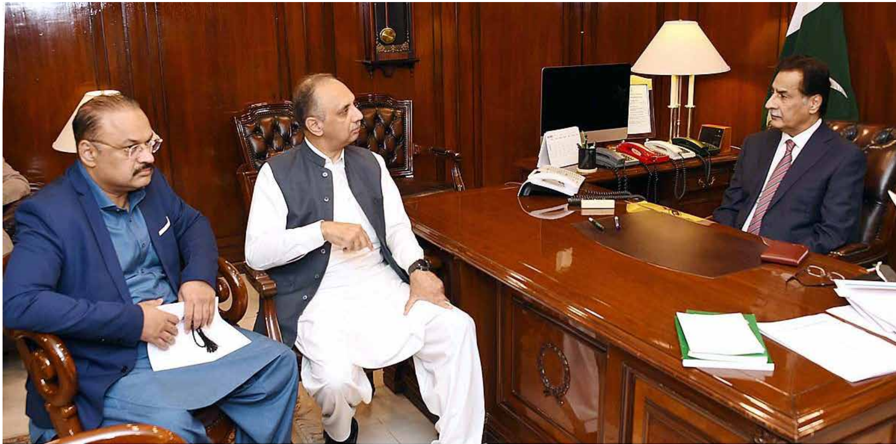
ISLAMABAD: Speaker National Assembly Sardar Ayaz Sadiq met with Leaders of Opposition Parties in National Assembly at Parliament House.