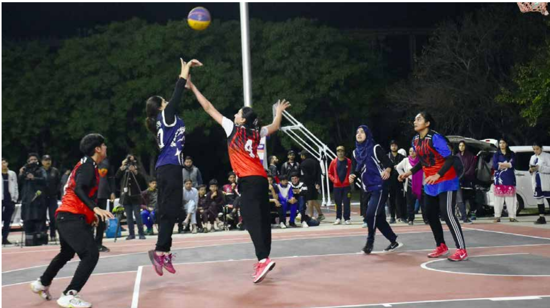
ISLAMABAD: Army and Laycons, A womens category final of All Pakistan Ramadan Cup Basketball Tournament at Pakistan Sports Complex in the Federal Capital organised by Federal Basketball Association. Pakistan Army won this match with 12-5.

FROM PAGE 01 levels of debt and tightly constrained foreign exchange reserves," the WB report said. The report said under the current policy settings, and unless a major structural reform programme was durably implemented, growth was expected to remain muted amid continued very low investment, persistent external imbalances (likely necessitating continued import and capital management measures), distortionary fiscal policies, and a large state presence in the economy.