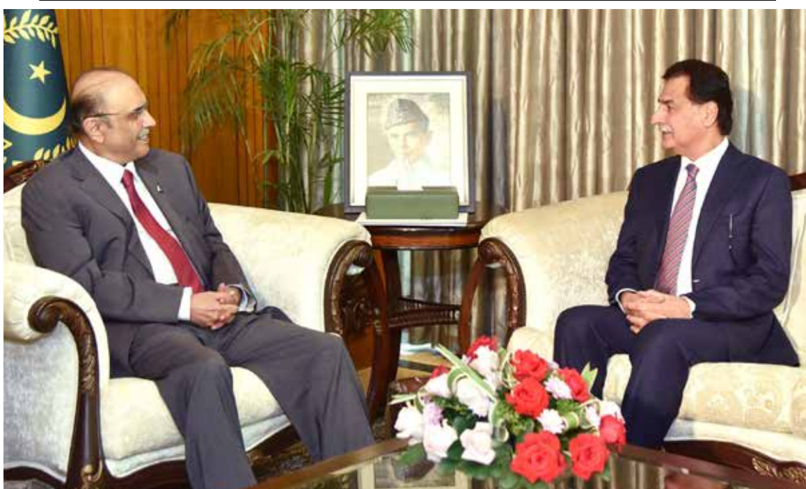
ISLAMABAD: Speaker National Assembly of Pakistan, Sardar Ayaz Sadiq calls on, President of Pakistan, Asif Ali Zardari.

doing anything for money, not guided by any religious or political considerations, only financial ones," he explained, adding that "any information can be easily bought and sold" in such a market. The actions of all law enforcement agencies, supervisory bodies and commercial organizations who were in charge of security at the Crocus City Hall are now being evaluated, the president said. "We have paid a very high price, and the analysis of the situation has to be extremely objective and professional," he insisted. Putin said that a "new level" of security must be implemented at places where large numbers of people gather, such as at sporting venues, shopping and entertainment centers, schools, hospitals, theaters and others. Russia's security agencies and police have been on high alert since the Crocus City Hall terrorist attack. All four suspected perpetrators, who are Tajik nationals, were captured the next day as they were driving towards Ukraine. Several more people who allegedly aided them in preparing and staging the massacre have been arrested since then. Islamic State Khorasan (ISIS-K) has claimed responsibility for the attack on the concert venue. FSB chief Alexander Bortnikov has suggested that the US, UK, and Ukraine might also be linked to the crime, possibly using radical Islamists as proxies. All three have denied their involvement; Washington and Brussels have insisted that Kiev had nothing to do with the massacre. - Agencies