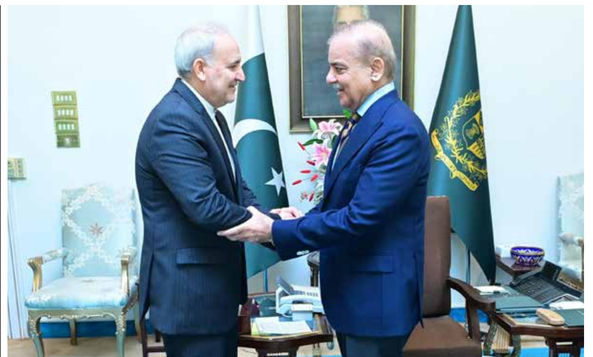
ISLAMABAD: Ambassador of the Islamic Republic of Iran Reza Amiri Moghadam called on Prime Minister Muhammad Shehbaz Sharif.