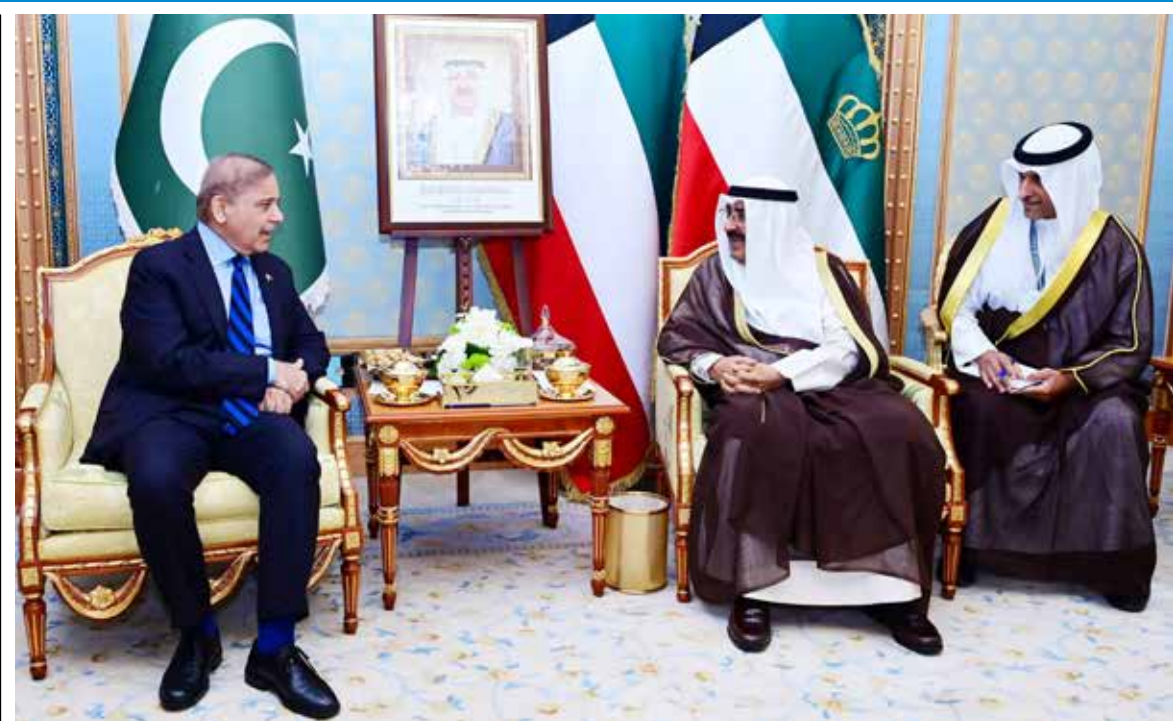
RIYADH: Prime Minister Shehbaz Sharif meets the Amir of Kuwait Sheikh Meshal Al-Ahmad Al-Jaber Al-Sabah on the sidelines of a special meeting of the World Economic Forum. – DNA