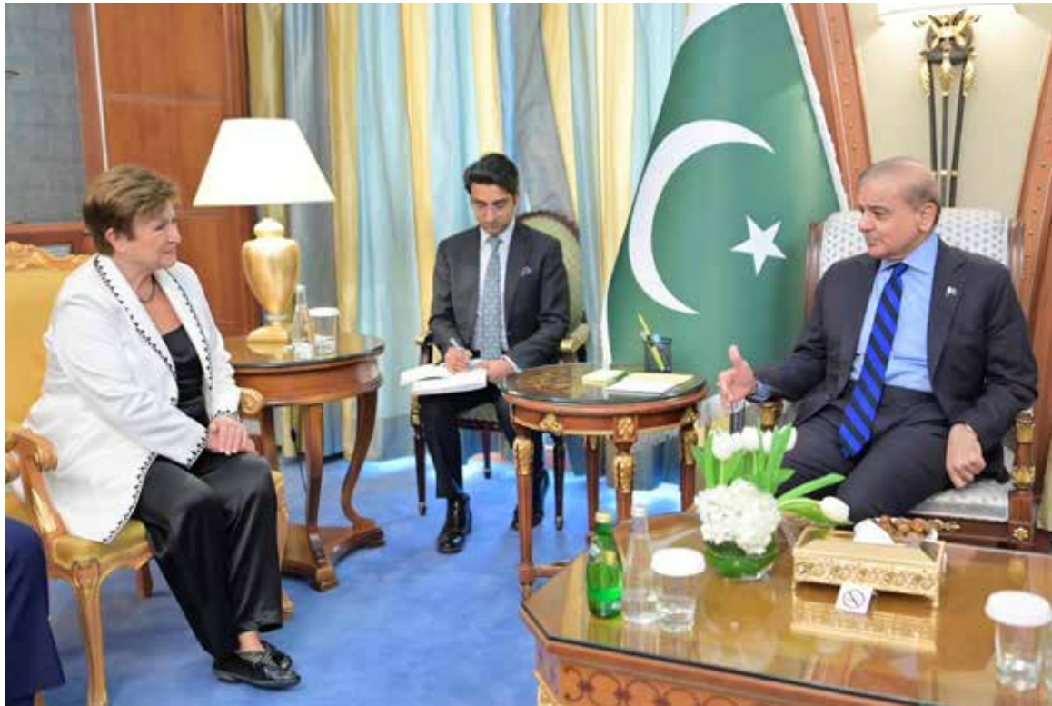
RIYADH: Managing Director of International Monetary Fund calls on Prime Minister Shehbaz Sharif on the sidelines of a special meeting of the World Economic Forum. Detail news on Page 01.