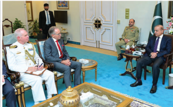
ISLAMABAD: High Commissioner of Australia to Pakistan H.E. Neil Hawkins calls on Prime Minister Muhammad Shehbaz Sharif on 23 April, 2024.