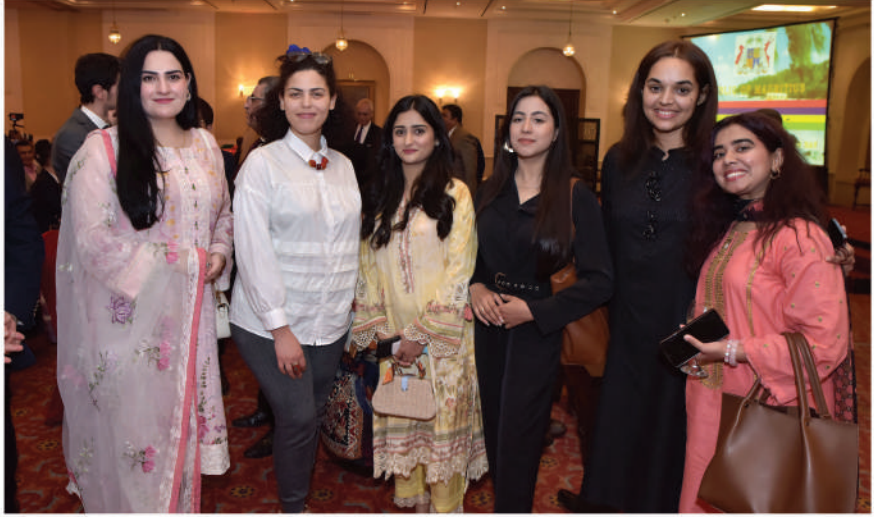
ISLAMABAD: Women attending the Independence Day function organised by the Mauritius High Commission, at the Islamabad Serena Hotel.