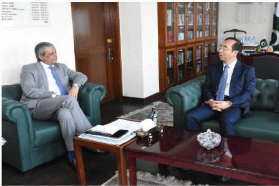
ISLAMABAD : H.E WADA Mitsuhiro, Ambassador of Japan to Pakistan, Paid a courtesy call to Minister for Law and Justice senator Azam Nazeer Tarar.—DNA

Minister for Local Government and Rural Development Raja Faisal Muntaz Rathore said on Tuesday that the first tranche of Rs 411 million, including Rs 133 million for rural councils, had been released while the second one of Rs 408 million would be disbursed soon.