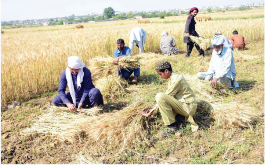
ISLAMABAD: Farmers harvesting the wheat crop in the Golra area of Federal Capital.

NAIROBI : More than 50,000 people have been displaced by clashes in a disputed area in northern Ethiopia, the United Nations said, as the international community expressed concern about the violence involving fighters from rival regions. "The number of people displaced by the armed clashes in Alamata Town, and Raya Alamata, Zata and Oba, since 13/14 April has reached more than 50,000," the UN said late Monday, citing local authorities in the disputed area, which is claimed by Tigray and neighbouring Amhara. "The humanitarian situation is dire, with thousands of women and children in need of broad humanitarian support to survive," it added. Amhara forces occupied Raya Alamata in southern Tigray during a two-year war between Ethiopia's government and regional Tigrayan separatist forces. Under a peace deal between Prime Minister Abiy Ahmed's government and Tigrayan authorities, Amhara forces which backed federal troops during the conflict — were due to withdraw from Raya Alamata after the agreement was signed in Addis Ababa in November 2022.—Agencies