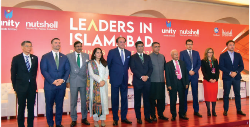
ISLAMABAD: Federal Minister for Finance and Revenue Mr. Muhammad Aurangzeb delivered a keynote address at Leaders in Business Summit Islamabad.