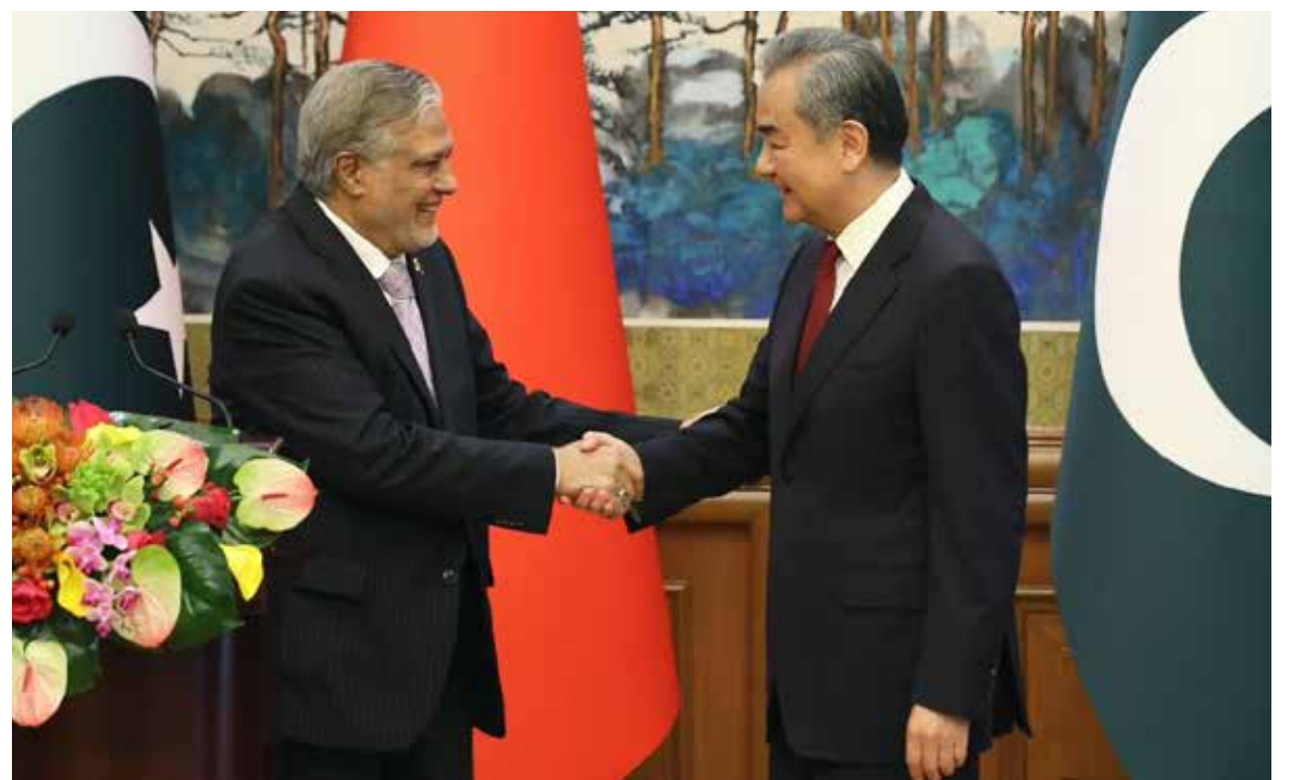
BEIJING: Ishaq Dar Deputy Prime Minister and Foreign Minister Ishaq Dar and Chinese Foreign Minister Wang Yi addressing a joint press stake-out. - DNA