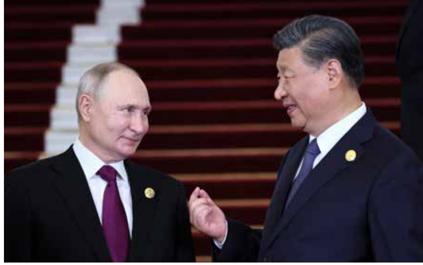
political significance," Putin said, referring to a 12-point position paper published by

MOSCOW: Russian President Vladimir Putin hailed Beijing's "genuine desire" to help resolve the Ukraine crisis, in an interview with Chinese state media published ahead of a two-day visit to the country. Putin arrives in Beijing on Thursday to meet his "dear friend" Xi Jinping, seeking to win greater support from China for his war effort in Ukraine and isolated economy. The visit, where he will also travel to the northeastern city of Harbin for a trade and investment expo, is Putin's first trip abroad since his March re-election and his second in just over six months to China. "We commend China's approaches to resolving the crisis in Ukraine," Putin told the Xinhua state news agency in a Moscow interview, which was also carried in English on the Kremlin website. "Beijing is well aware of its root causes and global geo-