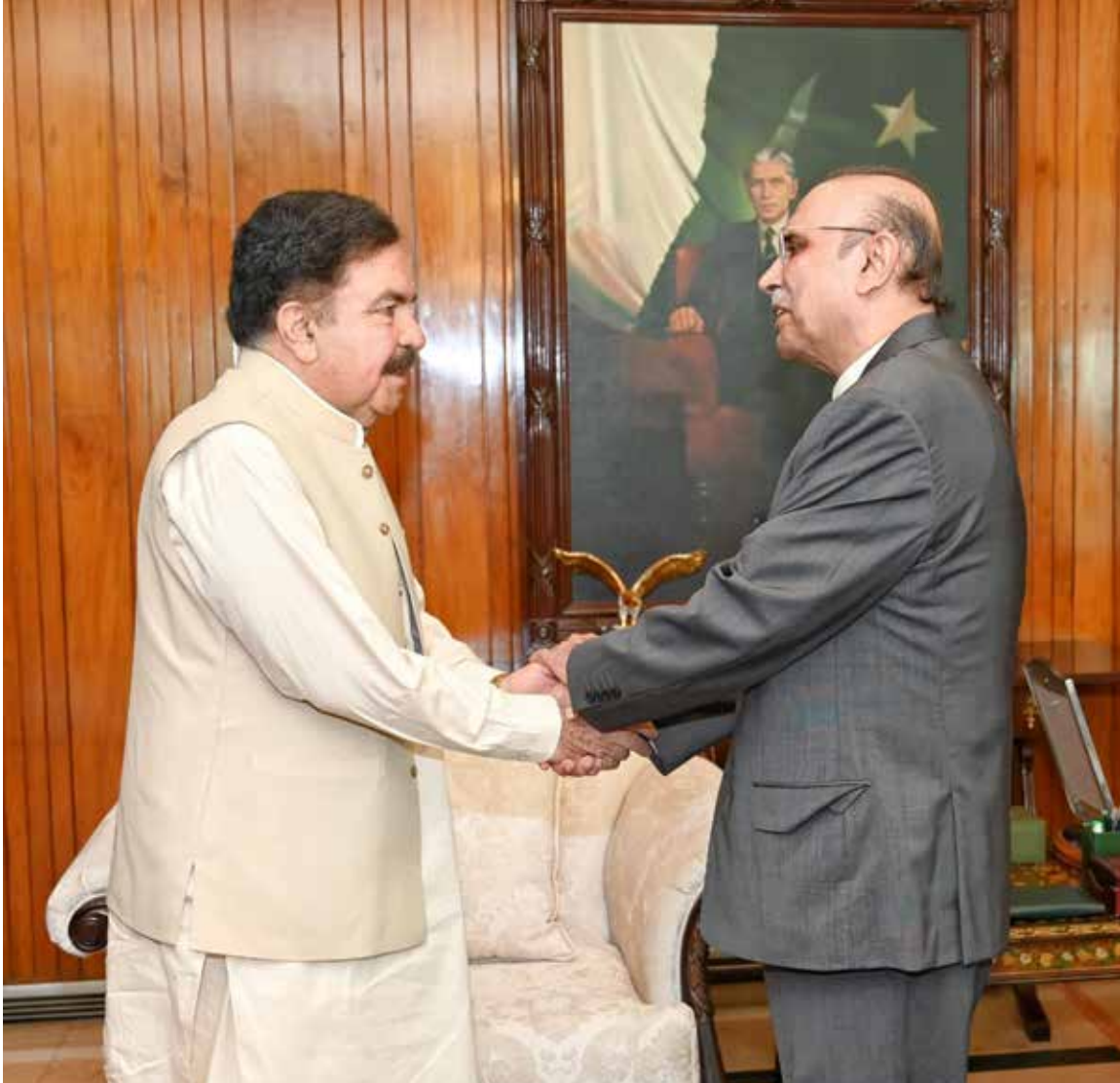
ISLAMABAD: Governor Balochistan, Shaikh Jaffar Khan Mandokhail, called on President Asif Ali Zardari, at Aiwan-e-Sad.