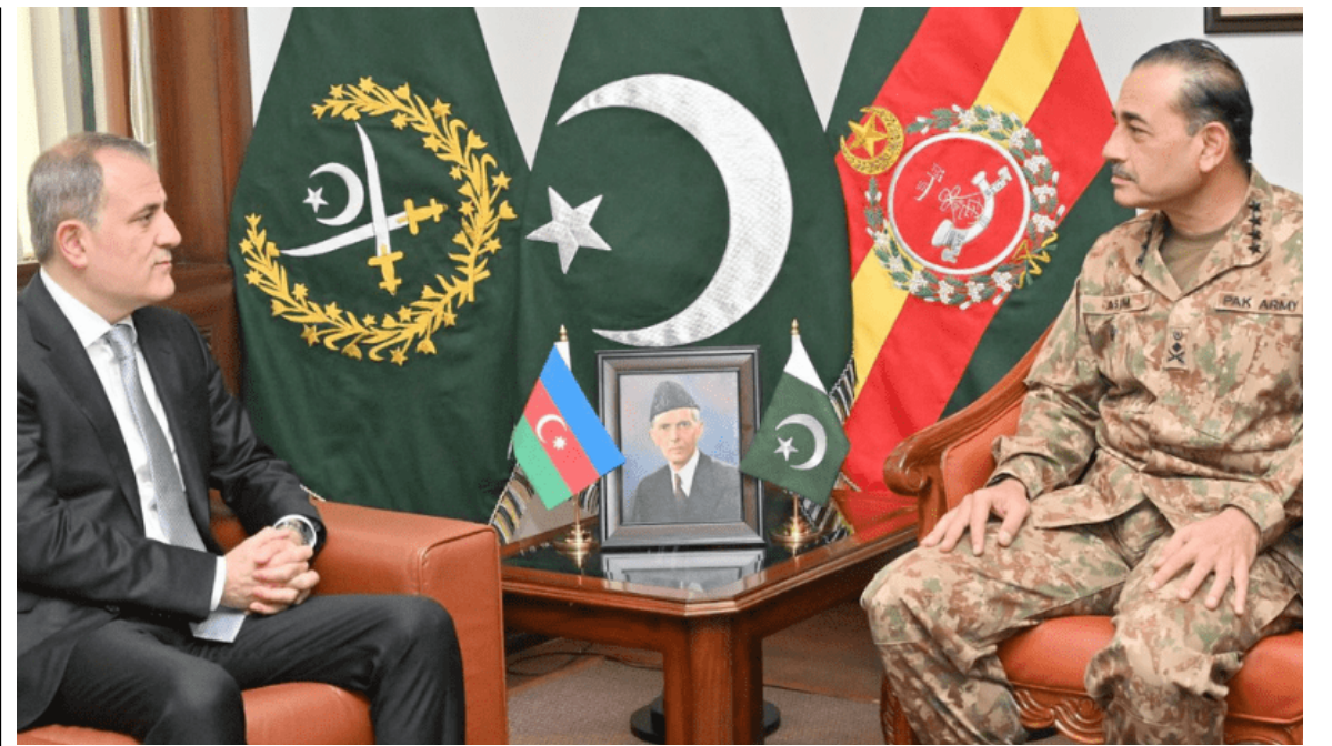
RAWALPINDI: Azerbaijan Foreign Minister Jeyhun Bayramov called on Chief of Army Staff General Asim Munir at the General Headquarters (GHQ).