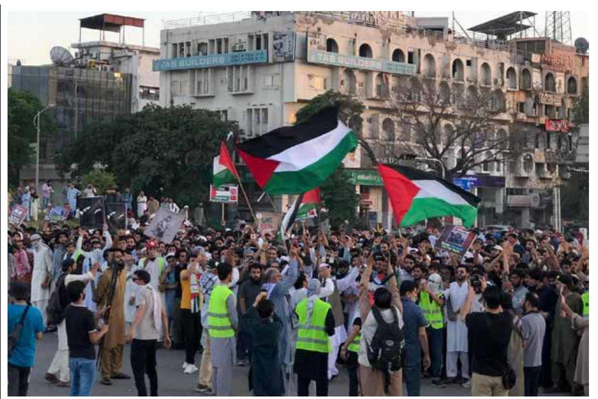
ISLAMABAD: Large number of people gather at D-Chowk to protest against the Israeli terrorism in Gaza and demand to stop the Rafah operation.