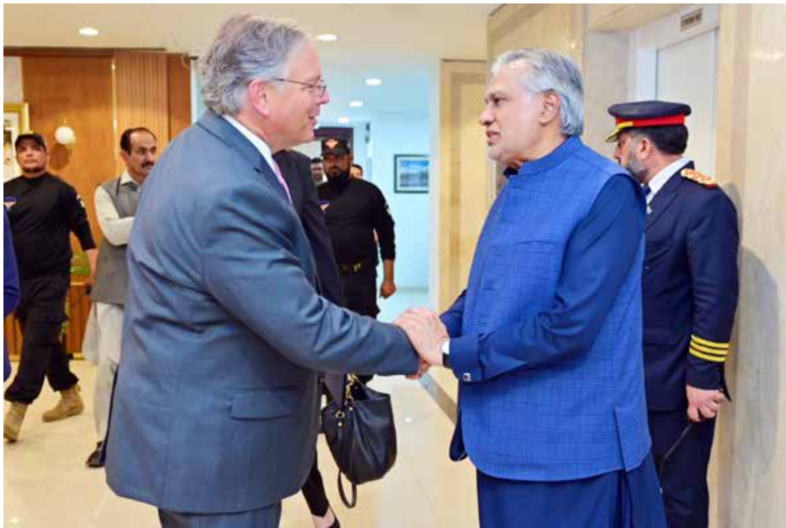
ISLAMABAD: US Ambassador Donald Blome calls on Deputy Prime Minister and Foreign Minister Senator Mohammad Ishaq Dar.