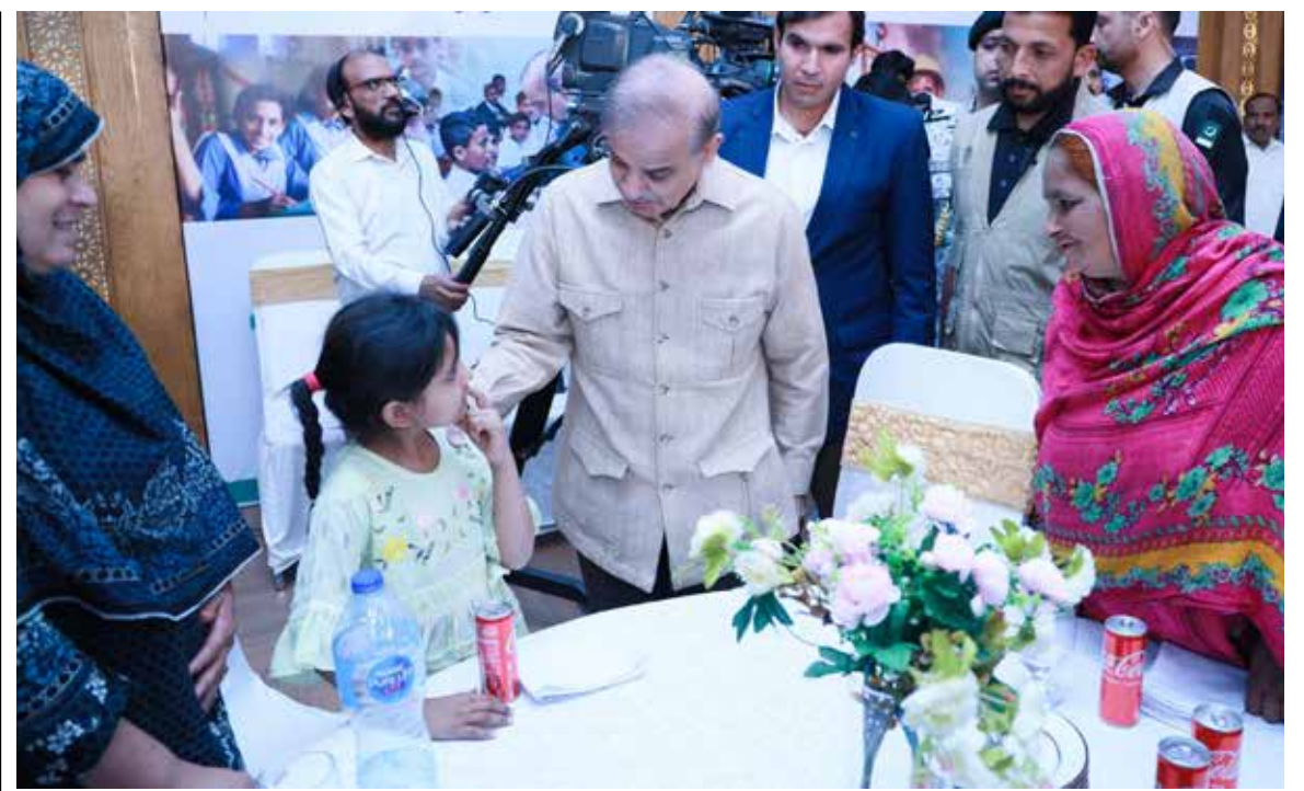
LAHORE: Prime Minister Shehbaz Sharif interacting with workers and their families at a luncheon he hosted in their honour on the occasion of International Worker's Day.

KARACHI: Pakistan People's Party (PPP) Chairman Bilawal Bhutto Zardari has reiterated his party's resolve to continue efforts for workers' welfare. Addressing a ceremony in Karachi on Labour Day, the former foreign minister said the PPP will raise the salary of workers in Sindh and Balochistan in the budget. The elite businesses run because of workers, he said, adding that they should be rewarded for their hard work. "The PPP made a historic increase in salaries and pensions." It ended the anti-labour policies of dictators," Bilawal maintained. He also assigned Raza Rabbani the responsibility of activating the labour bureau. The PPP chairman said: "The public-private partnership projects in Sindh remained successful. "The Pakistan International Airline (PIA) should be run under a public-private partnership instead of privatization. "The finance minister is praising our private-public partnership."