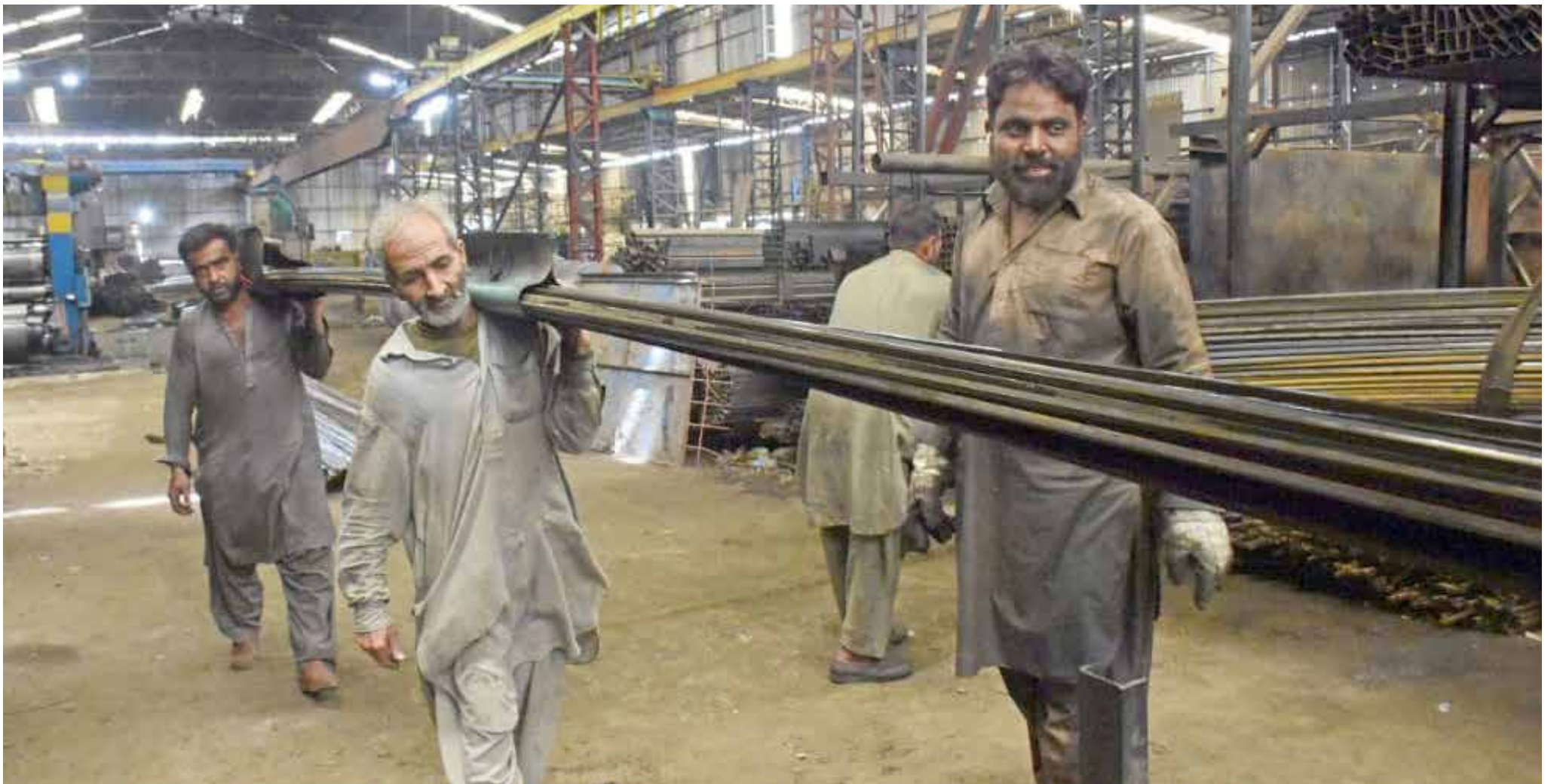
ISLAMABAD: Apr30-Workers performing laborious job without any safety measures in a local industry in Sector 1-9 of Federal Capital. Labour Day being observed all over the world on May 1, which roots back to the fight for workers' rights in the 19th-century United States. On May 1st, 1886, a massive strike erupted with nearly 200,000 workers demanding an eight-hour workday. This movement turned violent in Chicago, culminating in the Haymarket Affair. The Government of Pakistan has ratified 36 ILO Conventions, including 8 fundamental conventions, as of now. In the South Asian sub-region, Pakistan is the second country that has ratified all eight fundamental conventions as enshrined in the ILO Declaration on Fundamental Principles and Rights at Work, still Labours unable to get their rights in the country.