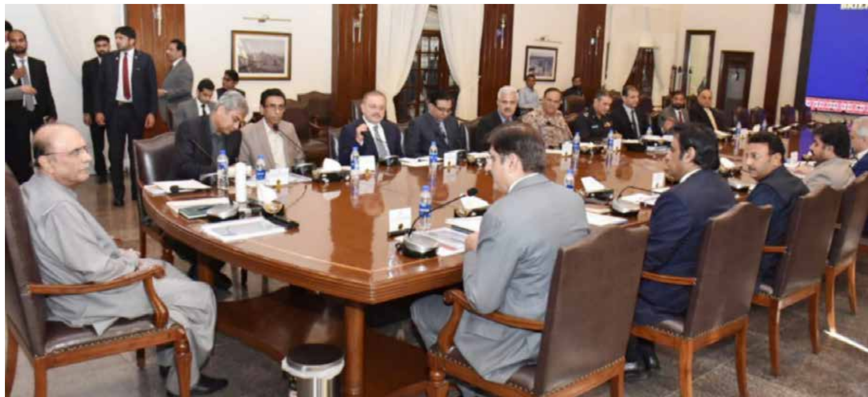
KARACHI: President Asif Ali Zardari chairing a meeting on security/law and order situation of Sindh at Chief Minister House.

LAHORE: Hundreds of students from different universities on Tuesday held a protest demonstration outside the US consulate against Israeli aggression in Palestine. Male and female students were wearing keffiyehs (a Palestinian national symbol) to express unwavering solidarity with Palestinians and condemn the ongoing genocide perpetrated by the state of Israel with the support of the US. The students were carrying Palestine flags and placards inscribed with slogans against Israel and America and in favour of Palestine. The protest was led by the Progressive Students Collective (PSC) and joined by diverse groups of students, social and political activists, academics, artists, and concerned citizens from all walks of life, united in their demand for justice and freedom for Palestine.