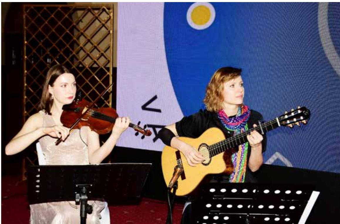
ISLAMABAD: Dutch musicians perform during a diplomatic reception in Islamabad.

ISLAMABAD, May 01 (APP): The Citizens Archive of Pakistan (CAP) commemorated its 16th anniversary with a grand celebration at the National History Museum, underscoring its steadfast dedication to preserving the rich heritage of Pakistan. Founded in 2007, the CAP has been at the forefront of safeguarding the nation's history, culture, and identity through its innovative initiatives. The CAP's pioneering oral history program, launched in 2008, stands as a testament to its commitment to capturing the diverse narratives that shape Pakistan's collective memory. With over 5,000 oral histories and 600,000 images in its digital archive, the CAP has curated a treasure trove of invaluable resources for researchers, students, and the public. A notable highlight of CAP's legacy is the National History Museum (NHM) Lahore. —APP