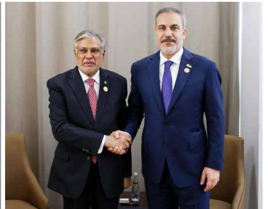
BANJUL: Deputy Prime Minister and Foreign Minister Senator Mohammad Ishaq Dar met with Turkish Foreign Minister Hakan Fidan, on the sidelines of the 15th OIC Islamic Summit Conference in Banjul, the Gambia.