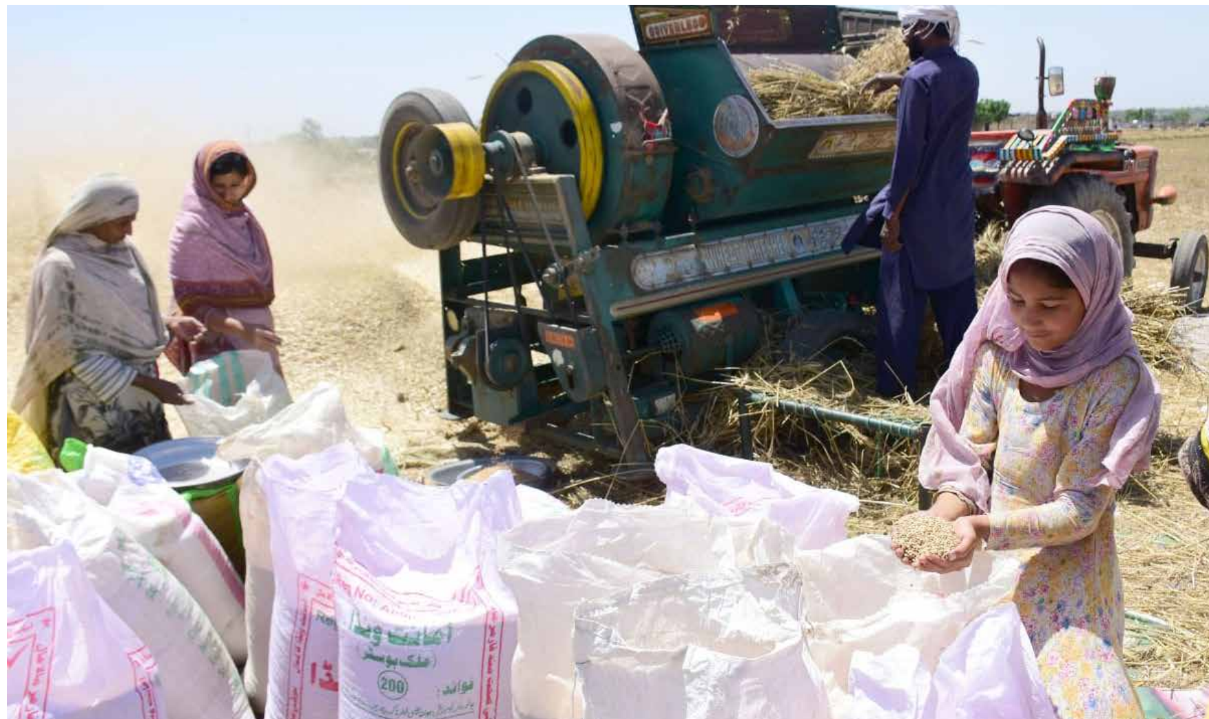
ISLAMABAD: Farmers harvesting wheat crop in the Golra area of Federal Capital.