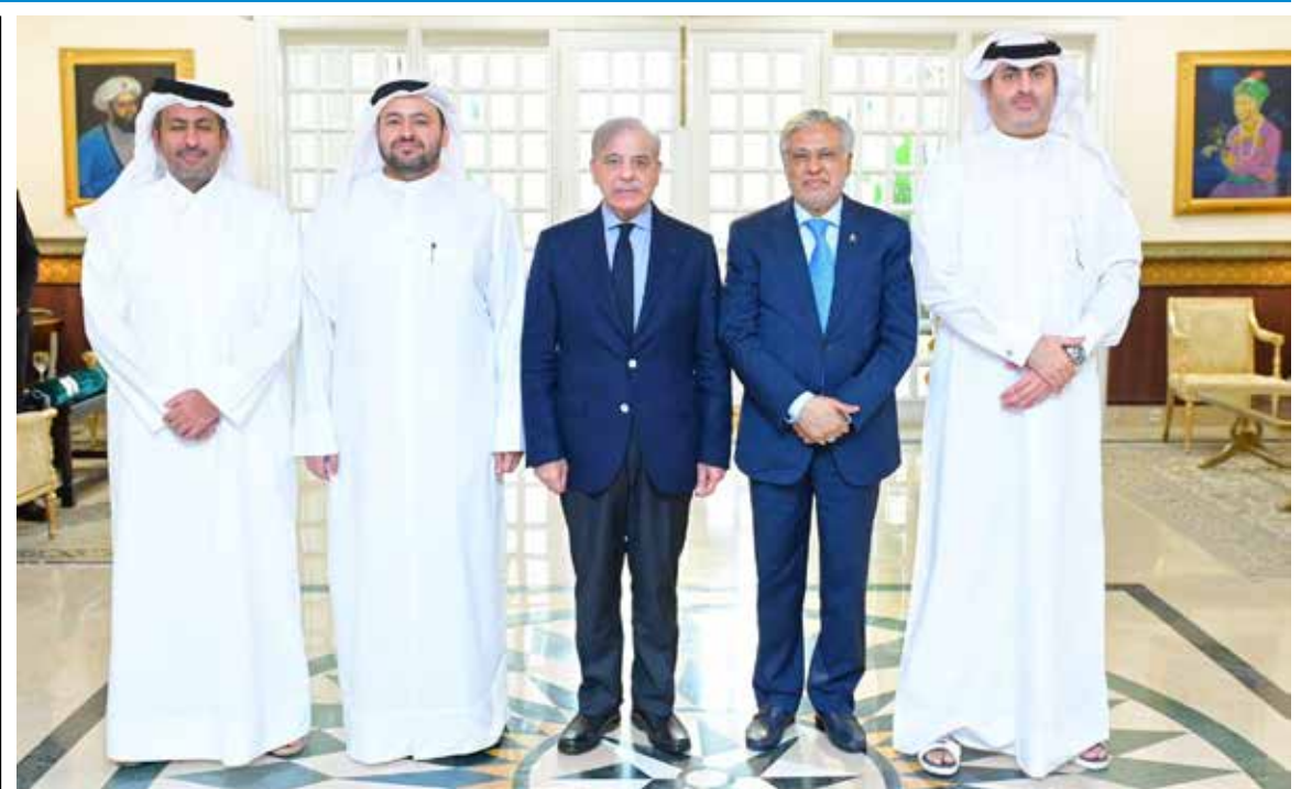
ISLAMABAD: Minister of State for Foreign Affairs H.E. Dr. Mohammed bin Abdulaziz Al-Khulaifi calls on Prime Minister Muhammad Shehbaz Sharif.