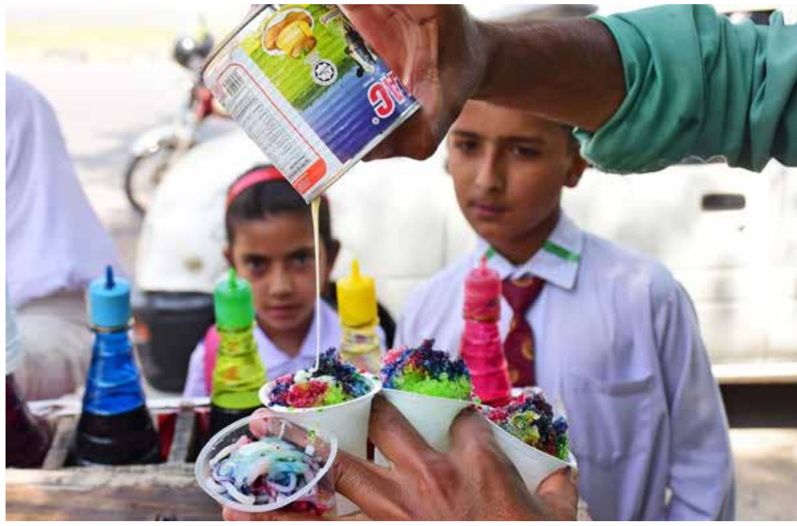
ISLAMABAD: A vendor is preparing colorful ice Gola for students outside a government school during hot weather in the Federal Capital.

"We know each other really well. That's why I feel we're synchronised from the very beginning in terms of what we want to do, how we want to approach the programme of training on and off the court. With Nadal as well," Djokovic added. "I'm pleased with the way the last 10-14 days went in terms of training, in terms of preparation and looking ahead to this tournament, but particularly Roland Garros, Wimbledon and the Olympic Games."